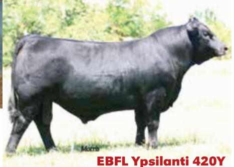
Sire of Lot 27B Embryos