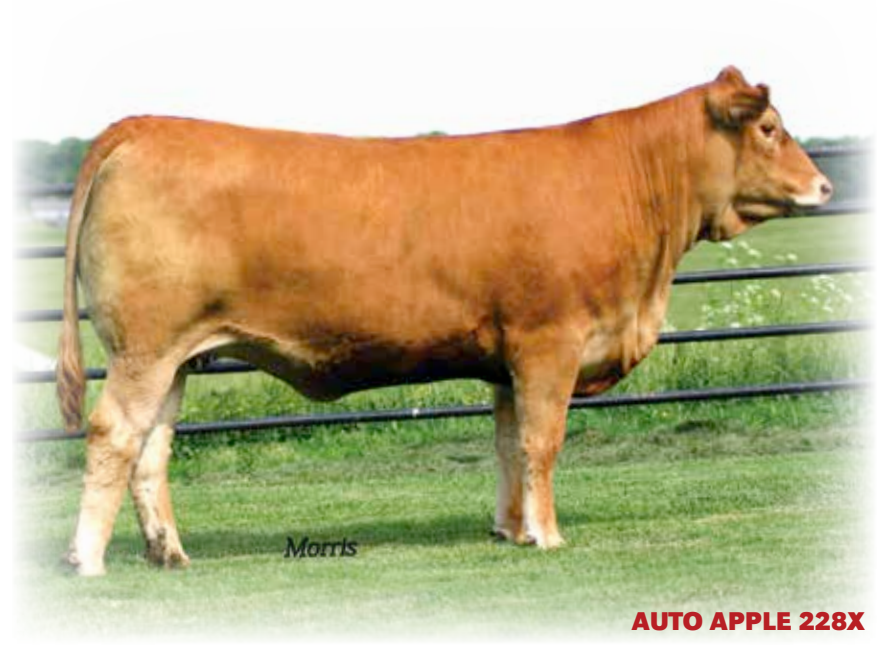
Dam of Lot 12 embryos selling