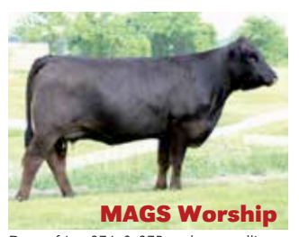
Dam of Lot 27A & 27B embryos selling