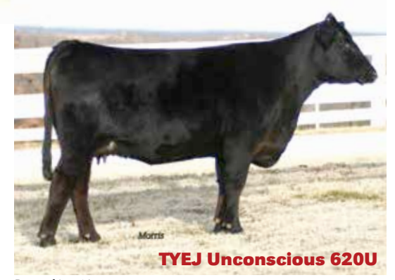
Dam of Lot 14