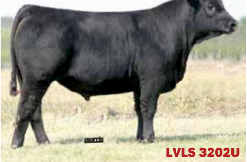
Sire of Lot 31