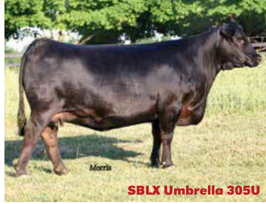
Dam of Lot 3