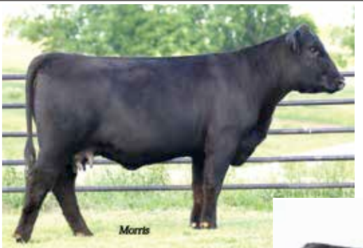
KRVN Uncut Jewel 112N