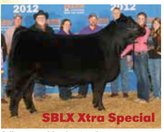
Full sister in blood to Lot 5