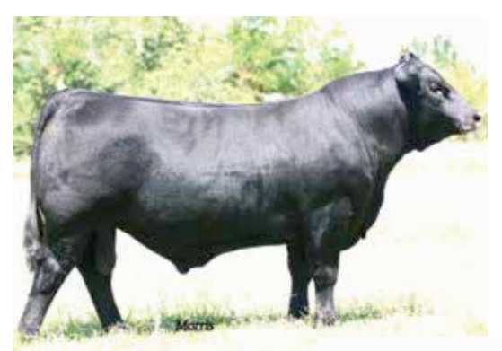
EBFL Ypsilanti 420Y