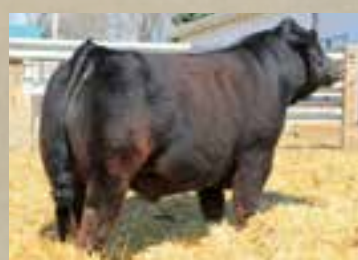
WULFS COMPLIANT K687C . Sire of Choice 4