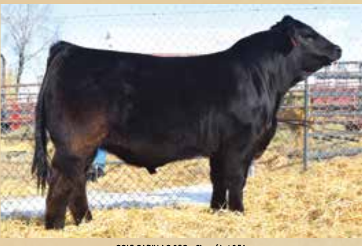
COLE CADILLAC 05C • Sire of Lot 35A