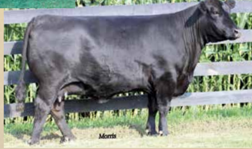
SSTO STARLA 6803S • Dam of Lot 24

COW LIM-FLEX (50) 9/17/2005 HOMO BLK(T) HET PLD(T) LFF1828767