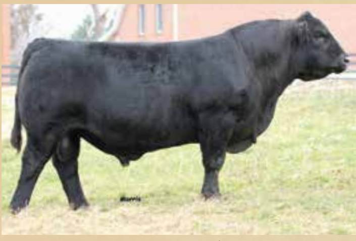
EBFL YPSILANTI 420Y • Sire of Lot 11