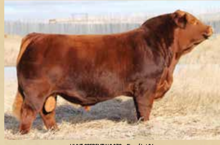
HUNT CREDENTIALS 37C . Sire of Lot 36

What a phenomenal genetic opportunity to invest in two of the finest homozygous polled, red Limousin and Lim-Flex matings ever created at Wulf Cattle! The feature donor, Wulfs Soloist 6284S, is highly predictable, stout-featured and THE cornerstone purebred female in the esteemed Wulf Cattle ET program. This marks your opportunity to attain genetics by her in these two exclusive matings which feature AI sires that represent the best of both the Limousin and Red Angus breeds— HUNT Credentials and Bieber Hard Drive. The blending of these exceptional genetics promises exciting results. Don't miss your chance to invest in these unique genetic packages.