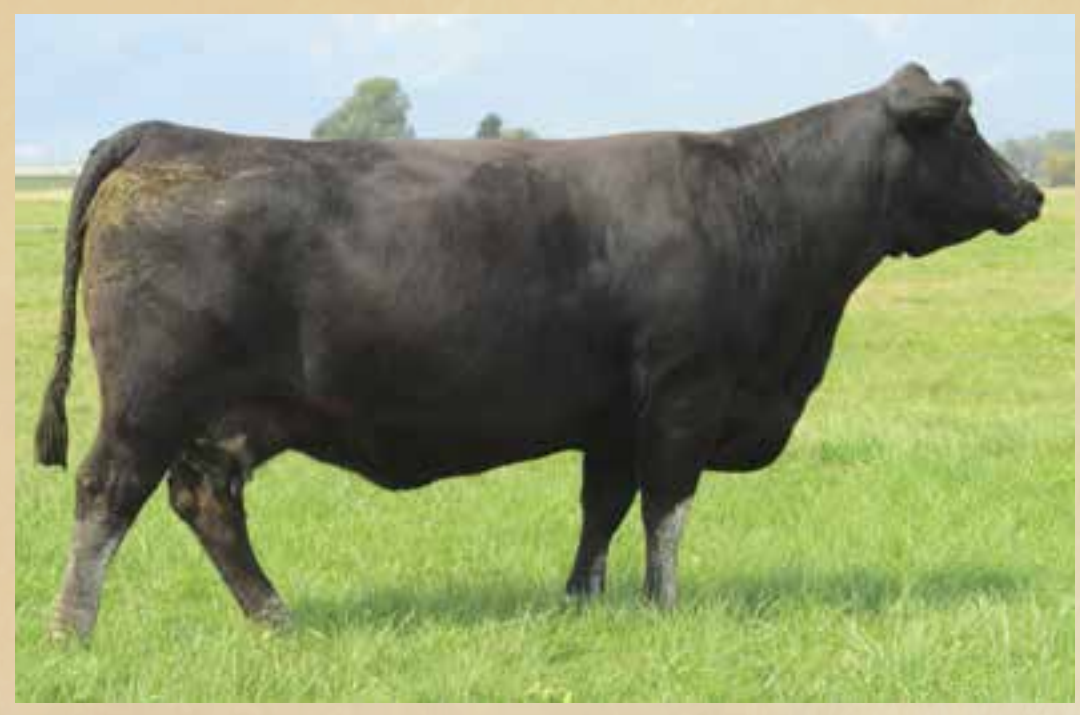
COLE MISS TRAVELER 029X • Dam of Lot 19A-19D

COW LIM-FLEX (50) 2/20/2010 HOMO BLK(T) HOMO PLD(T) LFF1969988