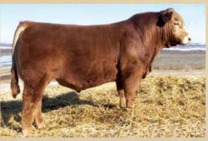
WULFS XCELLSIOR X252X • Sire of Lot 35B