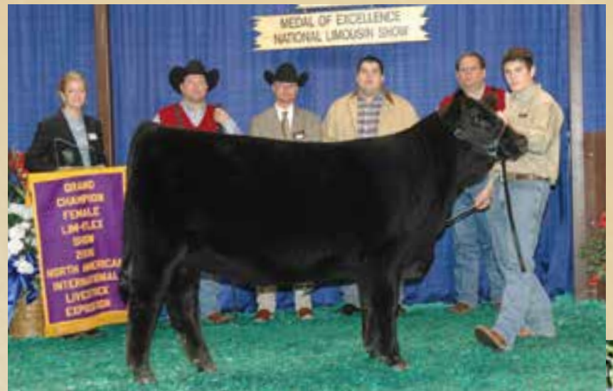
BOHI RED ROBIN • Lot 23 & Dam of Lot 23A