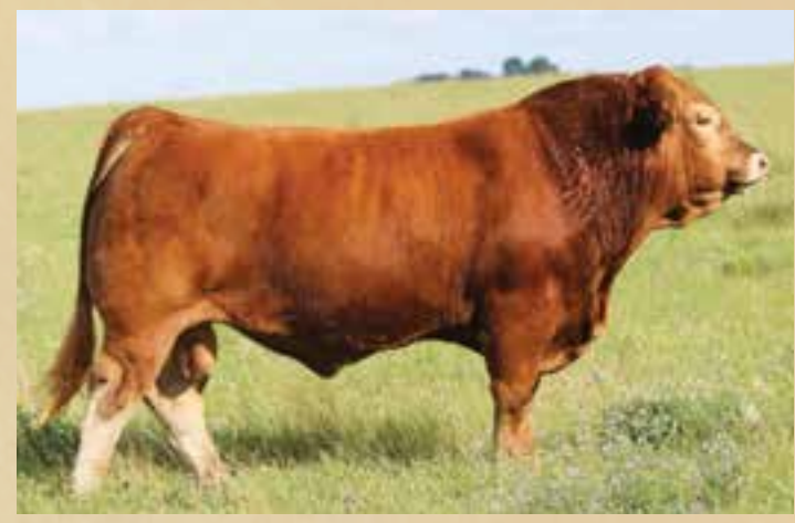
B BAR COGNAC 1B . Sire of Lot 33B