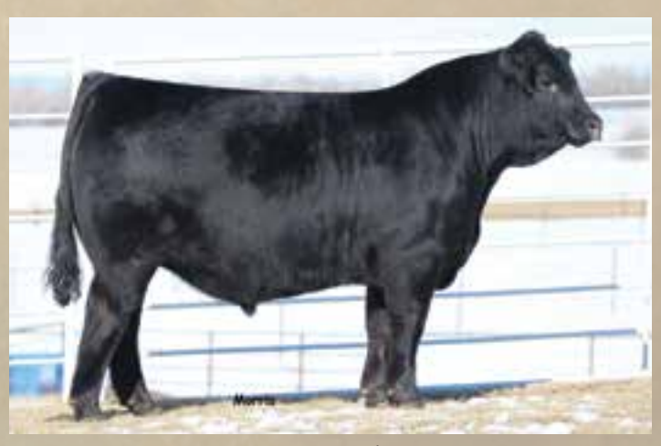
MAGS CABLE • Sire of Lot 30

Maternal siblings to Colt Cunningham's LH Belle 015B. These embryos are out of the proven Carrousels Piña Colada daughter, PBRS Touch Me Gently. These four double homozygous embryos are by the lead bull in the 2016 National Western Grand Champion Pen of Lim-Flex bulls, MAGS Cable.