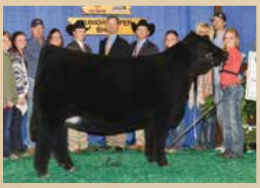
RIVERSTONE CHARMED • Daughter of Lot 21