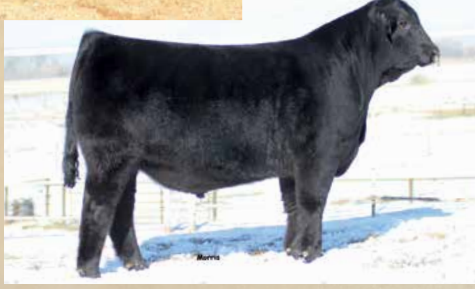
MAGS AVIATOR • Sire of Lots 31A & 31B and full-sib to Lot 32