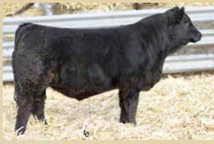
WZRK CORVETTE 3009C • Sire of Lot 33A