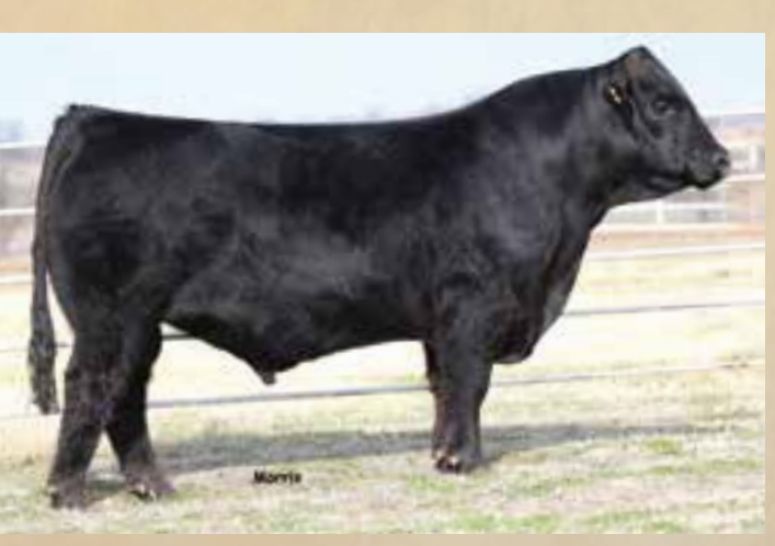
MAGS ANCHOR • Sire of Lot 12

Offered by: HAGER CATTLE CO., KARLSRUHE, ND