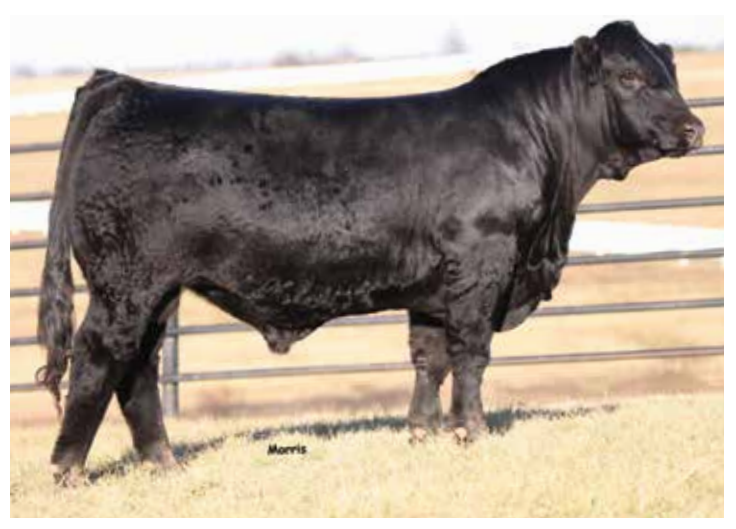
LOT 28 | AUTO SHARPER IMAGE 546C

Long-bodied, long-strided, deep and loaded with pedigree. This Black Coffee son has the "breeding bull" look to him. He is ready to turn out with cows and withstand the test of time over multiple breeding seasons. His sire was the top selection for Begert/Keetons and has been used successfully both artificially and naturally. His dam is a Y-Axis x Manuela female we think quite highly of.