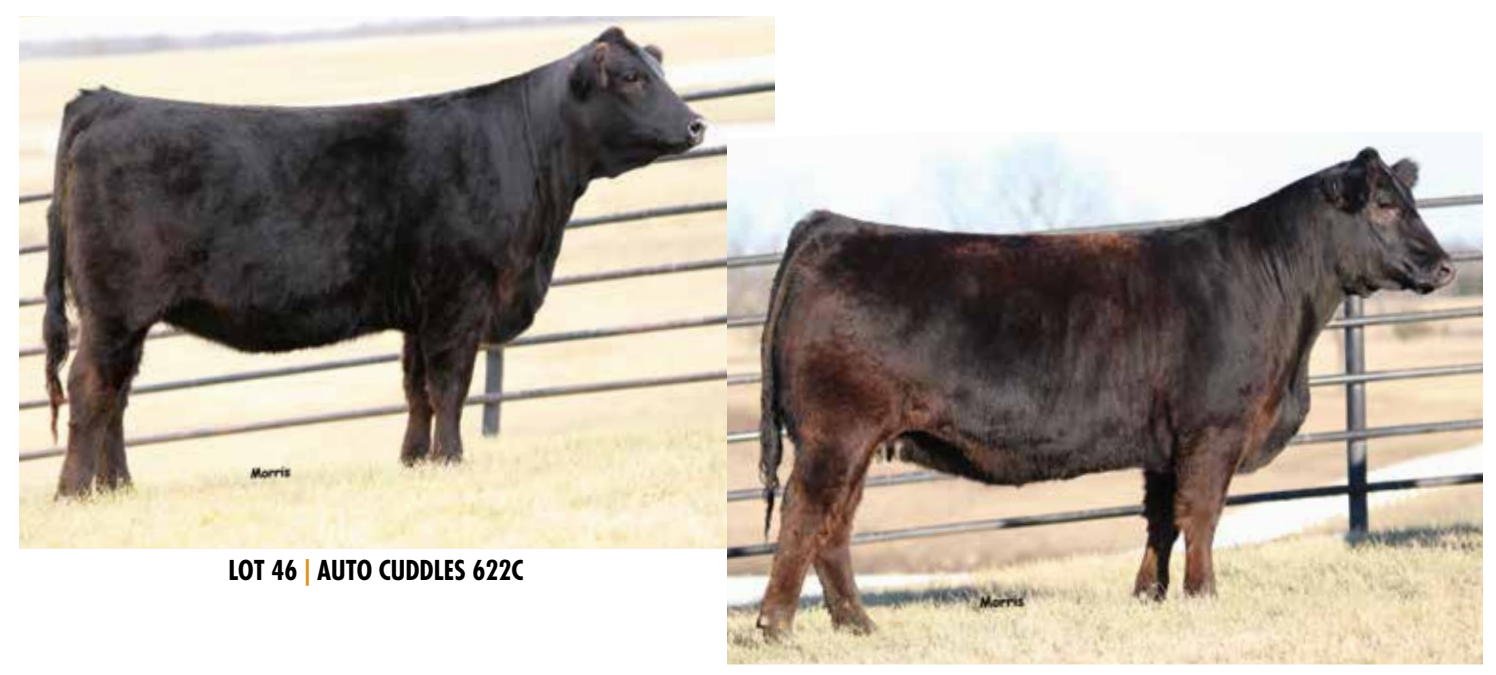
LOT 48 AUTO CAM 608C