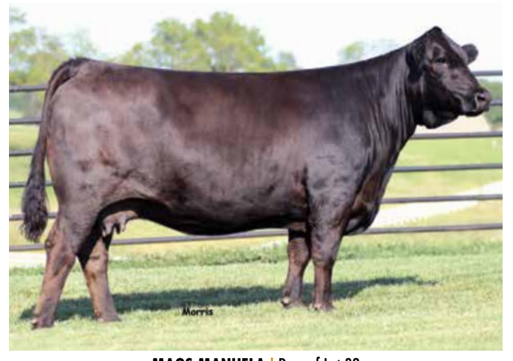
MAGS MANUELA | Dam of Lot 32

Here is a sale feature and one of the finest MAGS Manuela daughters to ever sell at auction. She is sired by the Red Angus sire PZC TMAS Red Zone 2795, a son of Red Northline Fat Tony from the Whitestone Lana V150 donor. This black, polled 50% Lim-Flex female ranks in the top 2% for MB with a .65 and SMTI with a 73. She also has a breedleading IMF scan number of 6.33 and still posts an REA scan data of 12.61 This female is as good as you can ever want one made. She is