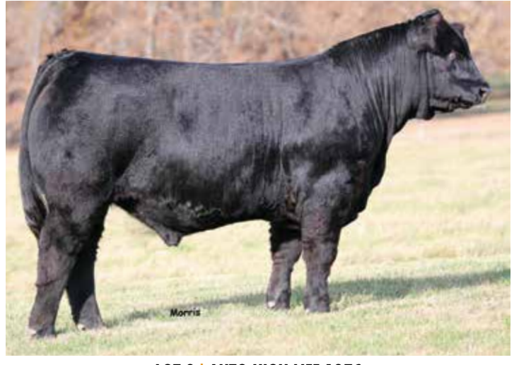
LOT 9 | AUTO HIGH LIFE 137C