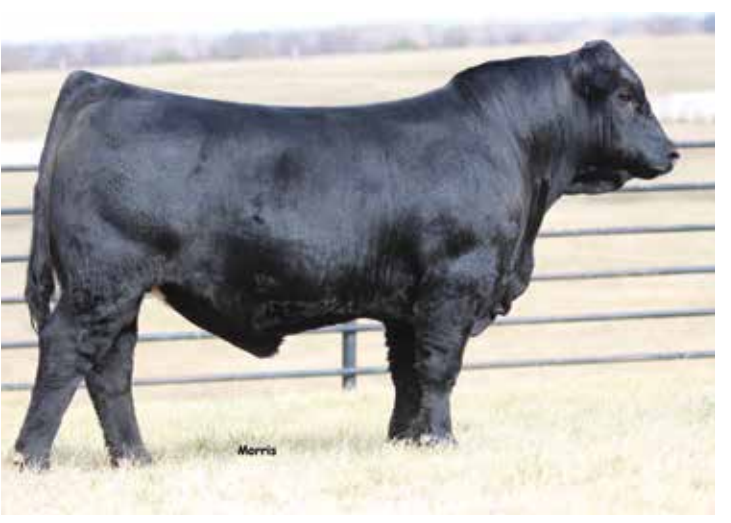
LOT 12 AUTO VIEWPOINT 152C

This 50% Lim-Flex herd-sire prospect is homozygous polled, homozygous black. If you are looking to add a uniform and stylish look to your offspring, consider this double homozygous bull. He is a son of the big-numbered Angus sire EXAR Counsel 1016B, a proven and stout-made son of Connealy Consensus. His dam is the once All-American Futurity Grand Champion Female, AUTO Luckie 246W who is now a proven and leading purebred donor in the Pinegar program.