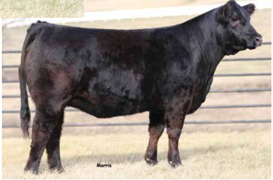
LOT 34 | AUTO CICI 633C