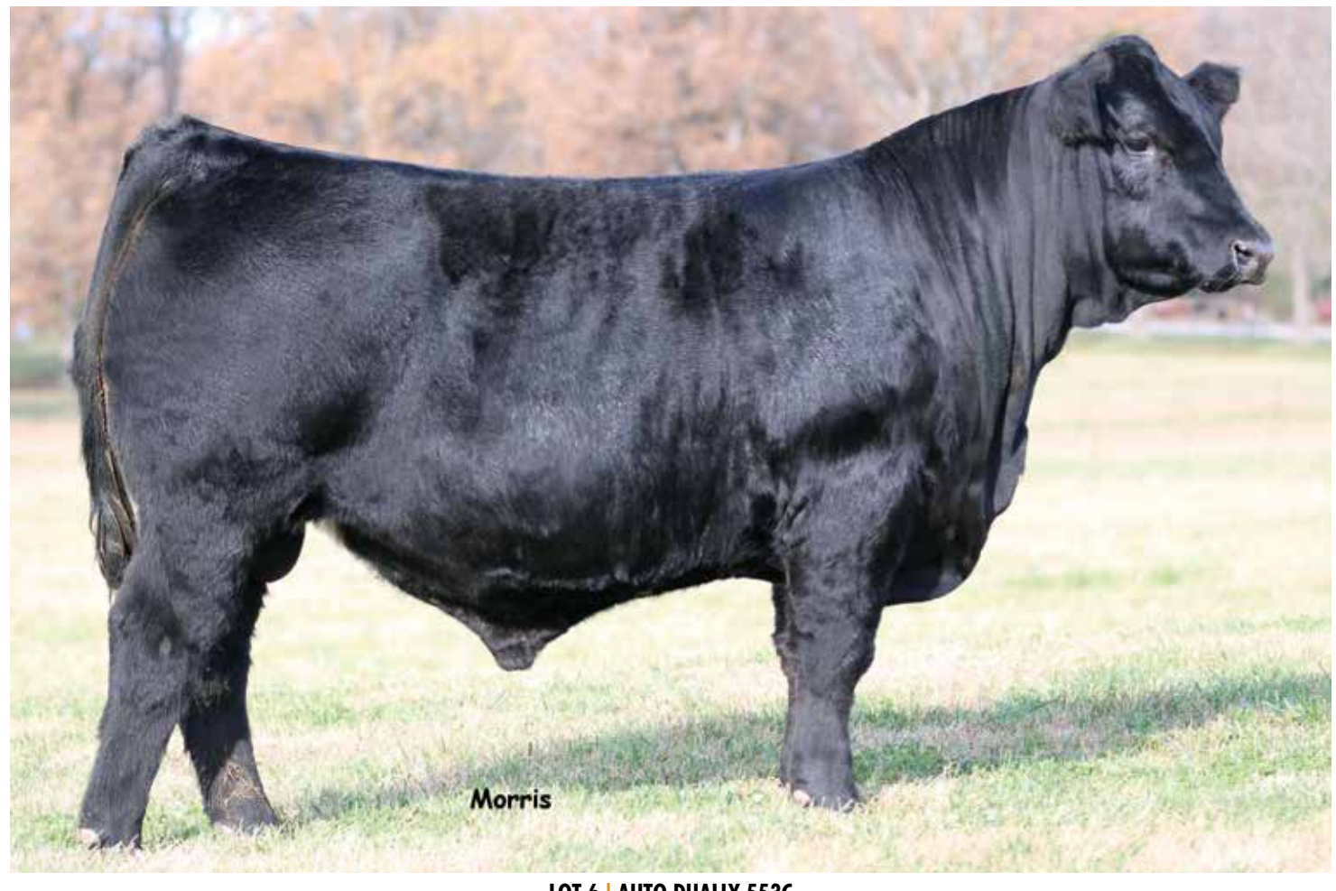
LOT 6 | AUTO DUALLY 553C