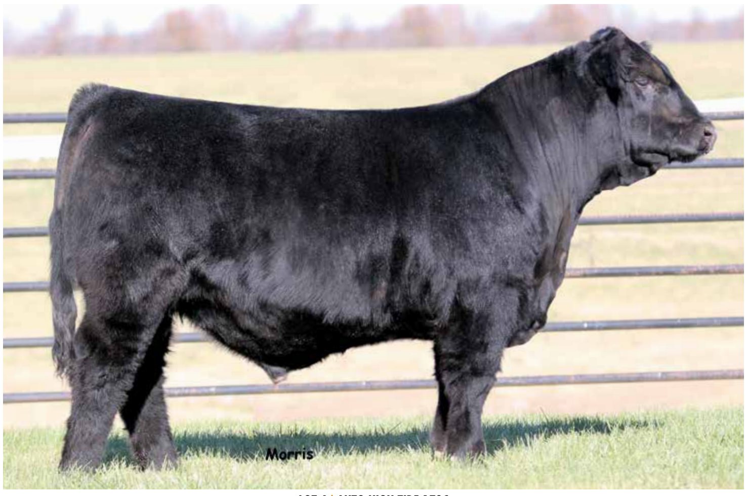
LOT 4 | AUTO HIGH TIDE 179C