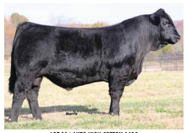
LOT 11 | AUTO HIGH COTTON 143C