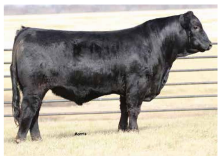
LOT 10 | AUTO POWER PLAY 561C

Here is an 81% Limousin bull who is has so much stacked in his favor! He is a son of MAGS Robin Hood 276Y and from a full sister in blood to the popular purebred bull AUTO Cruze. Take a look here; he ranks in the top 1% for MB with a 38 and TM with a 79, top 3% for WW with 83, YW with a 126 and CW with a 47, top 15% for SMTI with a 63. He also has a birth of 68 lbs., weaning weight of 850 lbs., yearling weight of 1,324 lbs. and scanned a 14.04 REA and 4.01 IMF.