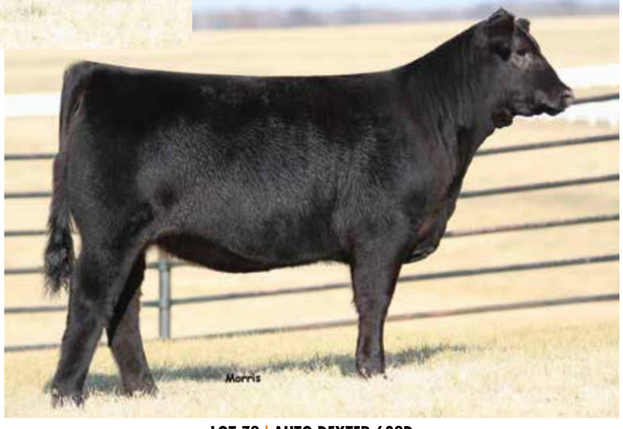
LOT 72 | AUTO DEXTER 632D