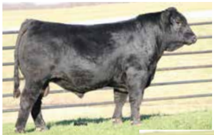
AUTO LODE UP 137B ET