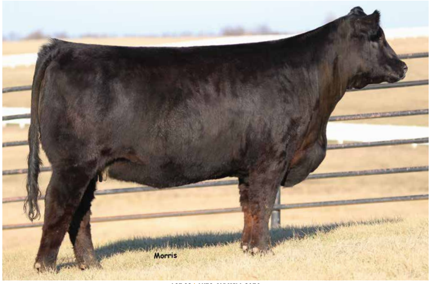
LOT 32 | AUTO CARMELA 207C