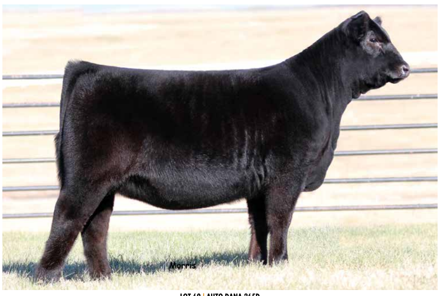
LOT 69 AUTO DANA 265D