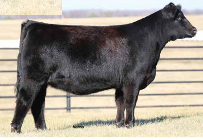
LOT 65 | AUTO CONCEAL 285C