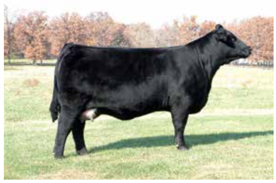
AUTO REBECA 292S | Dam of Lots 16 & 17