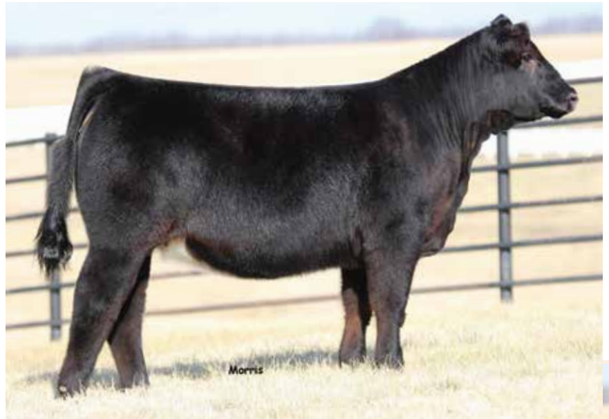
LOT 71 | AUTO DYNA 254D