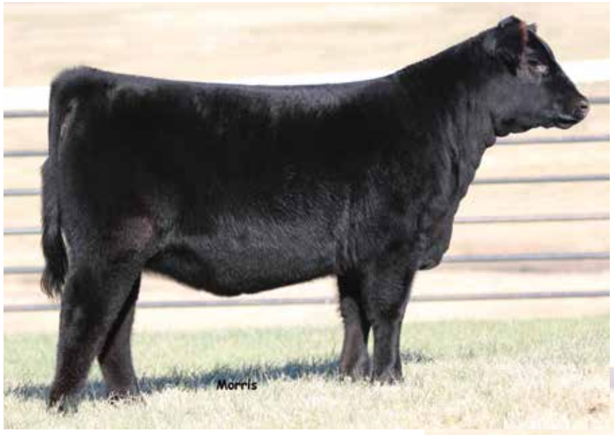
LOT 75 | AUTO DALLY 238D