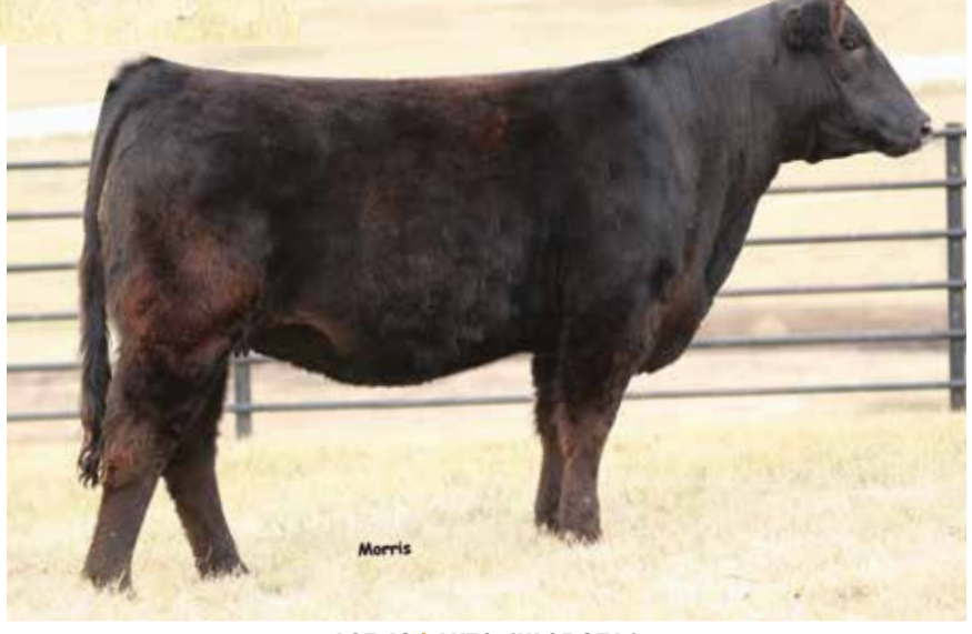
LOT 42 | AUTO CHLOE 276C