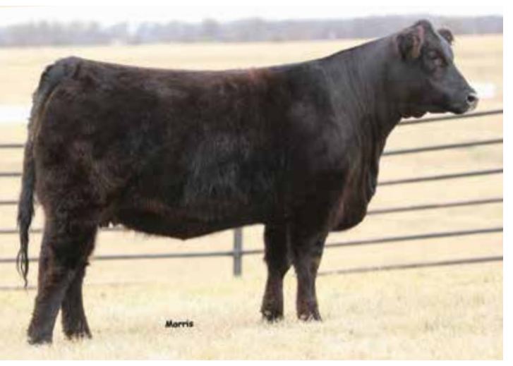
LOT 49 | AUTO CERISE 621C

615C has had that brood cow luck since the day we preg checked, she bellied down early and impressed us with the female she has turned into the past few months. We knew all along she had the ability to be a great one, and she looks the part. These EXAR Counsel calves haven't let us down either, they are consistently good. One of the major advantages of using Counsel is the tremendous marbling traits he brings to the equation, in AUTO Cotter's case, she ranks in the top 1% for both MB and SMTI.