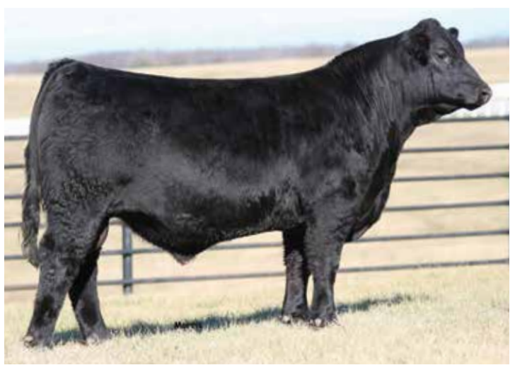
LOT 14 AUTO ROADSTER 104D

Wow! What a gorgeous profile, unique design and excellent structure found within this young herd-sire prospect who just happens to represent a very predictable and proven pedigree. He is sired by the ever-popular Lim-Flex sire TMCK Hydraulic, a big-numbered son of SAV Pioneer and from the elite Riverside Valley Farm donor, SBLX Maria 662Y. She is a daughter of SAV Providence from the famed and now deceased MAGS Manuela. This bull has it all—he is ranks in the top 2% for CW with a 50, top 3% for YW with a 126, WW with an 80, and top 10% for SMTI with a 66.