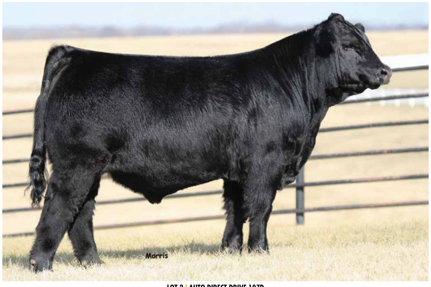
LOT 2 | AUTO DIRECT DRIVE 107D