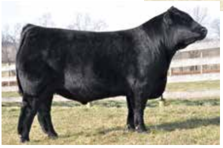
EF XCESSIVE FORCE