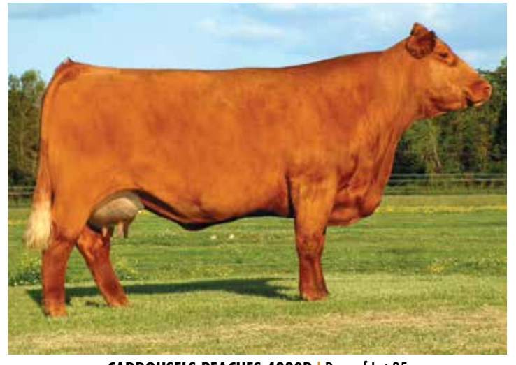
CARROUSELS PEACHES 4330P | Dam of Lot 35

What a great donor female in the making! AUTO Copy Cat 218C is an extremely well-made female from the heart of the 26-year running program at Pinegar Limousin. She is a daughter of the Angus sire PVF Insight and from the elite Pinegar donor Carrousels Peaches, the full sister to the once national champion Carrousels Piña Colada. This female ranks in the top 1% for REA with a .99. She scanned a 13.43 for REA and 3.56 for IMF. AUTO Copy Cat 218C is moderate in