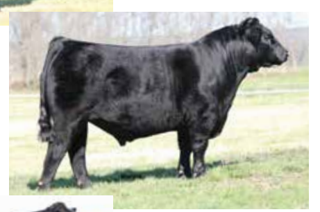
AUTO REAL DEAL 150B