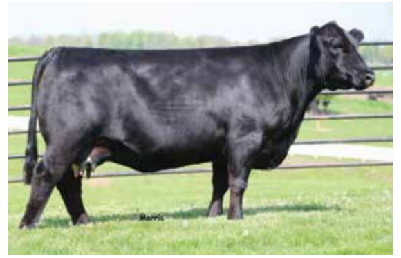
PBRS DUTCHES 790X | Dam of Lots 22 - 25

much guesswork in AUTO Right Kind 249C's potential for genetic impact with a pedigree like this!