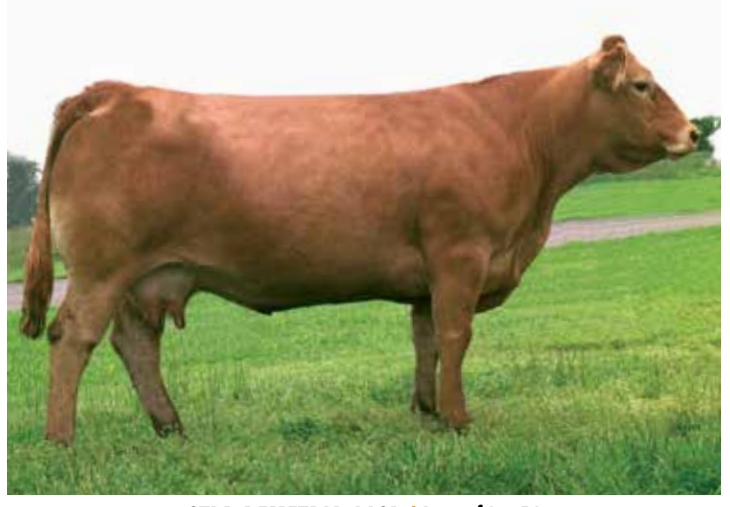
STBR DEMETRIA 669D | Dam of Lot 54

A full sister to Lot 53, AUTO Camile 261C has an impressive historical fullblood pedigree that is still popular today. Staying true to the original purpose of the Fullblood Limousin cattle, 261C ranks in the very top 1% of the breed for YG and FT.