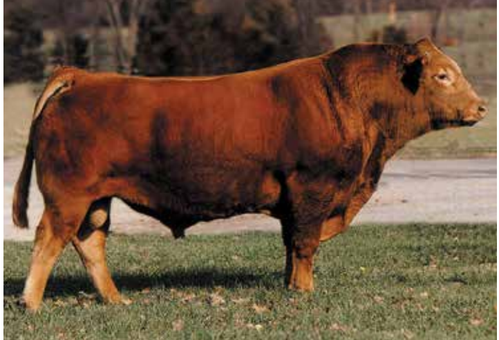
AUTO CLIFF HANGER 194D | Service Sire to Lot 55