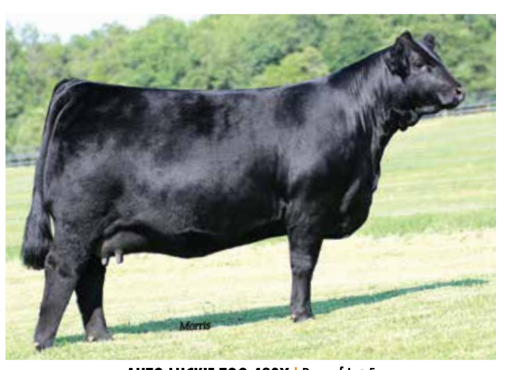
AUTO LUCKIE TOO 423Y | Dam of Lot 5

Muscle and extreme power is what you get when you consider this purebred Limousin bull, AUTO Sharp Shooter 176C. He is one the farm's favorites and rightfully so. He just happens to be sired by the leading purebred bull AUTO Cruze 132Z. Cruze is not on the open market and his semen is highly sought after by some of the breed's most discriminating cattlemen. AUTO Sharp Shooter 176C is a full brother to the top-selling bulls in last year's Pinegar sale. They were AUTO Real Deal 150B and AUTO Sure Deal 149B