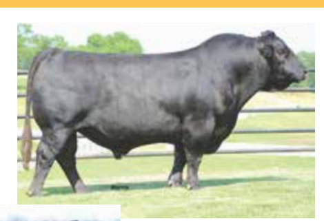
AUTO GUNN POINT 192Y