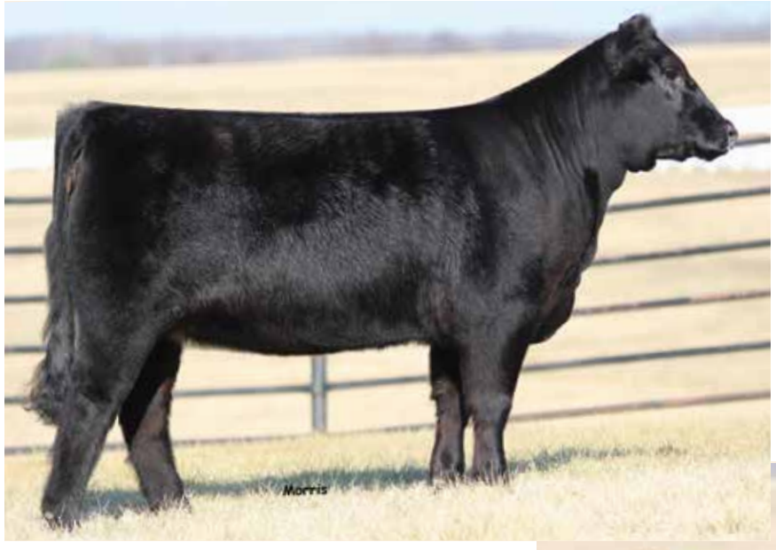
LOT 73 | AUTO DOT 227D