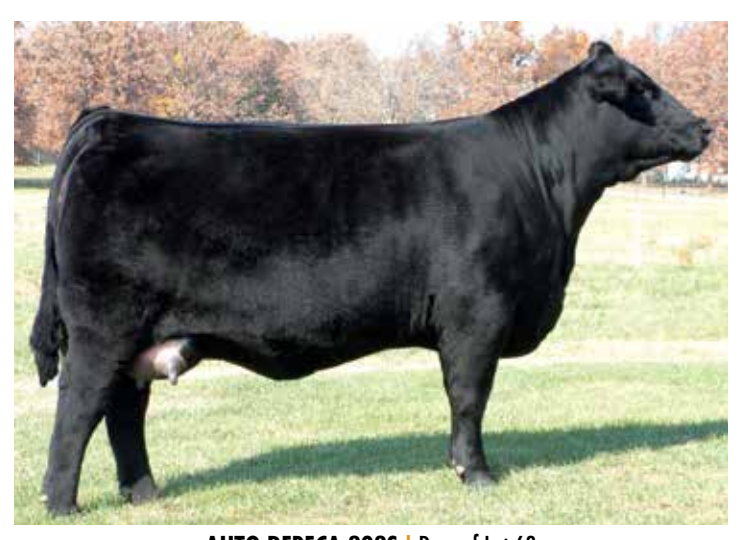
AUTO REBECA 292S | Dam of Lot 68

This 37% Lim-Flex heifer is more than homozygous polled and homozygous black. She is bred to be a future donor for any progressive program. She is a daughter of EXAR Blue Chip 1877B, the ever-popular and proven son of Dameron First Class. Her dam is the famed and proven Pinegar donor, AUTO Rebeca 292S. This young heifer is near perfect in her design and coupled with her predictable pedigree makes for a sure investment for any program.