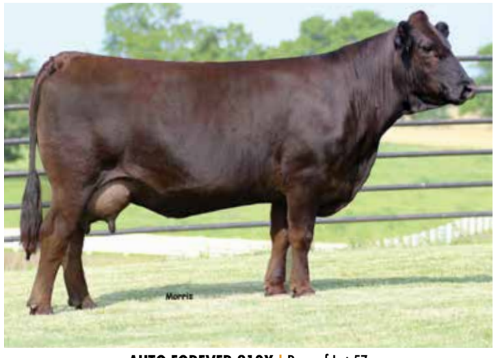
AUTO FOREVER 219X Dam of Lot 57

AUTO Carmel 445C is a 50% polled, homozygous black bred female who is sure to impress the many that will be available sale day. She will be highlighted under the notorious yellow tent where she will have several admirers. She is a daughter of EXAR Classen 1422B and from the leading Pinegar donor AUTO Forever 219X, the proven daughter of DHVO Deuce from MAGS Manuela. Her future calf sired