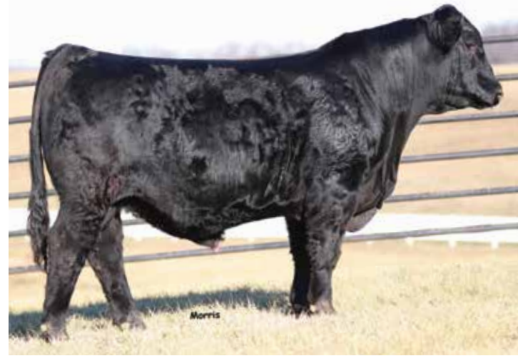
LOT 8 | AUTO HIGH CALIBAR 165C

AUTO High Caliber is a 50% Lim-Flex black, polled beef bull. We admire and appreciate his overall mass, extreme depth of body and the amount of fore rib he has. He is a true breeding bull. Look at the amount of thickness and mass he has down his top and out of his hooks to pens. This son of SAV Brilliance 8077 is from one of the very best Pinegar donors, AUTO Forever 219X. She is a daughter of the National Champion DHVO Deuce and from the now deceased MAGS Manuela. AUTO High Caliber 165C ranks in the top 15% in SC with a 1.10, MB with a .29 and SMTI with 61.