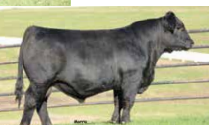
AUTO POWER PLUS 133B ET