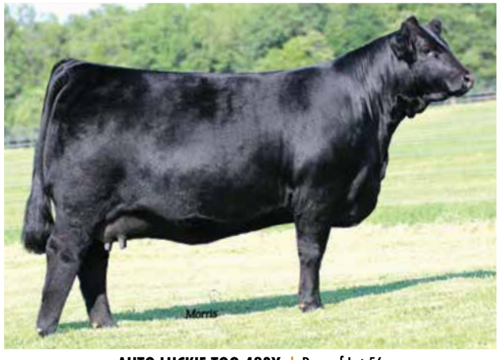
AUTO LUCKIE TOO 423Y | Dam of Lot 56

Oh boy where do we start and where do we end when it comes to talking about the attributes of this female to the seedstock business. She is nothing but the best and one of the finest to every grace the pastures at Pinegar. This 50% Lim-Flex heifer is moderate in her frame score and easy in her fleshing ability. We admire her from the ground up and the softness in her pasterns and fluidity in her movement. For a shorter bred female to possess this much rib shape and volume is unheard of at her stage of life. She is sired by the big-numbered purebred Angus sire PVF Insight 0129 and from the many-time