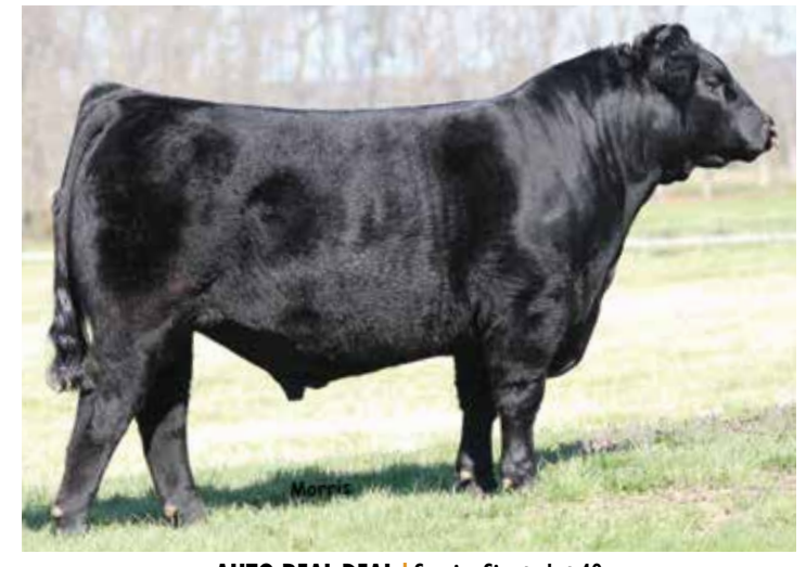
AUTO REAL DEAL | Service Sire to Lot 40

This Lim-Flex heifer is the result of the blending of two of the very best purebred Angus lines of cattle in Connealy Consensus and Rito 112 of 2536. This daughter of MAGS Acapulco is from the female MAGS Abeda. She just happens to be one of the highest marbling females in the entire breed ranking in the top 1% with a .83 and SMTI with an 80. She also scanned a 6.33 for IMF. If you want to buy into a female