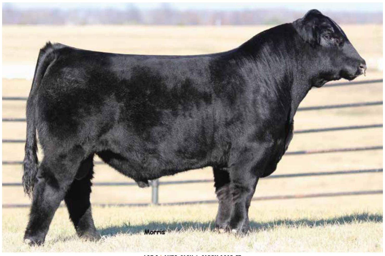
LOT 3 | AUTO CASH & CARRY 101D ET