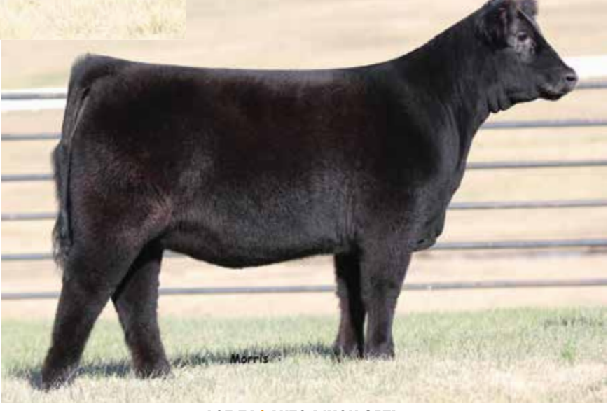
LOT 74 | AUTO DIXON 257D