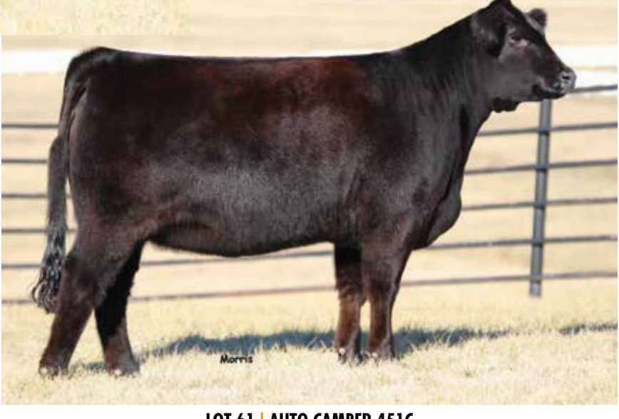
LOT 61 | AUTO CAMBER 451C