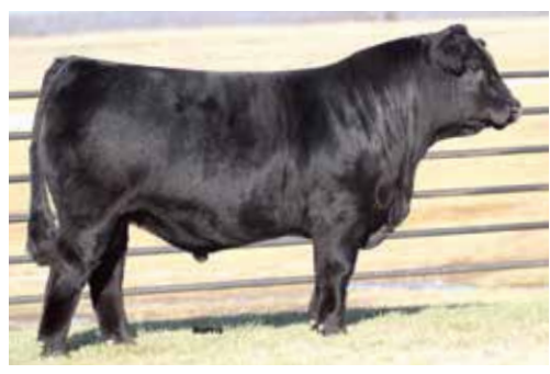
AUTO KING JAMES 162Z | Sire of Lot 48

Quite simply summarized, here is a daughter of the great high percentage sire, AUTO Cruze 132X who posts a 0 for BW, 103 for YW and in the top 20% for MB and SMTI. AUTO Cynthiana 619C is a homozygous polled, homozygous black 75% Lim-Flex female who ratioed a 104 for REA and 101 for IMF at scanning time.