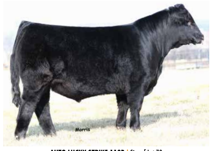
AUTO LUCKY STRIKE 118B | Sire of Lot 70

This black, polled 85% Limousin heifer is sired by the once All-American Futurity Champion Bull AUTO Lucky Strike 118B. He is the leading sire for P Bar S Ranch where they are experiencing his positive influence in their program. He is the big-numbered son of LH U Haul from the past All-American Futurity champion AUTO Luckie 246W. These two champions have been blended together to create what