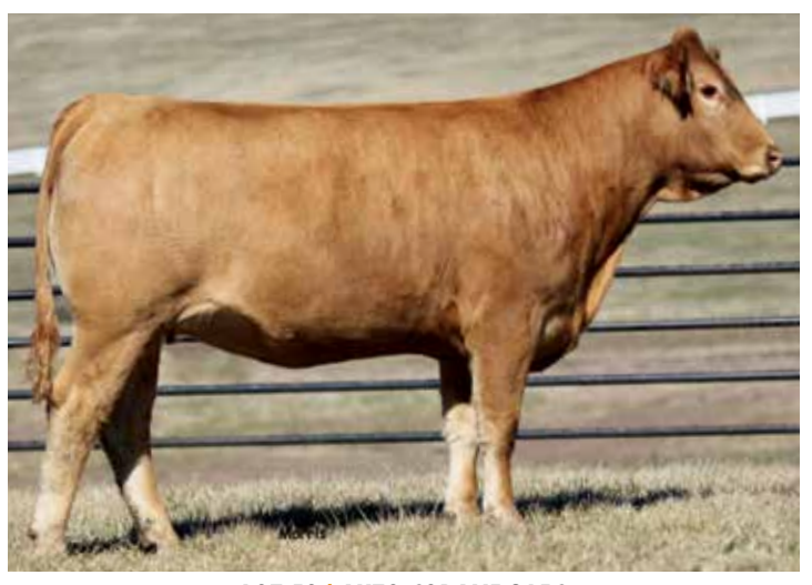
LOT 53 | AUTO CORALIE 265C