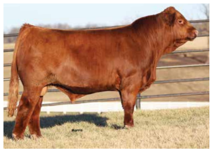
LOT 15 AUTO WRANGLER 549C

Full brother to Lot 13 and one amazing herd sire prospect. This 42% Lim-Flex blends two of the breed's finest purebred Angus lines together in SAV Proneer and SAV Providence and blends two of the breed's top purebred Limousin in HSF Wall of Fame and MAGS Manuela. This TMCK Hydraulic son ranks in the top 2% for YW with a 128, CW with a 50, top 3% for WW of 82, top 10% for SC with a 1.20 and SMTI with a 67. His cool look, flawless design and excellent structure make him a powerful lot in this breed-leading sale.