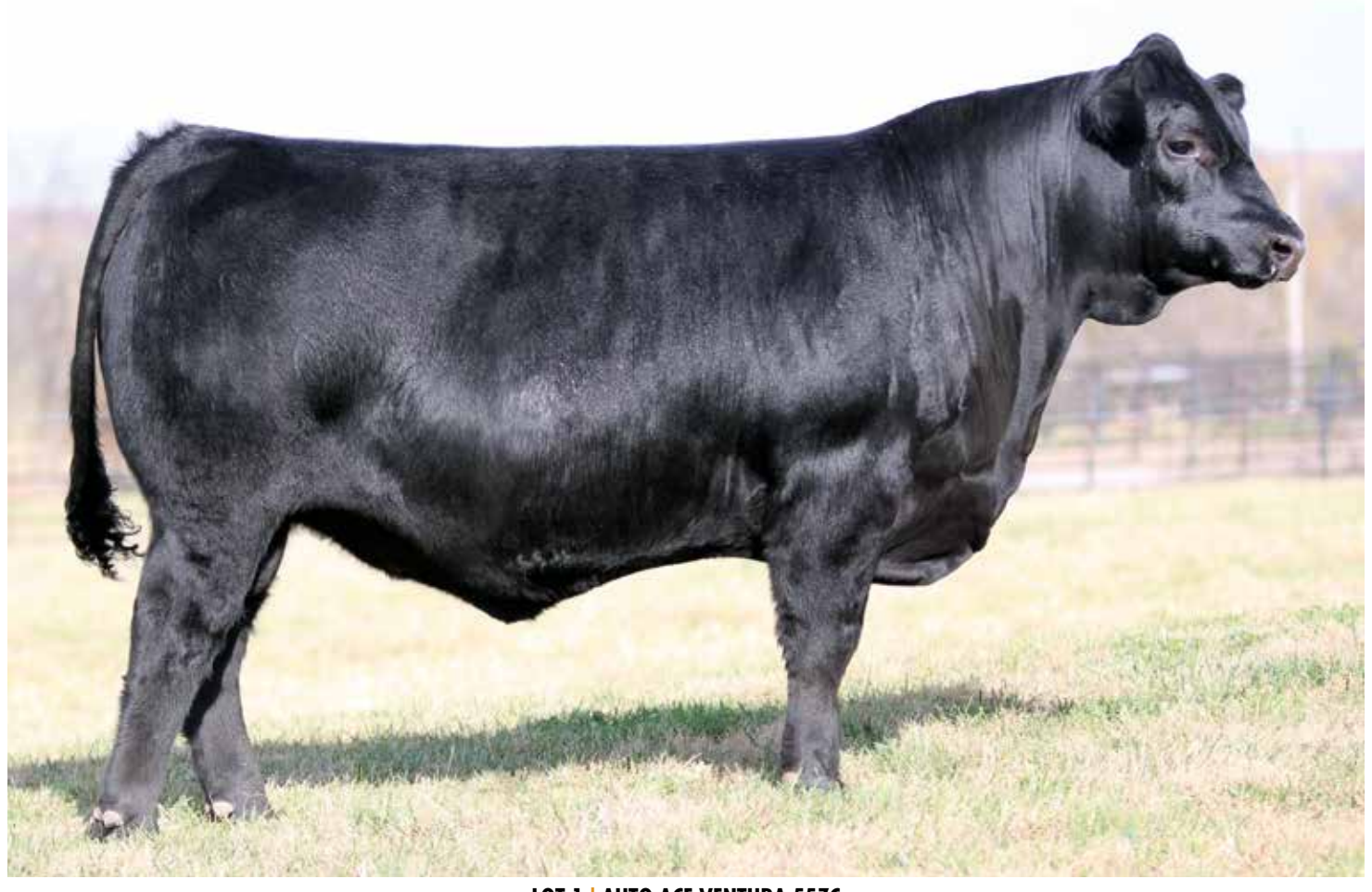
LOT 1 | AUTO ACE VENTURA 557C