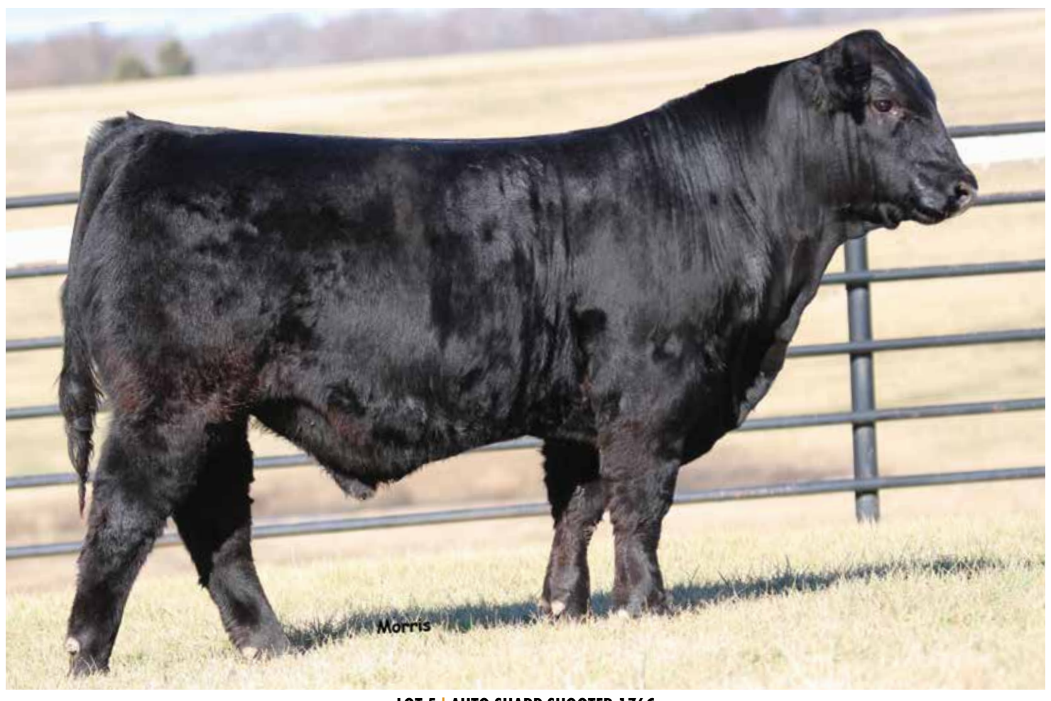
LOT 5 | AUTO SHARP SHOOTER 176C