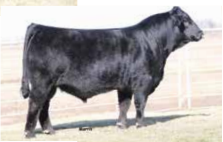
MAGS ALL-STAR 700A