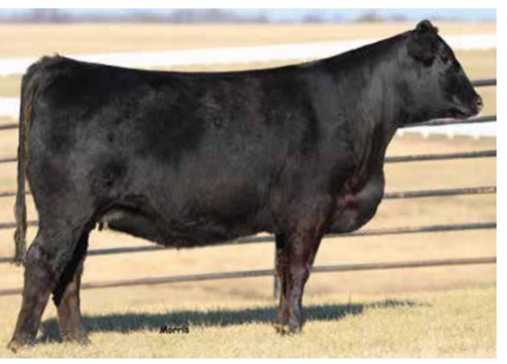
LOT 52 | AUTO COTTER 615C

From the same cow family as Carrousel Peaches and Carrousel Piña Colada, AUTO Coraline has pretty substantial shoes to fill, however we are confident she can do it! Thus far, she hasn't let us down in terms of phenotype and disposition; we have faith in her inherited mothering ability and proven pedigree. You see, not only does she go back maternally to ELMW Ginnie, she also goes back to EXLR Luvly 821M on her sire's side.