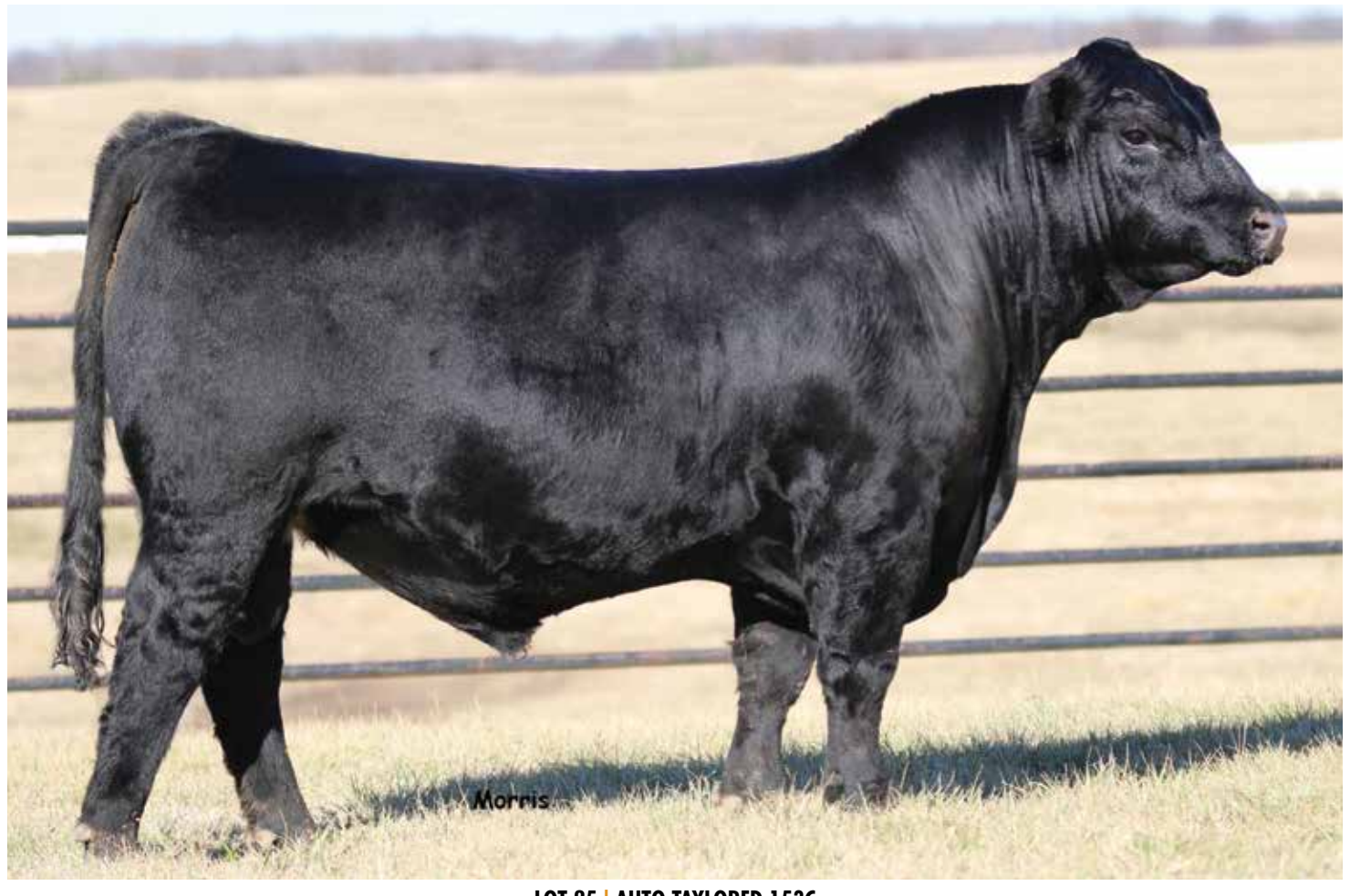
LOT 25 | AUTO TAYLORED 153C