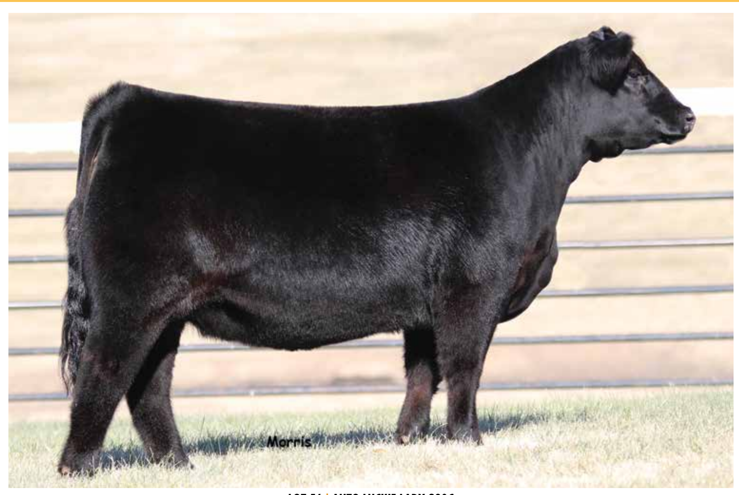
LOT 56 | AUTO LUCKIE LADY 280C