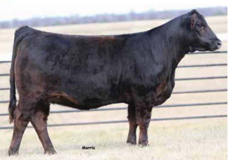
LOT 45 | AUTO CHARLA 270C