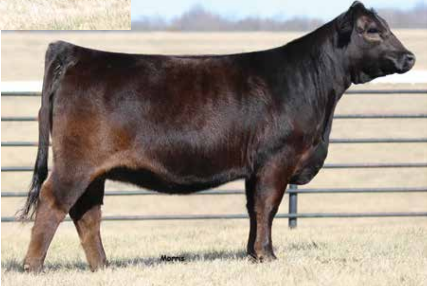
LOT 39 | AUTO CARLOTTA 253C