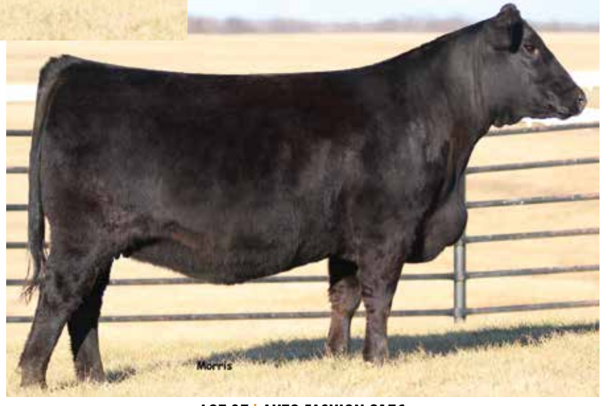
LOT 37 | AUTO FASHION 217C