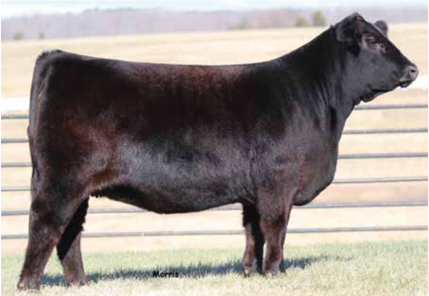
LOT 33 | AUTO CHLOE 264C