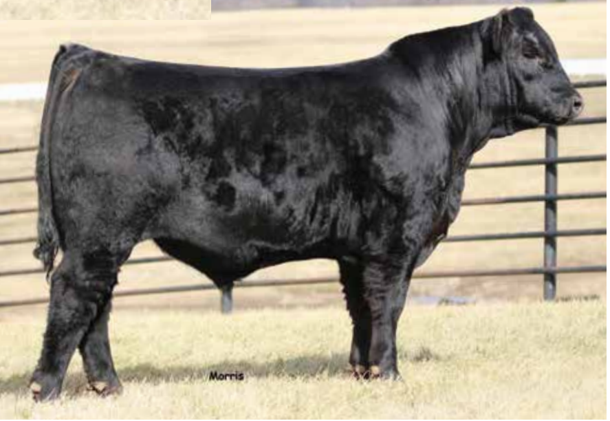
LOT 17 ALL IN ONE 171C