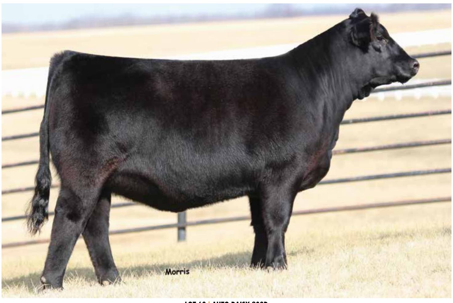
LOT 68 AUTO DAISY 208D