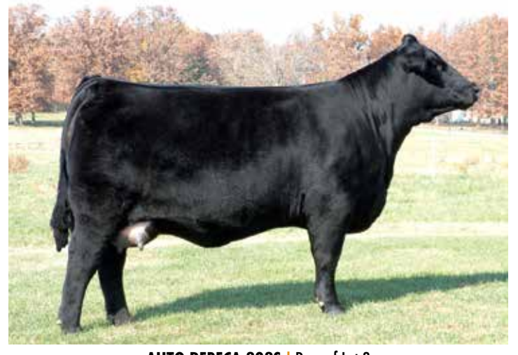
AUTO REBECA 292S | Dam of Lot 2

AUTO Direct Drive 107D could be one of the all-time great herd-sire prospects ever created in the long-standing Pinegar herd. To find a purebred bull of the caliber with this much good in him is hard to produce and hard to find. He is massive in his foot size, soft in his pasterns and moves extremely well, which we all realize this is the most important trait in any breed of cattle. We admire his moderation in frame, fleshing ability and do-ability. This beef bull combines the best in rib shape, volume and still maintains plenty of thickness. He just happens to be a son of one of the all-time great Lim-Flex donors in the entire breed, AUTO Rebeca 292S. There are so many champions