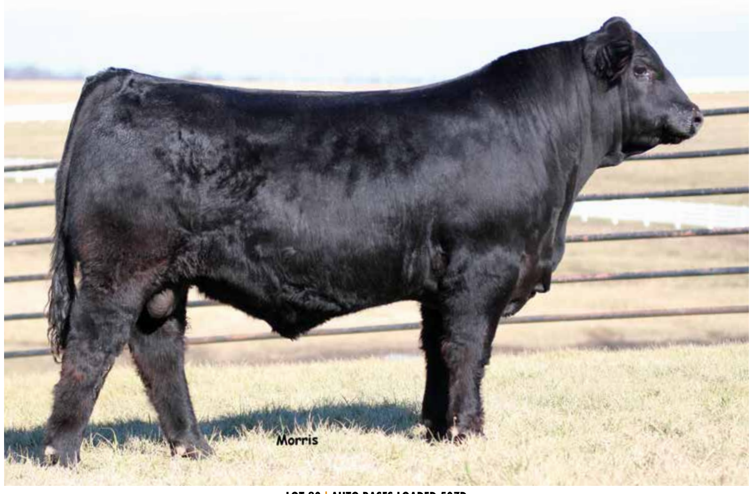
LOT 20 | AUTO BASES LOADED 507D