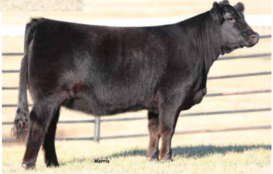
LOT 67 | AUTO CHELLY 653C