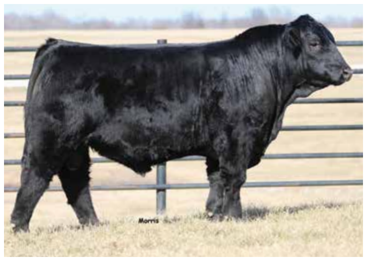
LOT 7 | AUTO FULLY LOADED 159C