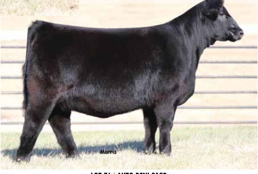
LOT 76 AUTO DENI 212D