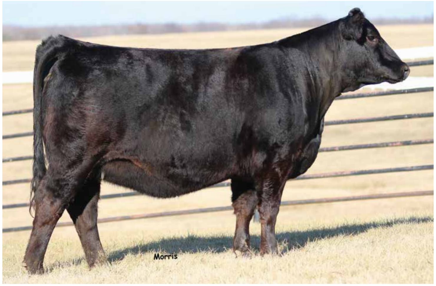
LOT 35 | AUTO COPY CAT 218C