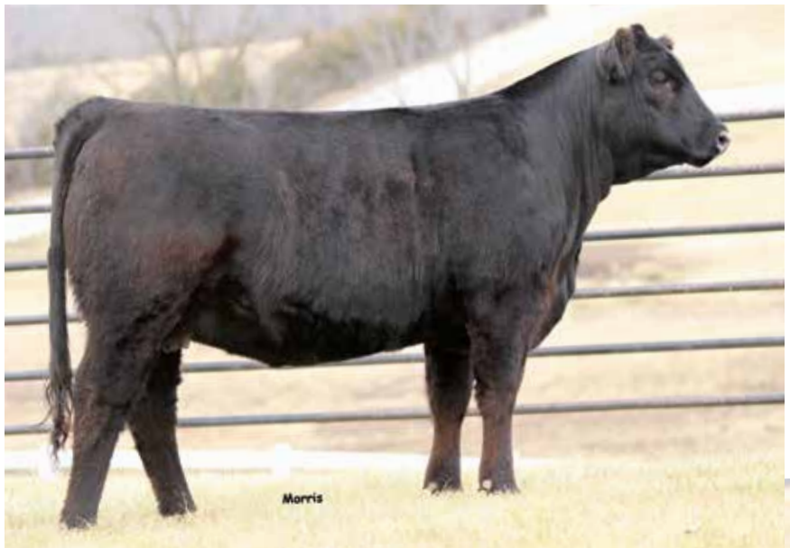
LOT 41 AUTO CLEO 278C