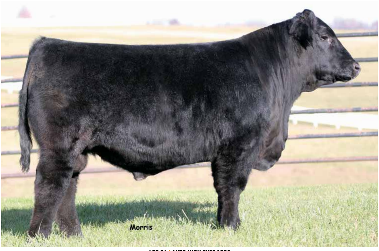
LOT 26 AUTO HIGH TIME 177C