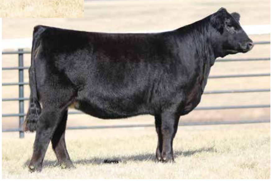
LOT 63 | AUTO CECE 482C