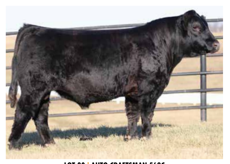
LOT 30 | AUTO CRAFTSMAN 569C