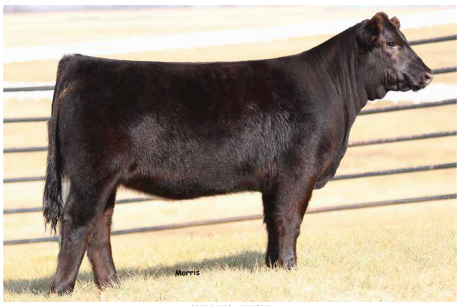
LOT 70 | AUTO DAKIN 255D