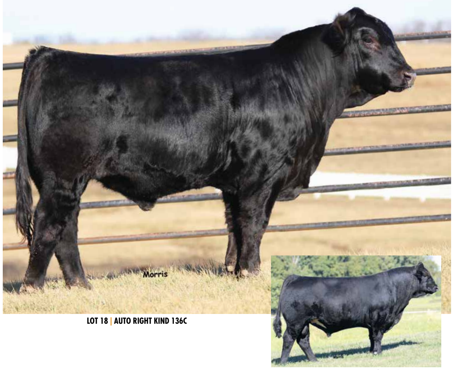
AUTO CRUZE 132X | Sire of Lots 18 & 19