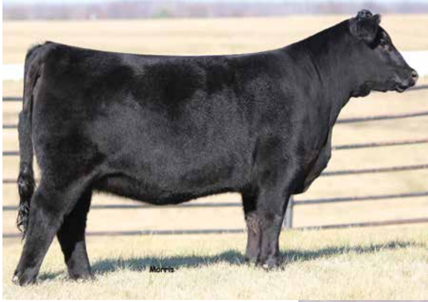
LOT 64 AUTO CAMDYN 474C