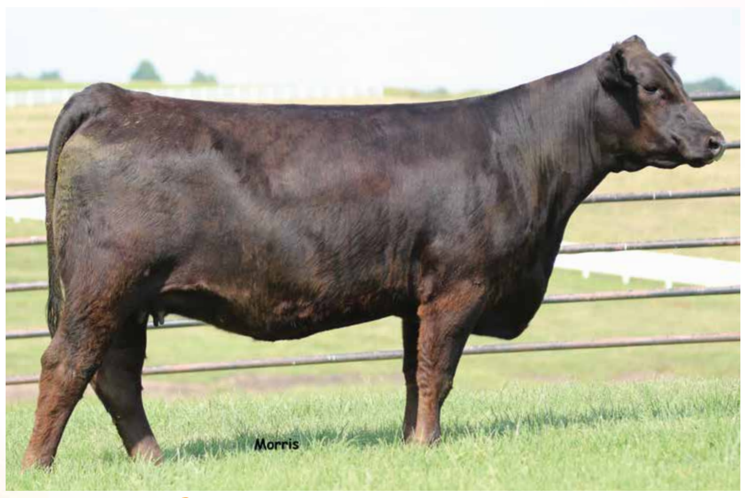
Due 9.10.17 to AUTO Silverado 543B (HP/HB)

This 62% Lim-Flex first-calf heifer rounds out the 1st-Ever Pinegar Limousin Online Sale offering. She is a daughter of MAGS Robin Hood 276Y and from a daughter of the once national sale top-selling bull CALO Brickyard 902W. This female ranks in the top 3% Milk, top 5% for TM, top 10% for Marb and top 15% for SMTI. She scanned a 13.79 for REA and 3.84 for IMF. This female sells bred carrying the service to the proven and predictable service sire AUTO Silverado 543B.