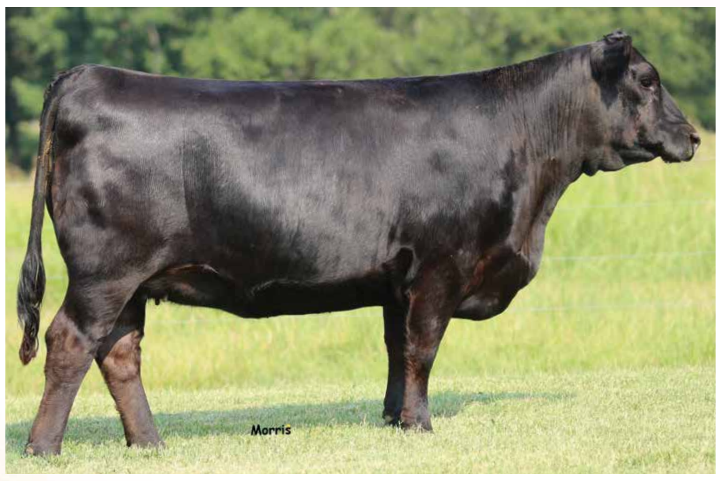
Due 9.10.17 to AUTO Lucky Strike 118B (DP/DB)

Here is a true sale highlight and one terrific Lim-Flex heifer. She is a daughter of MAGS Argo, a son of MAGS Yip. Her dam, CFLX Unna 323A, is a daughter of MAGS Xylopolist and from the elite donor SBLX Unna 391U who is working for DeMar Farms and Counsil Family Limousin. This female scanned an 11.20 for REA and 4.53 for IMF. She is made just nearly perfect as you can see in her picture and her video. There isn't anything you would criticize her for.