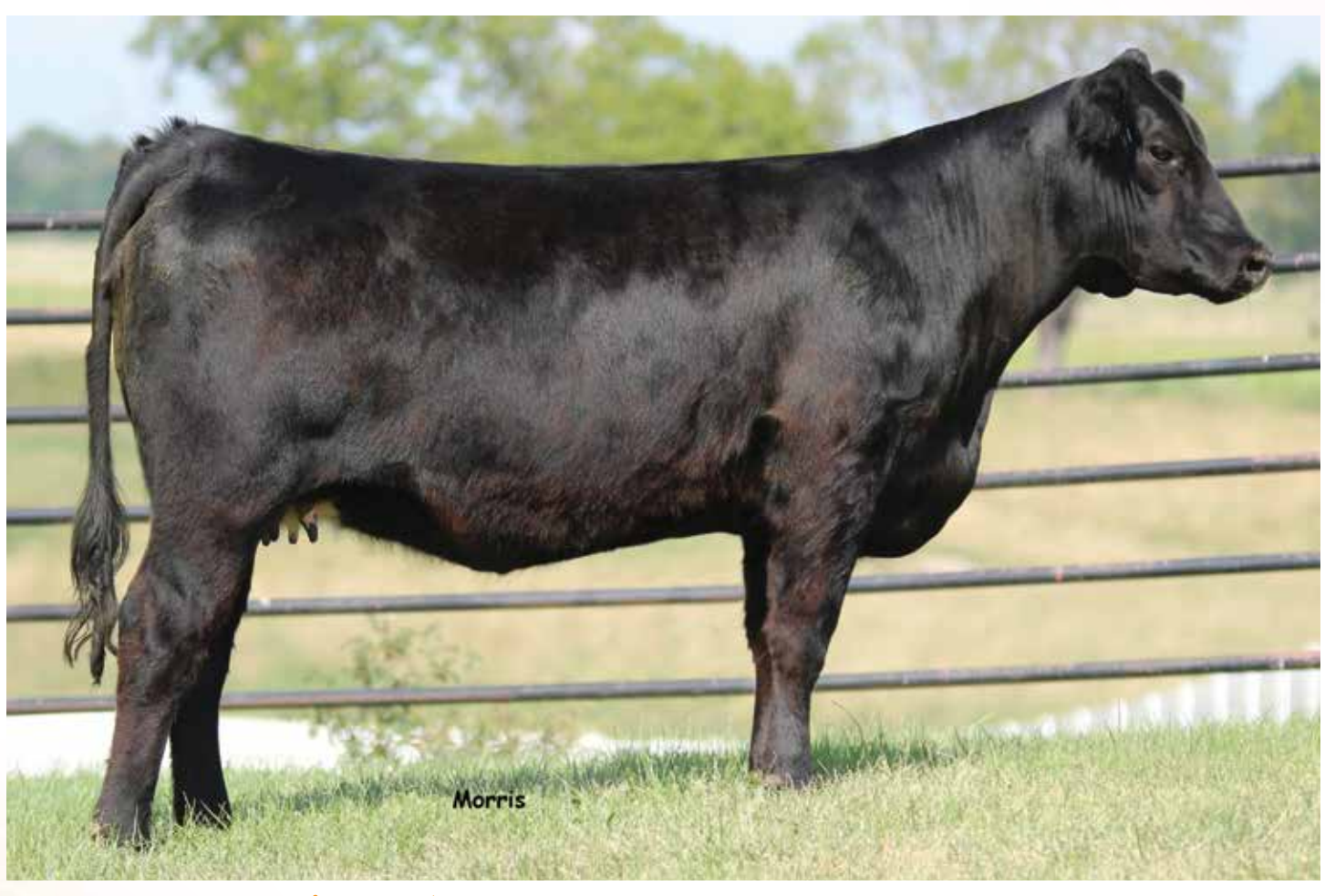
Due 9.10.17 to AUTO Black Coffee 512A (DP/HB)

AUTO Caleigh 631C is a 75% Lim-Flex daughter of AUTO Gunn Point 192Y, the 75% son of LH Rodemaster 338R from the dam of DHVO Deuce, Ava Jo DHVO 721R. He has done a tremendous job creating well-made performance-oriented cattle. The dam of 631C is AUTO Zest 200Z, a daughter of the deceased JCL Black Out from the prominent donor BOHI Sunset 6156S. This female is the result of the blending of strong and powerful genetics that have been sought after over the years from the Pinegar team.