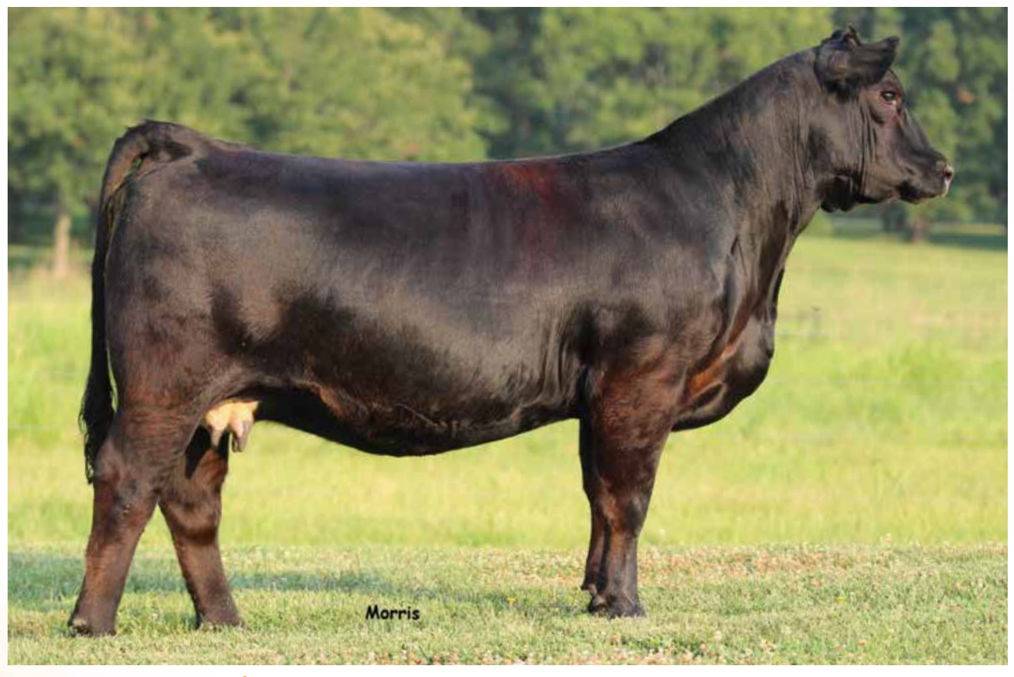
Due 9.10.17 to AUTO Real Deal 150B (HP/HB)

AUTO Celeste 411C is a 50% Lim-Flex, black, polled daughter of PVF Insight 0129. Her dam, AUTO Forever 219X, is a DHVO Deuce daughter from the deceased MAGS Manuela. 411C is a result of the blending of the best in purebred Angus with the best in purebred Limousin. She ranks in the top 1% for REA with a 1.42, top 5% for TM with a 69, top 10% for YW, Milk, YG and CW. The genetics and EPD profile of this first-calf heifer are as good as you would ever want.