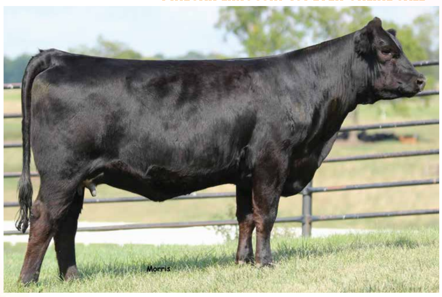
Due 9.10.17 to AUTO Power Plus 133B (HP/HB)

Purebred, homozygous polled and homozygous black is this well-made, special first-calf heifer, AUTO 632C. This AUTO Gunn Point 192Y daughter is from a daughter of AUTO American Idol 162L. So many who have seen the sale offering thus far realized very quickly this purebred female was one of the top lots in the offering.