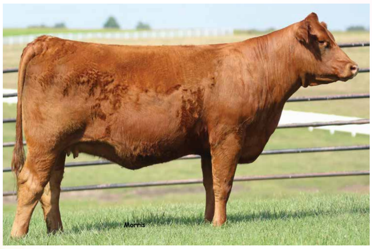
Due 9.10.17 to EXLR Review 7153R (R/HP)

Purebred, red and homozygous polled, and one of the finest in the offering is AUTO Camilla 641C. She is a daughter of AUTO Gunn Point from a daughter of JCL Black Out from the long-standing Pinegar donor STBR Demetria 669D. The power and performance found in this female's pedigree is beyond belief. To find a homozygous polled, red purebred female of this level is a true blessing. Her genetics are very predictable and her conformation is as good as you would want it to be.