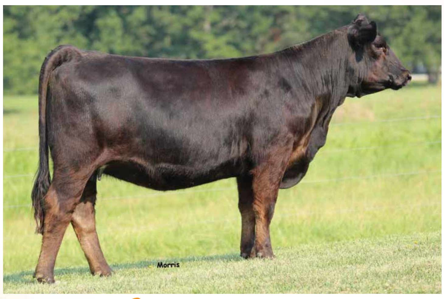
Due 9.10.17 to AUTO Real Deal 150B (HP/HB)