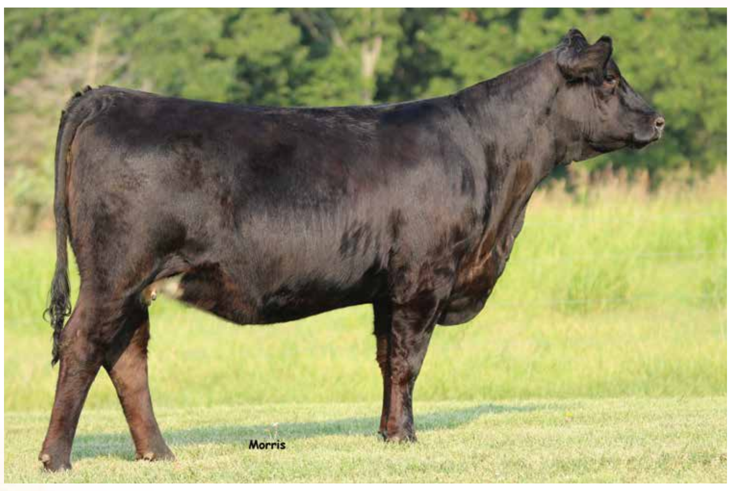
Due 9.17.17 to AUTO Black Coffee 512A (HP/HB)

AUTO Casey 291C is a 43% Lim-Flex who is homozygous polled and homozygous black. She is a daughter of AUTO Ammo 135A from the purebred Angus female EXAR Blackbird 2830. AUTO Ammo is a MAGS Yip son from the prominent and breedleading donor AUTO Rebeca 292S. AUTO Casey 291C ranks in the top 3% for WW with an 84, top 5% in YW with a 122 and top 5% for Marb with a .48. This first-calf heifer represents the Pinegar program very well, and we think she will make a top addition to any program.