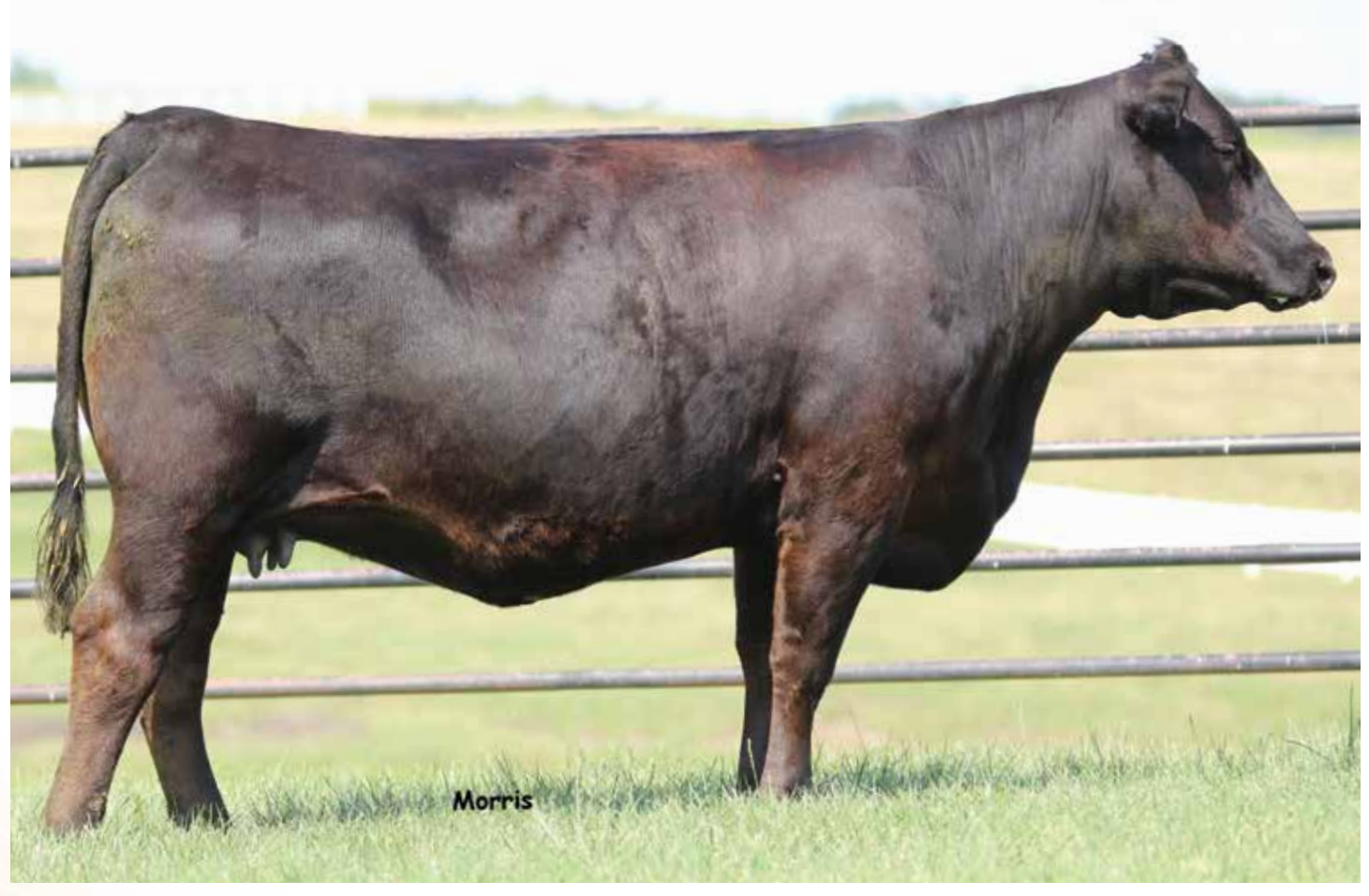
Due 9.10.17 to MAGS All-Star 700A (HP/HB)

This 62% Lim-Flex has a pedigree stacked for strong EPDs and powerful performance. She scanned an 11.29 for REA and 4.4 for IMF. She ranks in the top 1% for TM with a 75, top 2% for YW with a 36, top 4% for CW with a 45, top 5% for YW with a 122, top 10% for WW with a 79 and top 15% for $MTI with a 62. The number profile and the unique look and design of this female is as good as anyone would ever want.