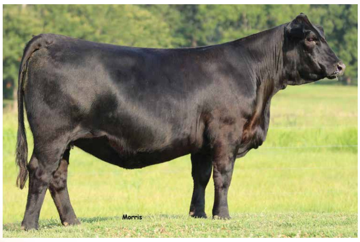
Due 9.10.17 to Riverstone Crown Royal (DB/DP)

AUTO Chanel 400C is remarkable and insanely good! She is a black, polled daughter of MAGS Ali from the red, polled donor Carrousels Peaches. This female is perfectly made, big footed, sound and complete in her structure. It is females of this level that has made the AUTO genetics what they are today. She ranks in the top 4% in WW with an 82, top 10% for SC with a 1.25, top 15% for YW with a 114 and TM with a 65. If you are in need a big-league donor, then take a look at this amazing Lim-Flex first-calf heifer.