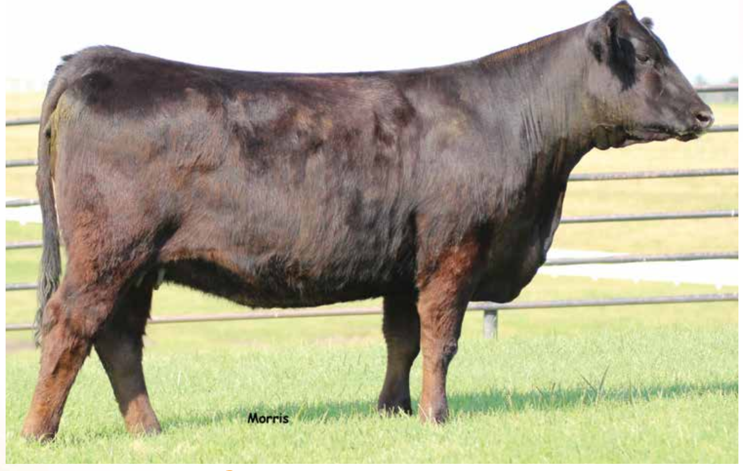
Due 9.10.17 to AUTO Power Plus 133B (HP/HB)

AUTO Chavell 436C was designed to be great! She represents a mating that is unbelievable in the business. She is sired by MAGS Yip and from a proven Angus female that was bred in the Express Ranches program. This 50% Lim-Flex heifer scanned a 12.18 for REA and 3.83 for IMF. She is solid across the board with her EPDs and represents a very predictable pedigree. This female is solid from the ground up, and is extreme in her depth of body and over all capacity.