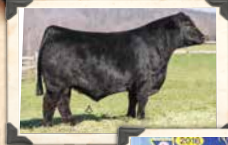
CJSL CREED 5042C Sire of Lot 27