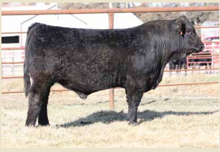
LOT 4 LVLS Optimizer 9070E

bred in the Pinegar herd and genetically similar to many of the great ones ever to grace the pastures of Springfield, MO.