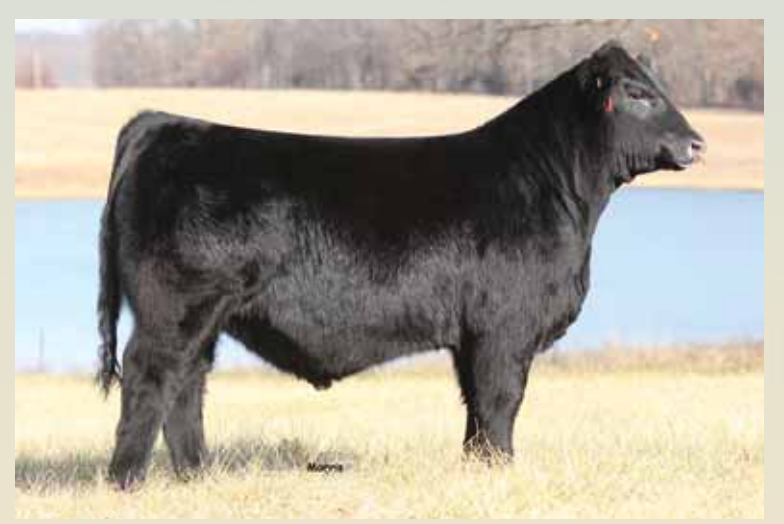
LOT 3 LVLS Equinox 811E