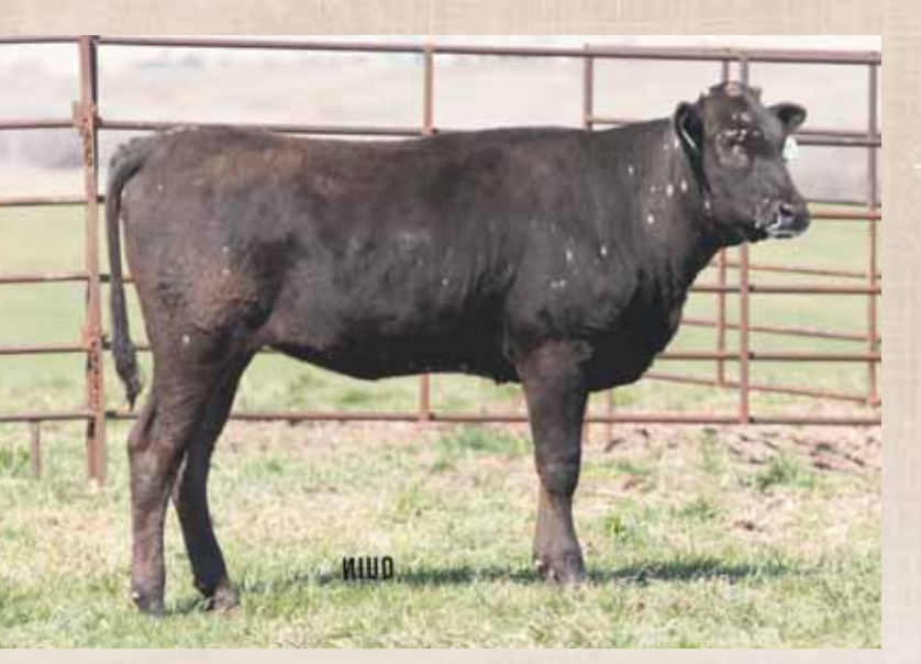
JDH MS SHIGISHIGI 212 G / LOT 14

212G is another superbly bred daughter of MFC 2-12. She is a Yuriko line heifer that has a couple of fantastic carcass trait bulls, Sanjirou and Kitaguni Jr., sandwiched in the middle of her sire stack. A couple of elite growth bulls, Haruki II and TF151 Itozuru Doi, are stacked on top them. They are all backed up by TF Kikhana and JVP 400 going right to the Yuriko cow. This blend of genetics is expected to transmit a nice balance of carcass and growth performance.