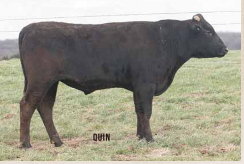
JDH 4 X SUZUTANI 37F / LOT 28