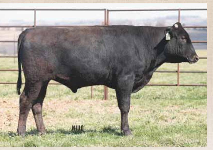
JDH 1441Y 111G / LOT 33