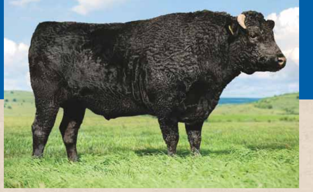
HP MAYURA LOO10 / SIRE OF LOTS 38 - 63 EMBRYOS

All exportable Embryos Are Stored at VYTELLE, 1421 S. Bell #108, Ames, IA 50010 | 515.445.1030