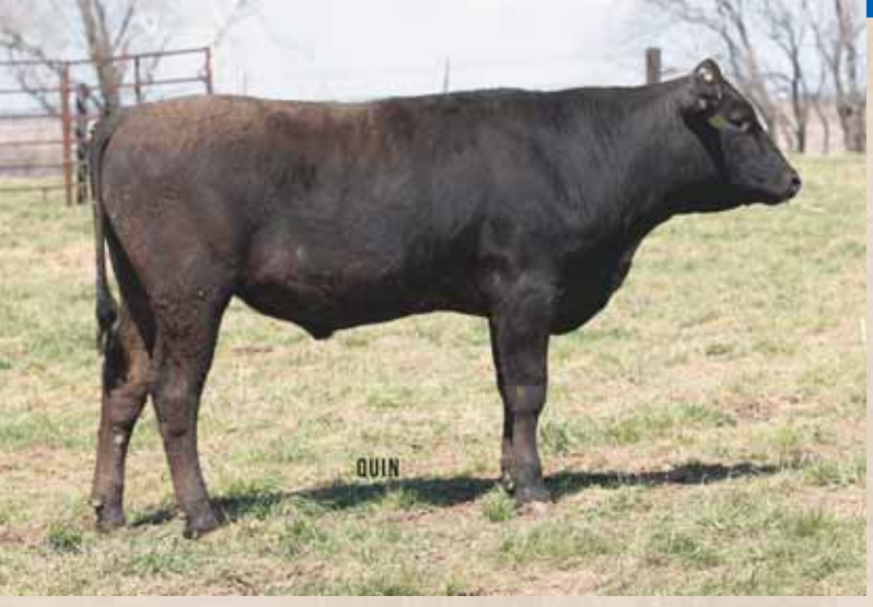
JDH SHIGISHIGI 2-12 116G / LOT 31