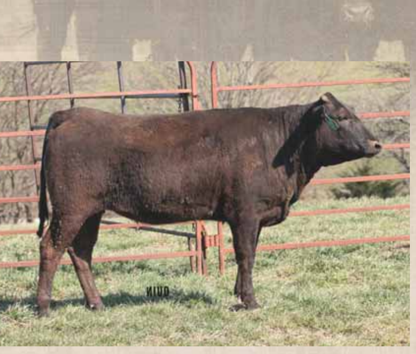
JDH MS OA07 269F / LOT 3