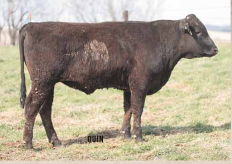
JDH POLLED ZURU D64 78G / LOT 36