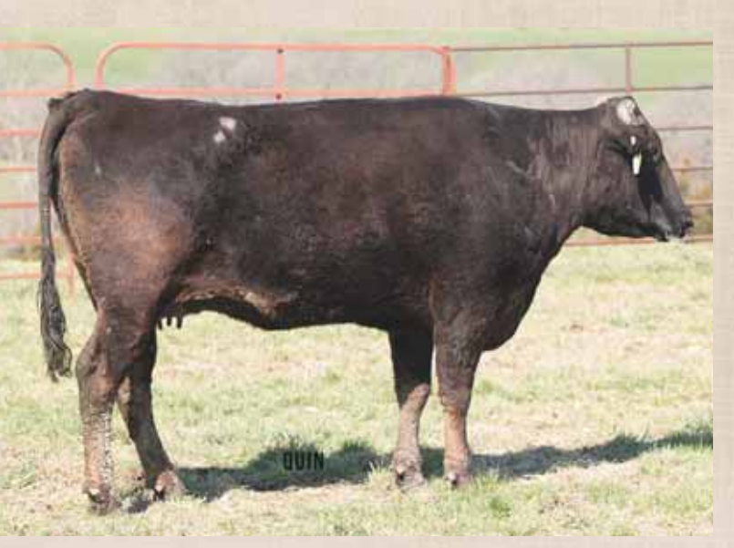
YAR 82B / LOT 18

Growth genetics are the feature of the pedigrees of this cow and her heifer calf. The elite brood cow, CHR Kikuhanahime appears on both sides of the pedigrees. The sire of the cow is a son of the immortal TF151 Itozuru Doi, and the dam of the cow is a Kevinhanafuji x CHR 101L mating. The young heifer calf has loads of potential as a herd matron with Toshiro 1/3 as her sire. The cow and her heifer are built to be bred to high-Tajima, carcass trait bulls which will produce offspring that are impressive for growth and meat qualities. This cow and heifer are the herd-building kind!