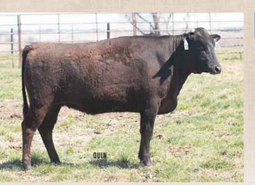
JDH MS 1441Y GENE 340F / LOT 4