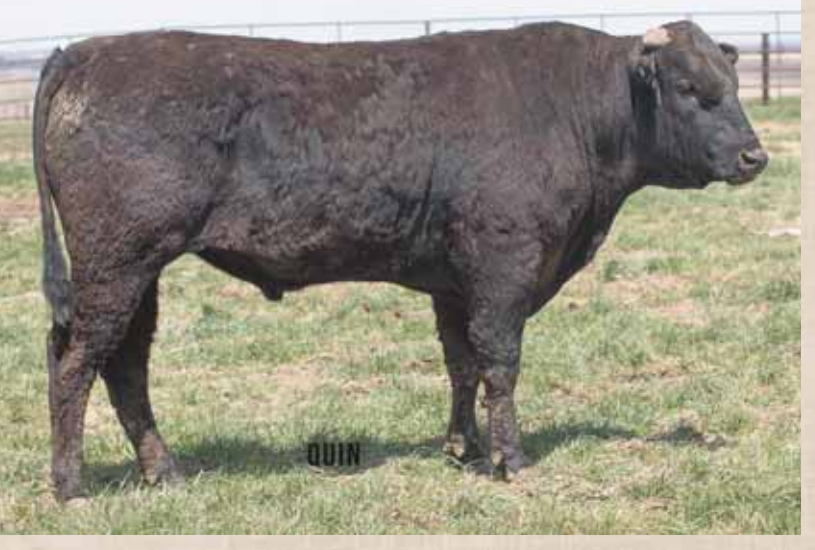
JDH SHIGESHIGETANI DOI 77F AI / LOT 27