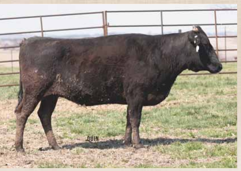
JDH 5638X / DAM OF LOT 41 EMBRYOS

JDH MS SANJIROU 1536 / DAM OF LOT 40 EMBRYOS.