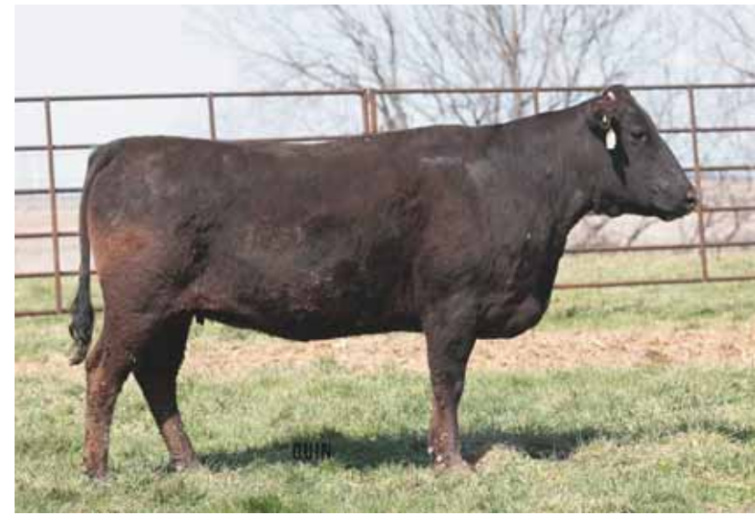
CHR MS YASUFUKU 0915 / DAM OF LOT 44 EMBRYOS

These embryos are from a donor with the proven genetic combination of Yasufuku Jr and Kitaguni Jr. This combination has been proven in the leading Lone Mountain Ranch herd to be potent for carcass quality. Stacking Mayura L10 on as the sire further emphasizes carcass traits in these embryos. Mayura L10 is the $105,000 2016 Elite Wagyu Sale top. He is a high genomic EBV son of the legendary Mayura Itoshigenami JNR. L10 has breed leading EBVs of +2.4 MS, +7.1 REA, and +37 CW on the April 2020 Breedplan EBVs.