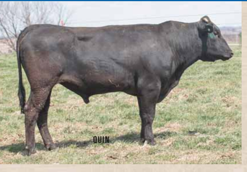
JDH ITOZURIU DOI 233F ET / LOT 26