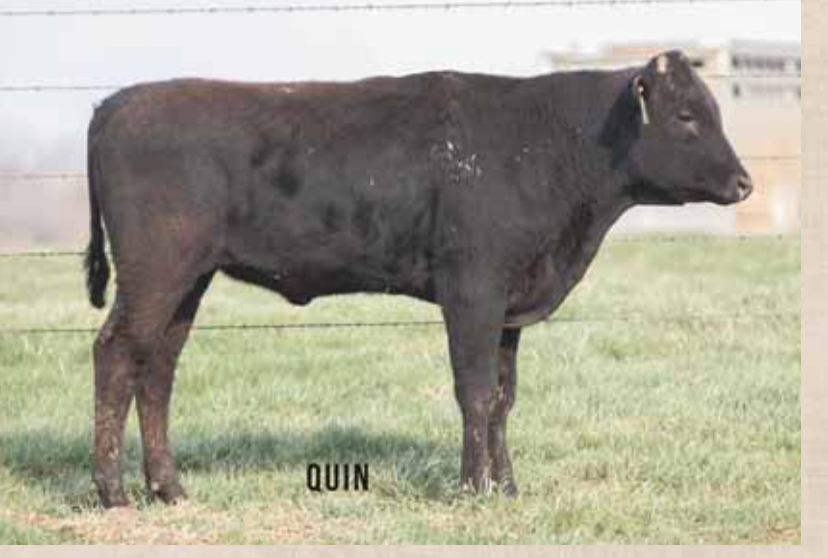
JDH DOUBLE SANJIROU 219G / LOT 32