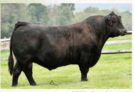
CJSL Creed 5024C Sire of Lots 7 & 8

Here is a female that has an alluring phenotype that everyone will like. Sleek made female with added style, tremendous length of body and a phenomenal presence. Her sire, CJSL Creed 5042C, has been used heavily at many elite breeding programs due to his ability to add production value and eye appeal. He has been responsible for raising the most elite replacement females at numerous herds across America, his ability to consistently transmit eye caching feminine featured females is impressive. Her dam is an impressive PVF Insight 0129 daughter out of the famous MAGS UR Salina donor female. She reads fundamentally correct when put in motion and presents a beautiful profile. Don't miss this female we think that she has a bright future ahead of her no matter what your plans hold.