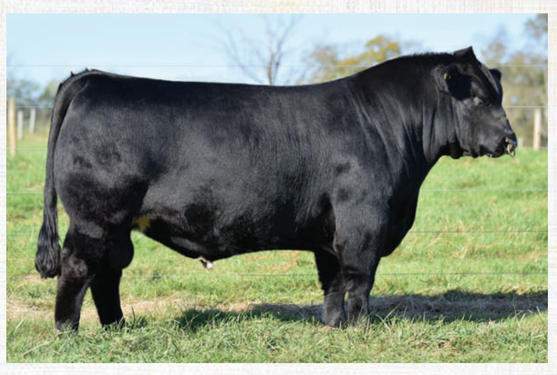
CJSL Dauntless 6257D Sire of Lot 37 Pregnancy