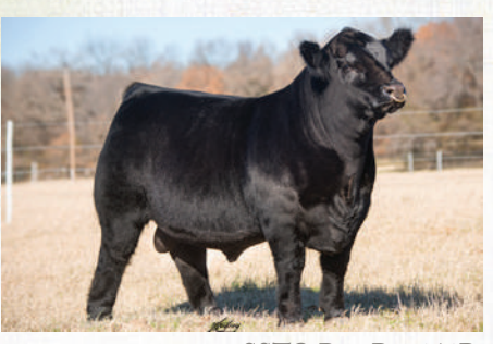
SSTO Best Bet 456B Sire of Lots 9 & 10

This female has a superior look and quality about her, coupled with a phenomenal build and structural soundness that will impress the most critical eye. She's a daughter of the SAV Harvestor 0338 son, SSTO Best Bet 456B our senior herd sire that has done a tremendous job for our program as well as other reputable operations. SSTO Best Bet 456B has been responsible for producing females that sort to the top of our Fall Harvest Sale offering the past few years. Her dam PBRS 7120E is a female we purchased from P Bar S Ranch of OK, we appreciated her feminine pattern and predictable pedigree being a MAGS Aviator X AUTO Classy 272B. She's an all-around solid female that has such a bright future in the ring and in production.