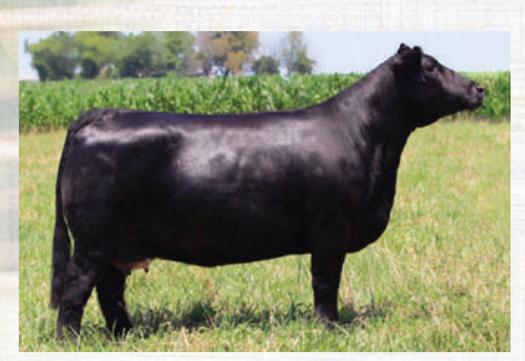
CYWD Zesty 22Z Granddam of Lot 10

CELL Jurassic 1048J combines an unrivaled amount of substance with genuine body shape and dimension and a flawless structural build. Her captivating look from the profile is sure to capture the attention of many! She is sired by our senior herd sire that has done a tremendous job for our program as well as other reputable operations. SSTO Best Bet 456B has been responsible for producing females that sort to the top of our Fall Harvest Sale offering the past few years. His ability to produce outstanding females will have his influence deeply embedded in our cow herd for many years tho come. Her dam is a eye catching female with a pedigree that can't be beaten for producing show heifers. This 5-yearold has on of the most popular Angus show sires SILVEIRAS S SIS Gq 2353 on the top side of her pedigree and CYWD Zesty 22Z the Champion Lim-Flex Female at the 2014 NWSS on the bottom side. This female ranks in the top 10th percentile for her mainstream terminal index figure and top 3rd percentile for her marbling figure. If you're in search of a heifer backed by proven and highly marketable genetics, look no further.