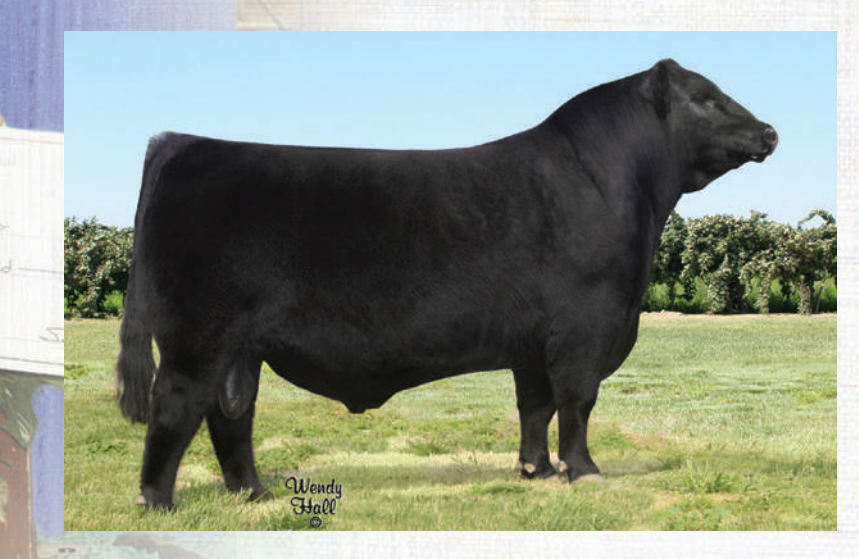
Silveiras Style 9303 Sire of Lot 36 Pregnancy