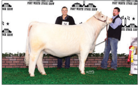
BIG CREEK MIA 1101 Dam of Lot 12

WC BENELLI 2134 P ET WC MILESTONE 5223 P WC LADY BLUE 0506 P DRREVELATION 467 BIG CREEK MIA 1101 P ET EXL MIA 230M YW MILK REA MARB TSI CE BW ww 1.7 21 -1.1 56 97 74 07 237