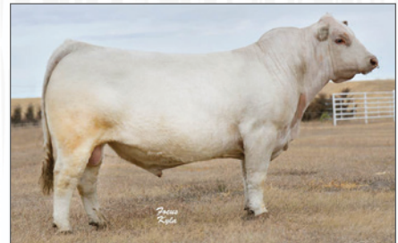
M&M OUTSIDER 4003 PLD $200,000 sire of Lot 45

AID TO TR CAG CARBINES VISION 9700 ET ON 11-22-21. P.E. TO GHC DOUBLE VISION 0113, 12-13-21 TO 3-1-22 Lot 45 gets me revved up. It is hard to put a neck, hip, and hind leg in one while still having that deep, bold center body. This direct daughter of the $200,000 M&M Outsider 4003 PLD will absolutely make you stop and look. I don't think I have seen one this clean fronted, level hipped, and good legged in a while. You will want to see her sale day.