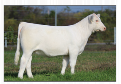
BC HF DANICA 135 Full sib of Lot 13. Purchased by Bar J Charolais, Liverpool, TX