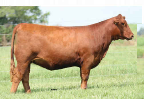
Lot 38, 2021. Purchased by Explosive Cattle Company, Omaha, AR

Lot 11, 2021. Purchased by Bina Charolais, Lawton, ND