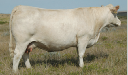
LT BALLET 6233 Dam of GHC Rhinestone 9077

RBM TR RHINESTONE Z38 GHC RHINESTONE 9077 LT BALLET 6233 WR WRANGLER W601 DDC WYONA E03 DDC RUBA 515 YW MILK REA MARB TSI CE BW ww -1.0 58 94 101 21 .78 .06 243