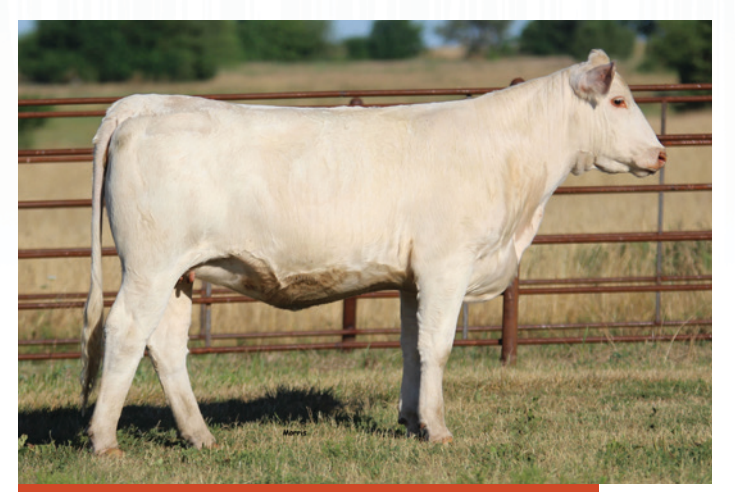
AI'D ON MAY 9TH TO TR CAG CARBINE'S VISION 9700 ET. Another high-quality Rhinestone granddaughter. Lot 20 is very complete in her make up, being sound structured, long spined, soft ribbed, and good in her angles. Her look and balance make her and easy find if you are wanting to make show cattle. Another female whose pedigree allows you many options at breeding time.

APD ON MAY 10TH TO TR CAG CARBINE'S VISION 9700 ET. We all think very highly of this female, I have her marked up well. She is built as good as anything in the sale, being balanced, sound, and attractive through her front end. I like this female from a production and show cattle standpoint. Her dam was raised in the Oklahoma Bovine Genetics herd and stems from their famous Pamela cow family.