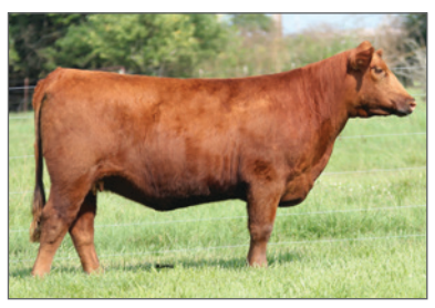
TMAS MS. STRAWBERRY 974G Half sister to the dam of Lot 6