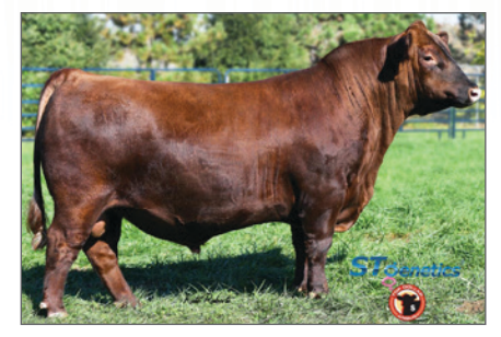
STRA RELENTLESS Sire of Lots 27 & 28

HB GM CED BW WW YW MILK MARB 27 36 14 -5.0 58 85 31 .85