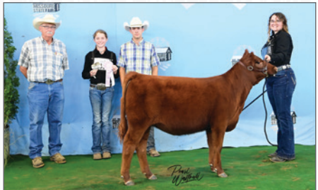
Lot 7, 1BBC MISS LANA 2109 Reserve FFA Champion 2022 Missouri State Fair