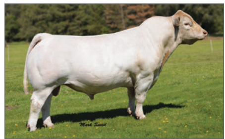
TR MR. FIRE WATER 5792R ET Sire of Lot 14

THOMAS OAHE WIND 0772ET P TR MR FIRE WATER 5792RET THOMASSWISSERSWEET1764ET M6 TORNADO 815 MDL MS TORNADO 341 PLD WCR MS PRIMECUT 7304 P CE BW ww YW MILK REA MARB TSI -0.4 1.2 52 24 .86 -.04 222 85