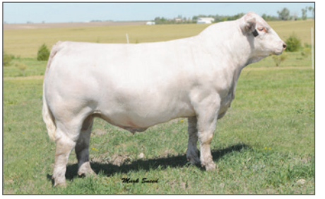
RBM TR RHINESTONE Z38 Grandsire of Lot 20.

BC MS ELIANA 2120 3/15/21 // F1314879 // 2120 // COW RBM TR RHINESTONE Z38 GHC RHINESTONE 9077 LT BALLET 6233 TR MR RHINESTONE 4570B C&S MS ELIANA 772 C&S PENNY DB 314 WW YW MILK REA MARB CE BW TSI 6.7 0.3 105 20 54 .78 .14 250