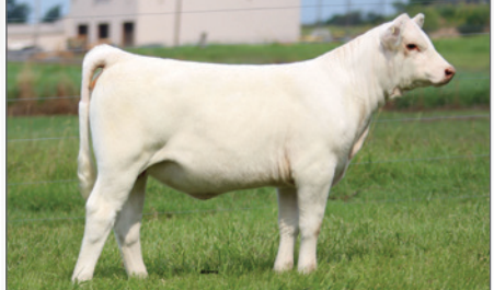
LOT 3, 2021 FALL COLORS Dam of Lot 18 is full sib to the dam of Lot 3 in 2021 sale.