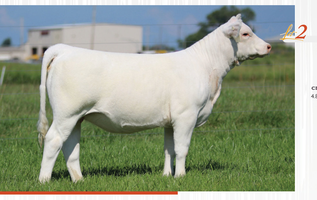
From a show heifer perspective, this could end up being the best open in the sale. Her design and build are unmatched. Clean fronted and attractive through head and neck, and complete from there back. You will appreciate her square, stout hip that ties deep into her quarter. Her sire, TR CAG Carbine's Vision, is producing cattle that have a little more substance to them and still have the look to compete in the ring. Another bonus of lot 2 is her build at the ground. She is big, square footed, flexible at the ground and loose spined.