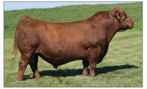
BIEBER HARD DRIVE Y120 Maternal Grandsire of Lot 25

HB GM CED BW WW YW MILK MARB 40 61 12 -1.2 73 123 25 .48