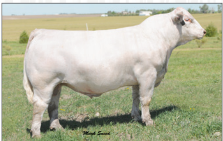
RBM TR RHINESTONE Z38 Sire of Lot 41

BULL CALF BY TR CAG CARBINES VISION 9700 ET, BORN 8-25-22. BW 82