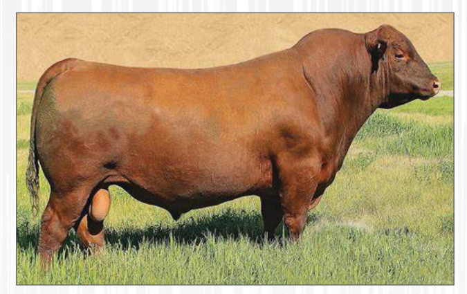
BIEBER LET'S ROLL B563 Sire of Lot 39