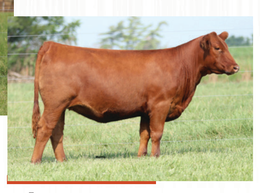
Lot 36, 2021. Purchased by Explosive Cattle Company, Omaha, AR