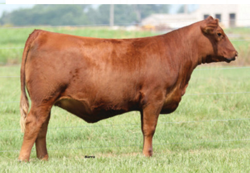
Lot 39, 2021. Purchased by Aces Wild Ranch, Millsap, TX