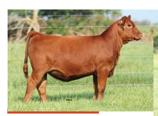
Lot 28, 2021. Purchased by Ethan Overshon, Dixon, MO