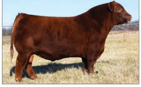
TWG TANGO 156D Paternal Grandsire of Lot 26