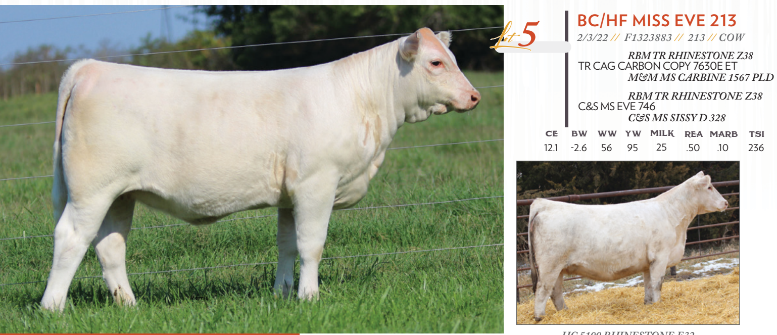
HC 5100 RHINESTONE E32 Daughter of HC Rhinestone 5100

I really like lot 4. Every time I see her, she becomes more eye catching. When you study her from the side you will find a balanced, well-built female who has all the right angles to make a high-quality show heifer. You will appreciate her strong hip and hind leg while still blending well into her shoulder and coming out of that shoulder high with a keen head and clean jaw. Looking at her pedigree you will notice something different on the bottom side. DCR Mr. Substance A240 was one of the first sons of LT Ledger to sell. Thomas Ranch purchased Substance for $42,000 to anchor their herd bull battery. While offspring are limited due to his early death, the Substance progeny add performance and mass without question.