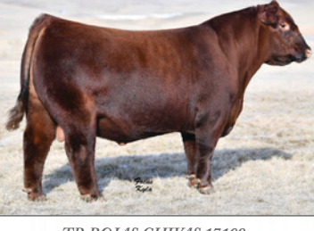
TR ROJAS CHIVAS 17109 Sire of Lot 6