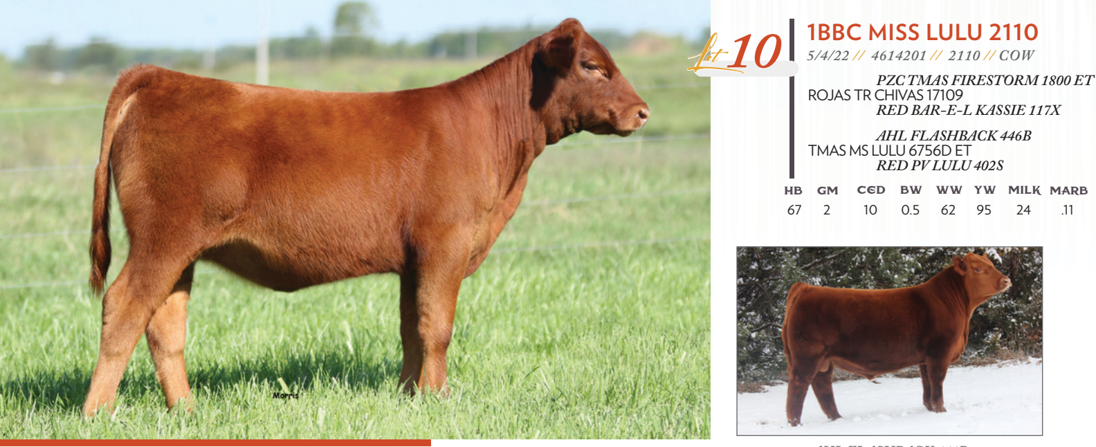
AHL FLASHBACK 446B Maternal Grandsire of Lot 10