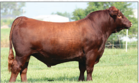
1BBC RENEGADE 040 Full sibling. Sold to Aces Wild Ranch in 2021 Fall Colors

TR SLA CASH 434B TMAS MS LANA LYNN 627D PZC LANA LYNN 1961 ET HB GM CED BW WW YW MILK MARB 68 8 12 0.2 56 91 23 .16