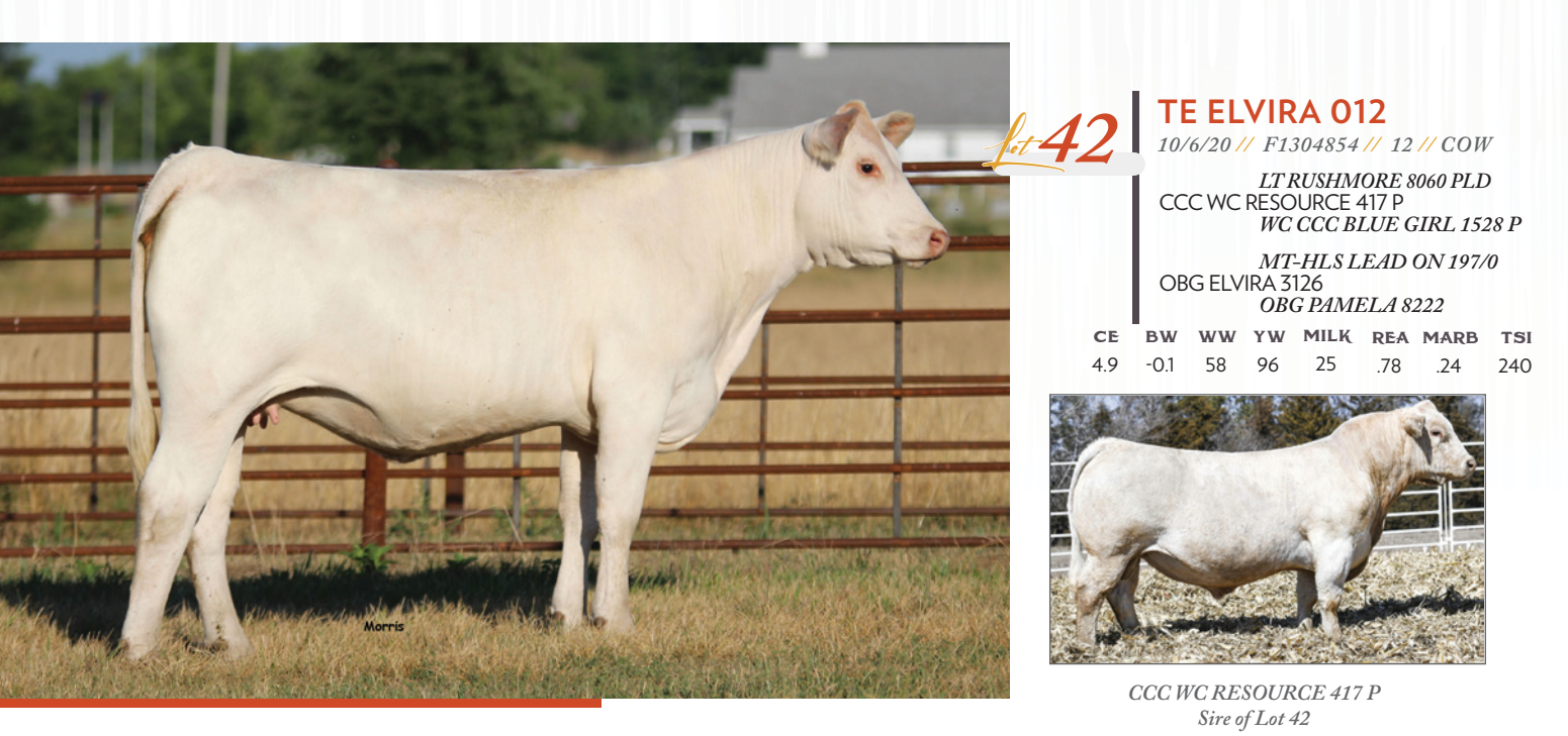
BULL CALF BY TR CAG CARBINES VISION 9700 ET, BORN 8-24-22. BW 82 Lot 42 is a very high-quality individual. She is as correct in phenotype and balanced in her build as anything in the sale. She is ultra-feminine through her front end, smooth jointed, and big bodied. The bottom side of her pedigree reflects some of the best cattle produced in the OBG herd in Oklahoma. We all have this one highly marked.

We felt that last year's group of fall calving pairs were well received. We wanted to add to this this year but still maintain quality. We feel that we have achieved that goal. Leading off this group is an owned daughter of RBM TR Rhinestone Z38. We really like this female; she is an all-around type of cow. She excels in her look from the side, body dimension, and early indications are that she will have a great udder. These are the type a females we strive to bring to you every year.