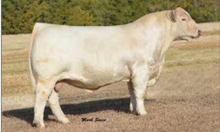
DCR MR. SUBSTANCE A240 Maternal Grandsire of Lot 4

I really like lot 4. Every time I see her, she becomes more eye catching. When you study her from the side you will find a balanced, well-built female who has all the right angles to make a high-quality show heifer. You will appreciate her strong hip and hind leg while still blending well into her shoulder and coming out of that shoulder high with a keen head and clean jaw. Looking at her pedigree you will notice something different on the bottom side. DCR Mr. Substance A240 was one of the first sons of LT Ledger to sell. Thomas Ranch purchased Substance for $42,000 to anchor their herd bull battery. While offspring are limited due to his early death, the Substance progeny add performance and mass without question.