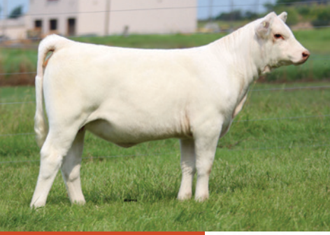
Lot 3, 2021. Purchased by Kennedy Stern, Garden City, SD