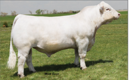
TR PZC TURTON 0794 ET Maternal Grandsire of Lot 43

HEIFER CALF BY TR CAG CARBINES VISION 9700 ET, BORN 8-21-22. BW 64