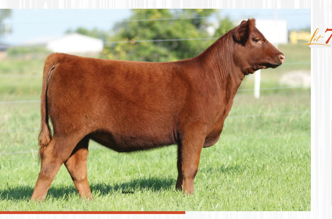
The lead-off spring born Red Angus open heifer, is worth making the trip to Republic, America. Lot 7 is only an April born female and she is getting better and better every day. She hits hard with the impression she gives of her striking front end, coming out of the top of her shoulder with a great neck and head. From there back, she is ultra-complete in her forerib, center body and hip and hind leg design. Red Angus heifers with this kind of look are very rare, couple that with her power from behind and you have a force to be reckoned with. Her full sib bull, 1BBC Renegade 040, sold to Aces Wild Ranch in the 2021 Fall Colors and now stands in Millsap, Texas as a lead herd sire.