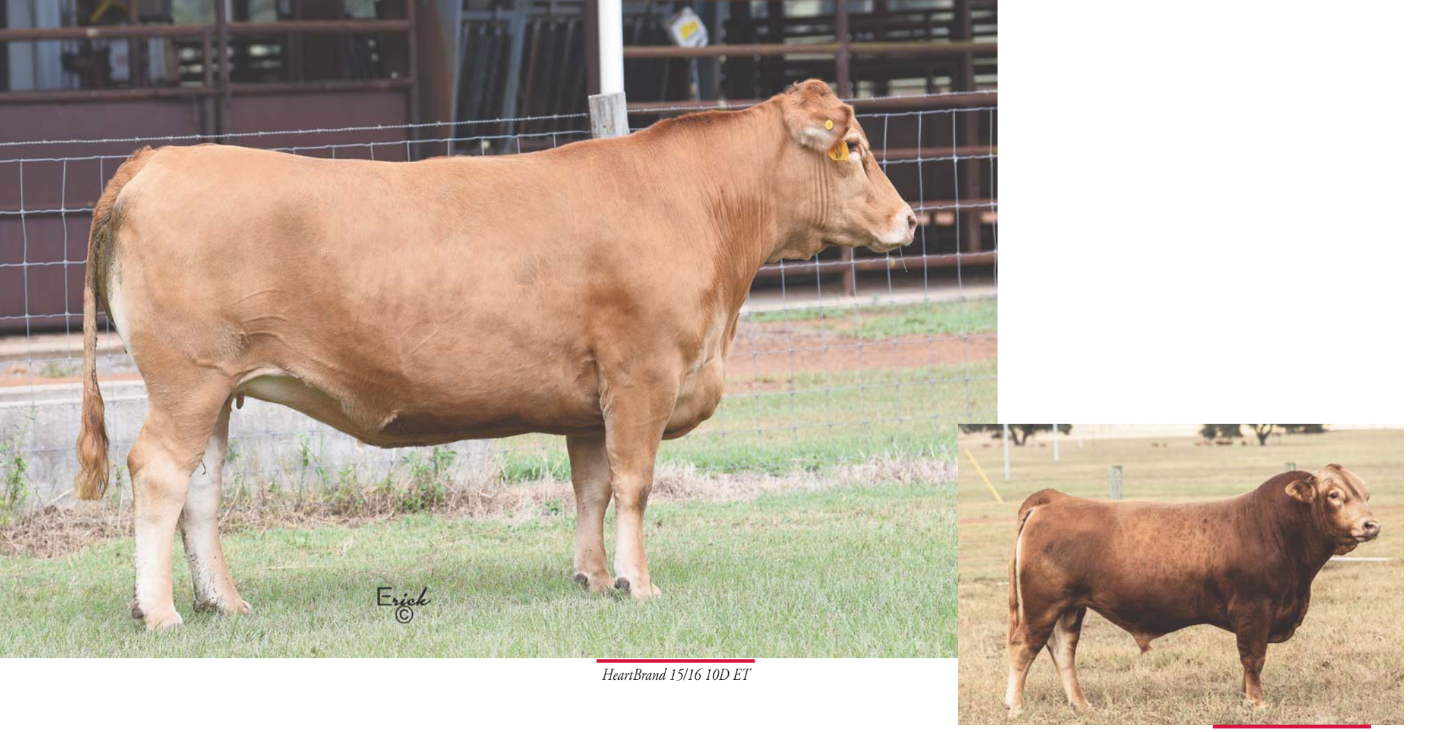
HeartBrand Yellowstone 0917F ET