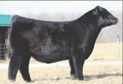
SCC SCH 24 Karat 838