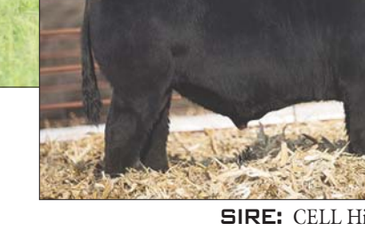
SIRE: CELL History Maker 0256H ET