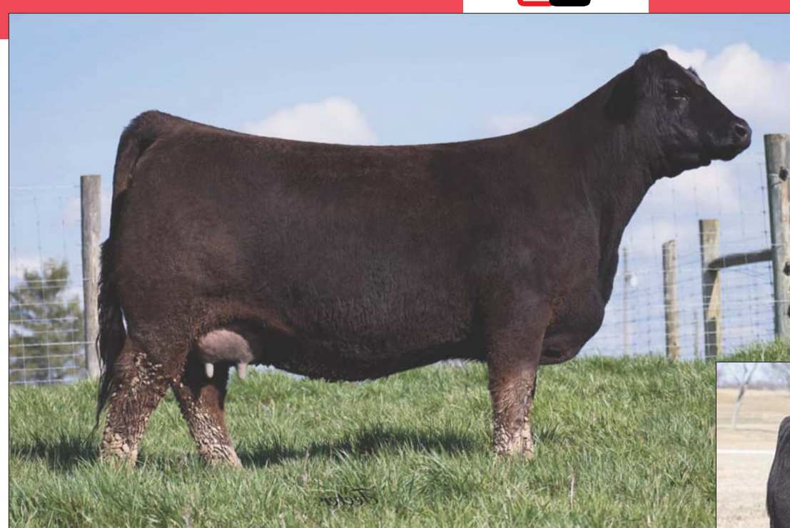
DAM: AUTO Fly Girl 252F