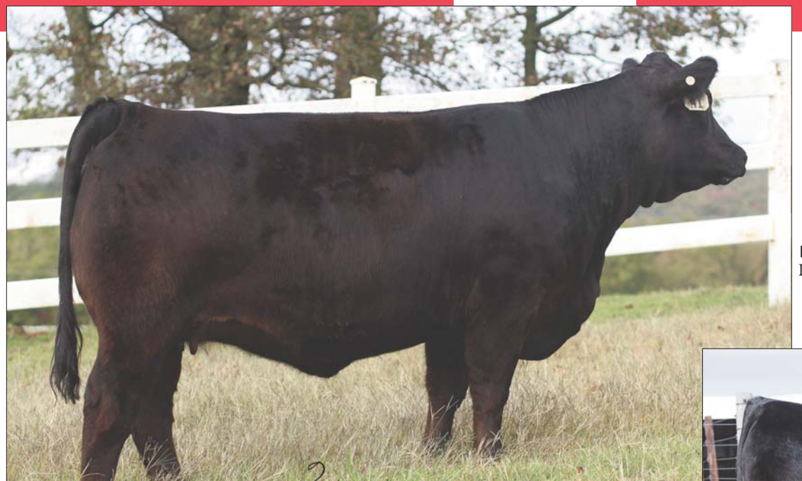
DAM: PBRS Grey 9284G ET