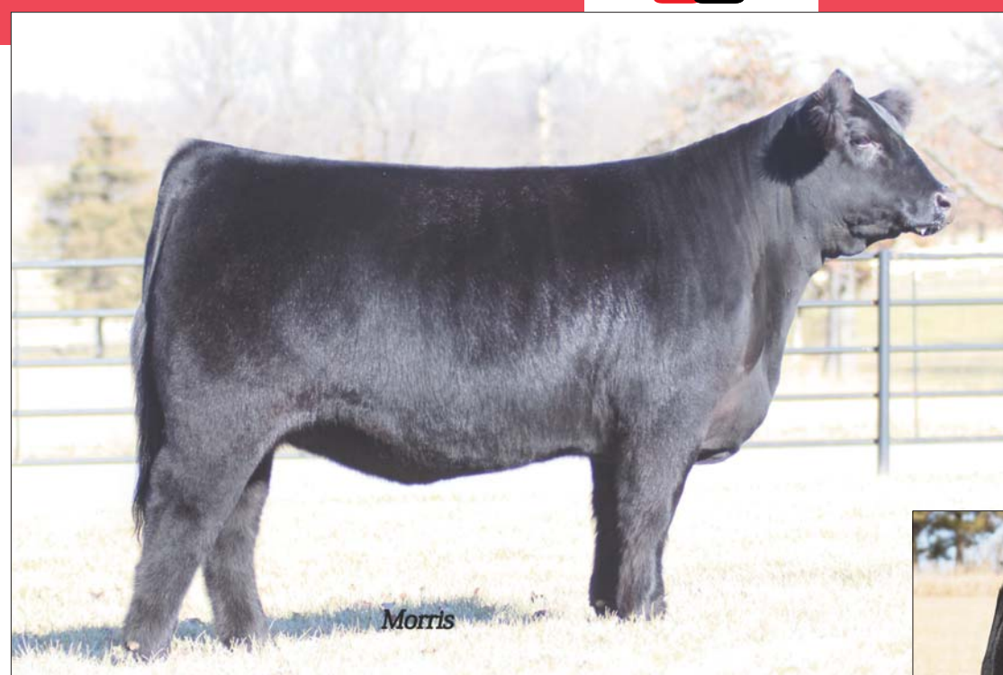
DAM: AUTO Poem 273Y