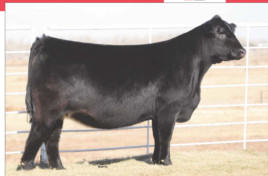
DAM: MAGS Heiress 1607H ET