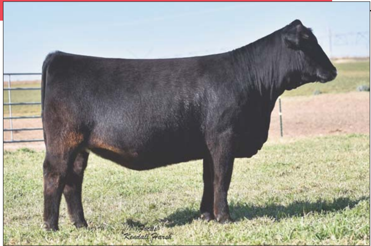
DAM: LFL Eleanor 7103E ET