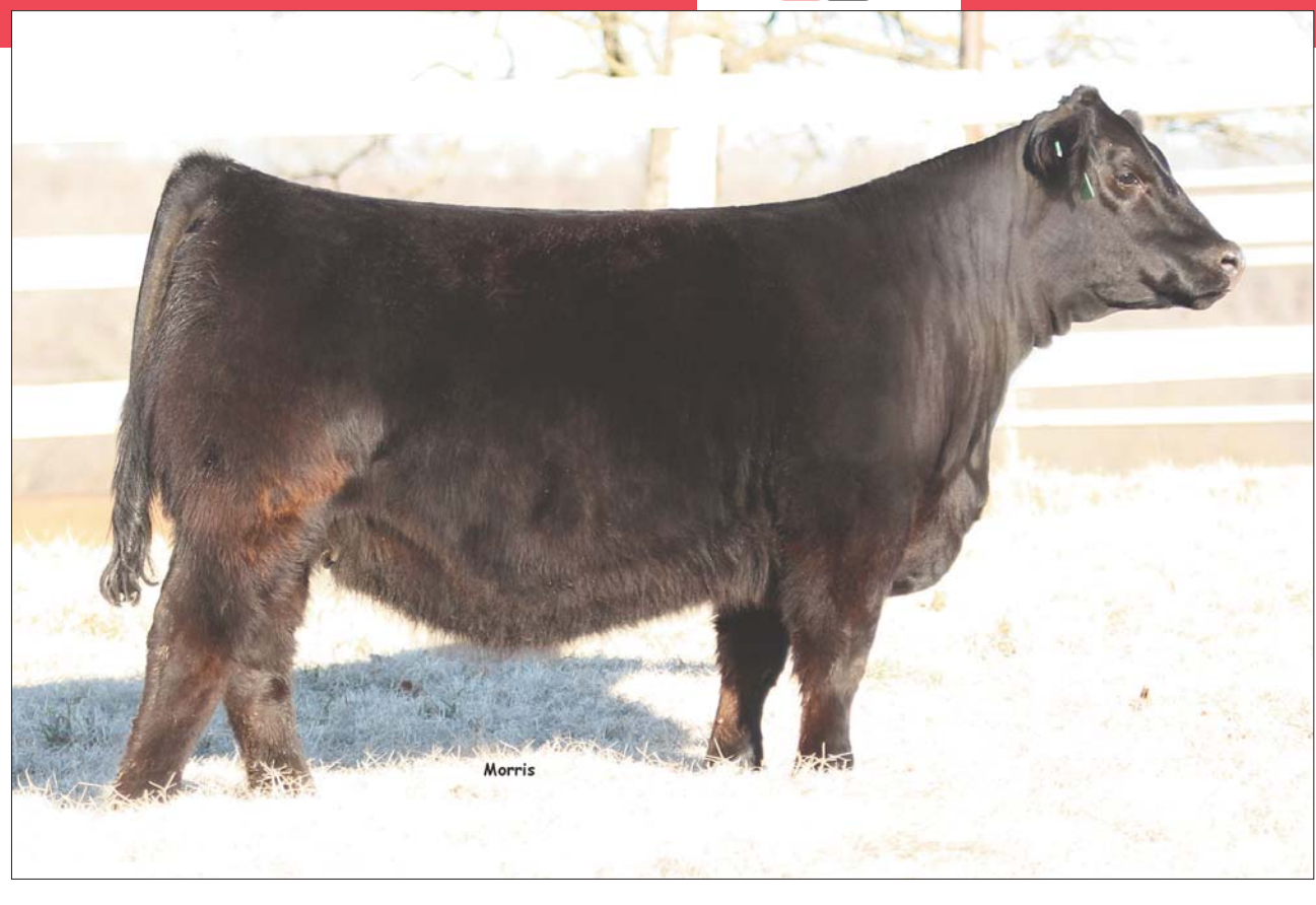
DAM: PBRS Heavens Angel 075H