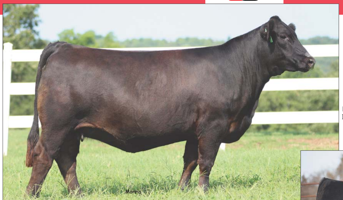
DAM: DARK Sunshine ET