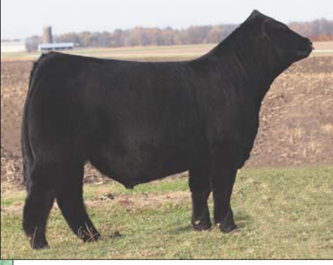
SIRE: SSTO Guns N Roses 9408G ET