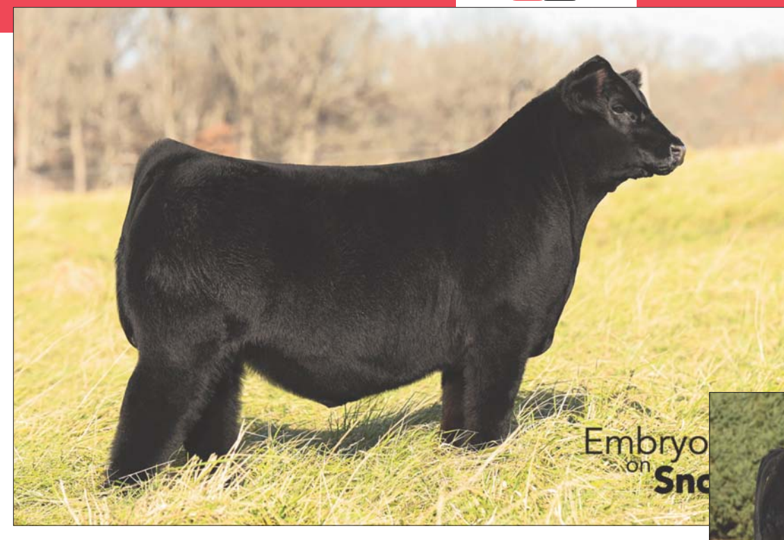
FULL SIB: J6 We The People 411J