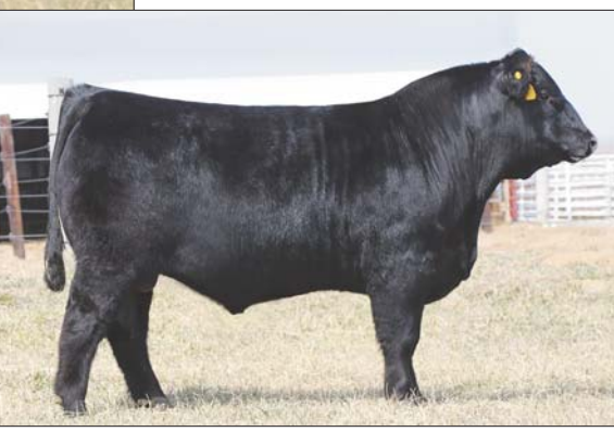
SIRE: CELL Envision 7023E