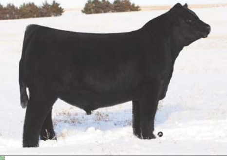
SIRE: Schilling Halas ET