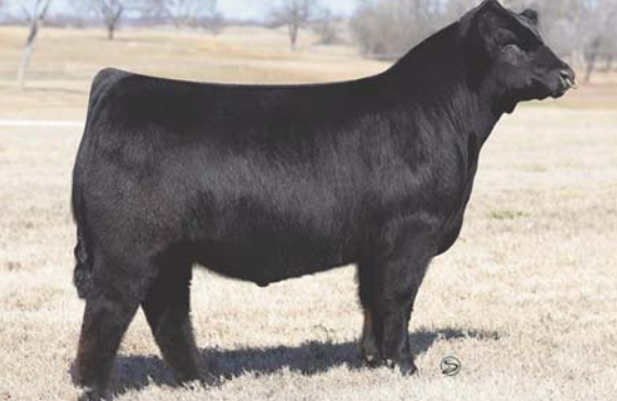
SIRE: ATNF Higher Revenue JCLC 013H