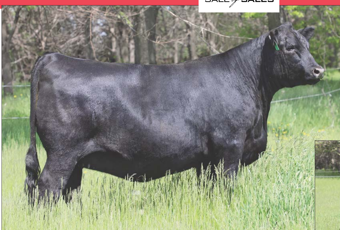
WULFS Jacey Rae 1168J