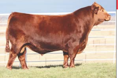
SIRE OF 33B: LFL Deluxe Edition 6029D