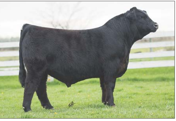
SIRE OF LOT 17A: FWLY LHC Capital ET