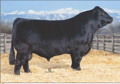
SIRE: ELCX Kings Landy 599D ET