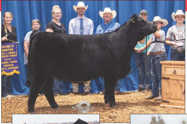
DAM: LFL Fiesta 8126F