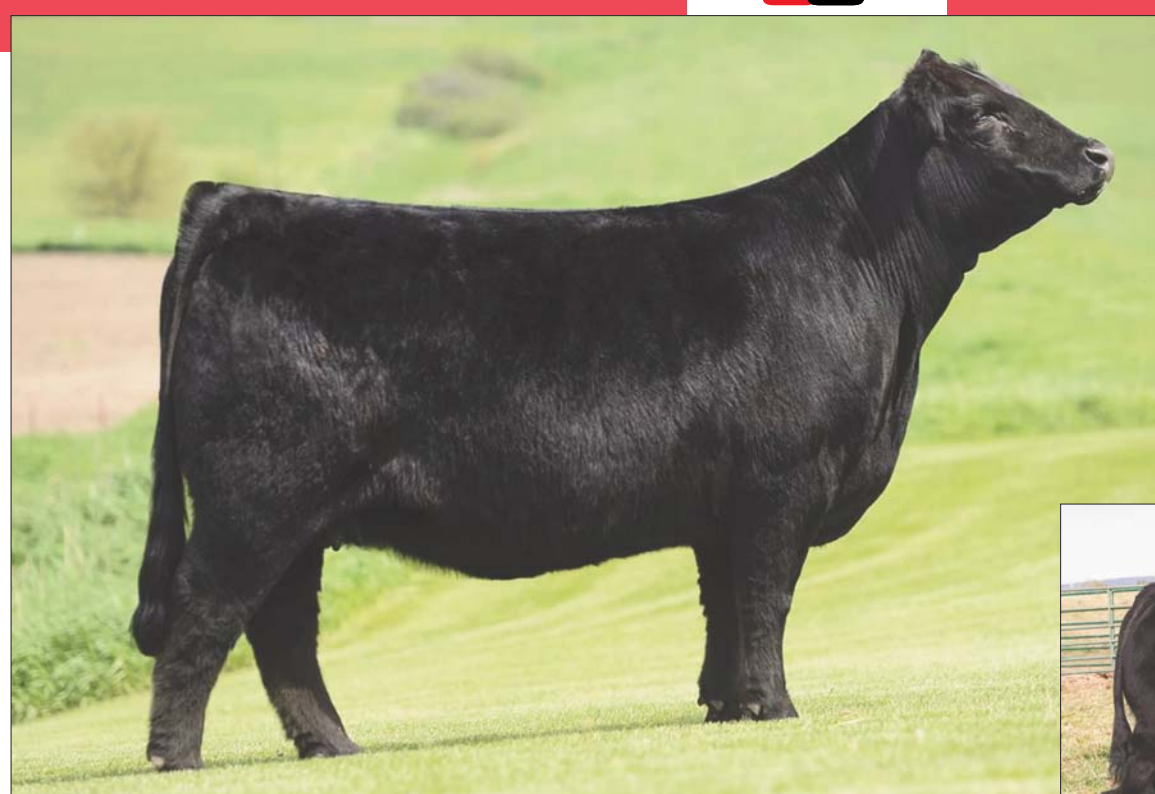
DAM: WLR Prada