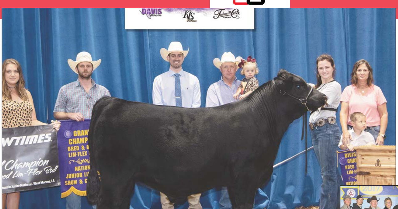
SIRE: MAYC Gold Buckle 624G