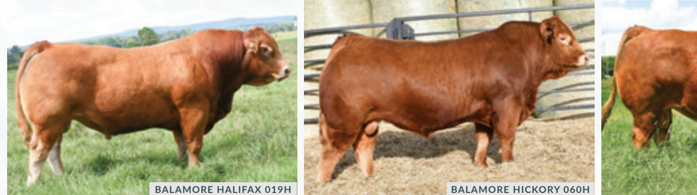
BALAMORE HICKORY 060H