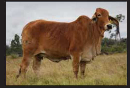
Miss MK 7/634, dam of Moreno Ms. Lady Reba 112