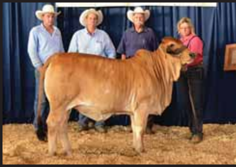
Moreno Ms. Lady Rosalie 444, Sugar Classic calf champion