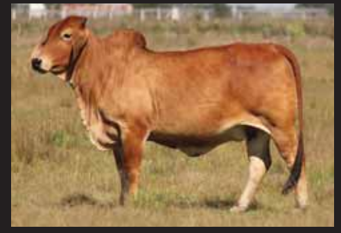
21st MS TNT 201, donor to Lot 16 IVF Flush.