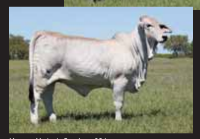
Moreno Ms Lady Precious 364