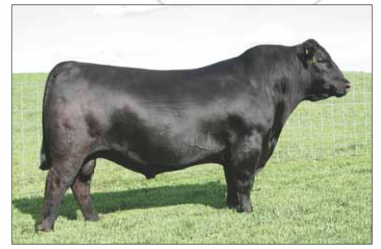
S A V BISMARCK 5682