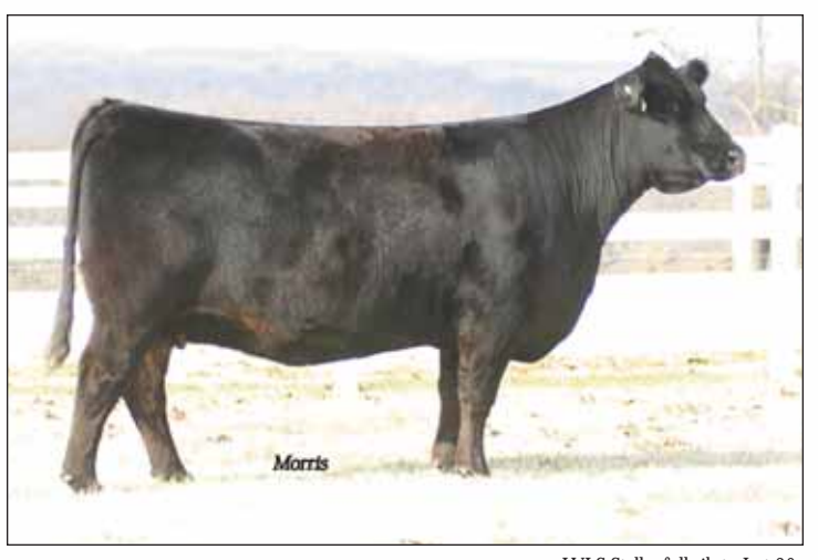
LVLS Stella, full sib to Lot 36.