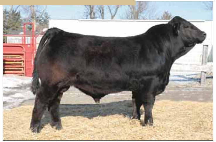
REFERENCE SIRE ... LVLS X-Tra Profit 2014