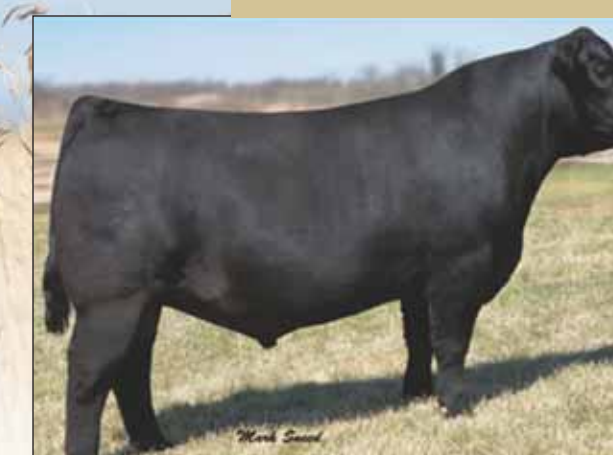
REFERENCE SIRE ... SAV Brilliance 8007