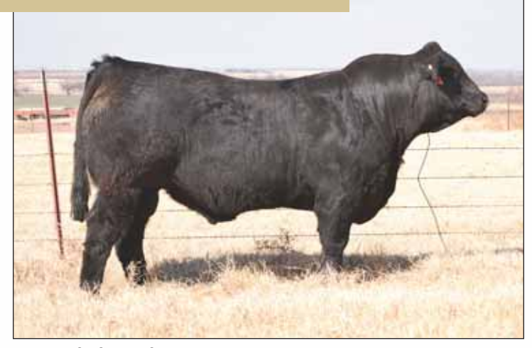
REFERENCE SIRE ... CHR White Rose 162W