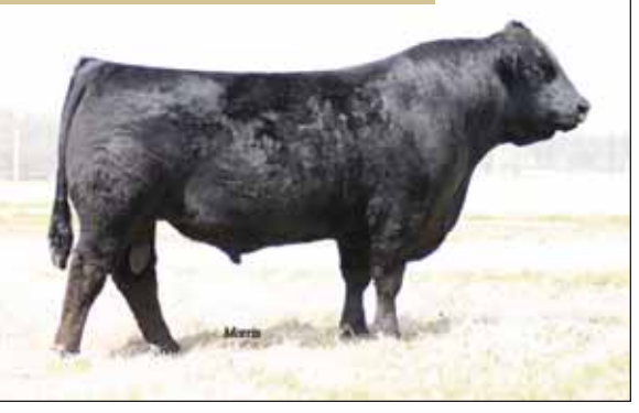
REFERENCE SIRE ... BOHI Top Dollar 7114T