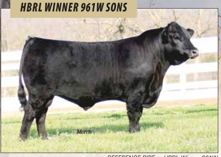
REFERENCE SIRE ... HBRL Winner 961W