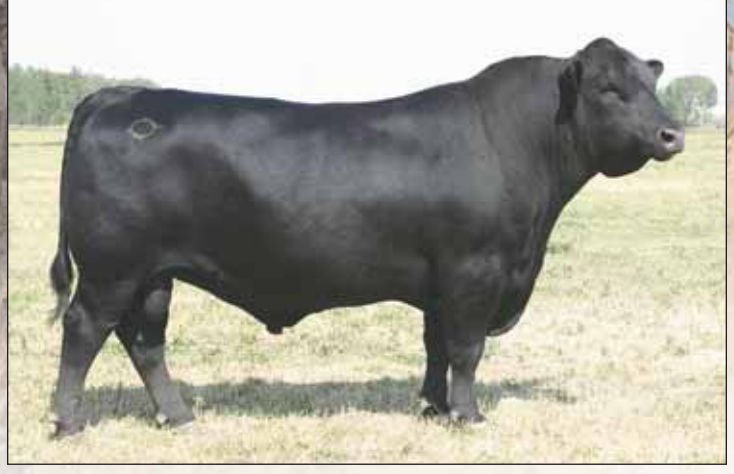
REFERENCE SIRE ... MYTTY In Focus