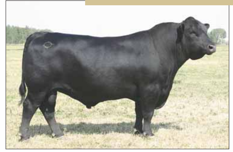
REFERENCE SIRE ... MYTTY In Focus