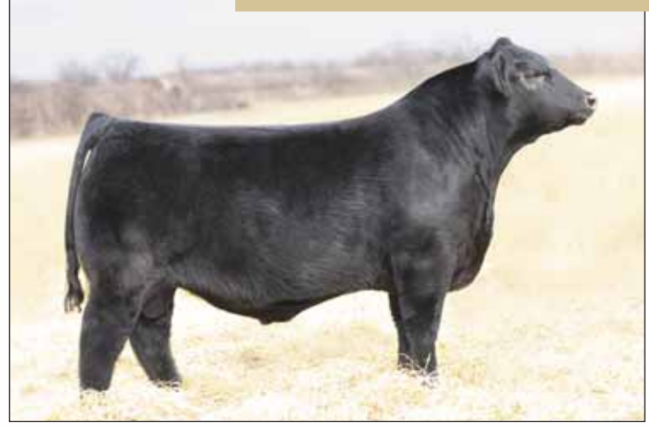
REFERENCE SIRE ... EXAR Upshot 0562B