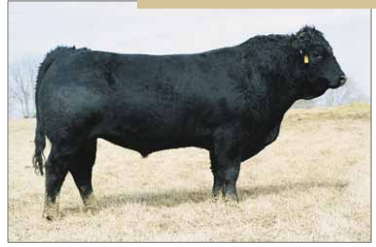
REFERENCE SIRE ... LVLS Top Criteria 8862P