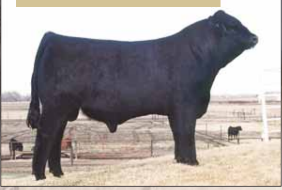
REFERENCE SIRE ... LVLS Secret Weapon