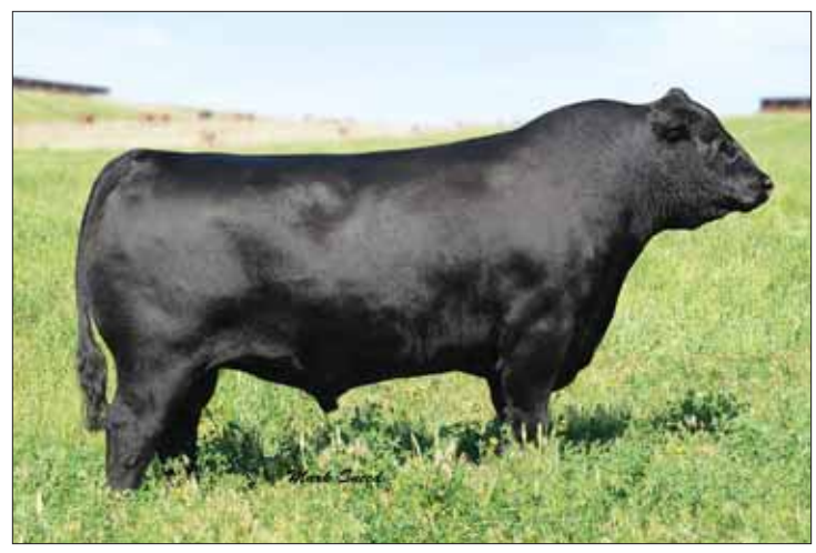
REFERENCE SIRE ... CONNEALY CONSENSUS 7229