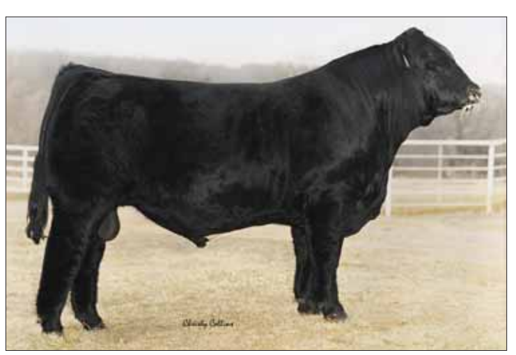
REFERENCE SIRE ... AUTO BLADK DAKOTA 129J