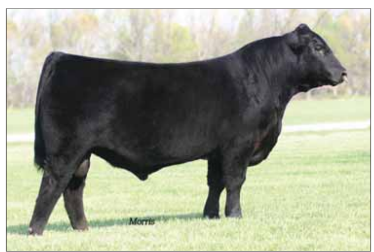
REFERENCE SIRE ... MAGS Y-AXIS