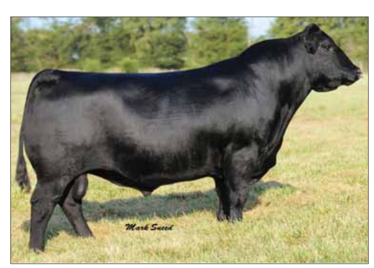
REFERENCE SIRE ... CONNEALY FINAL PRODUCT