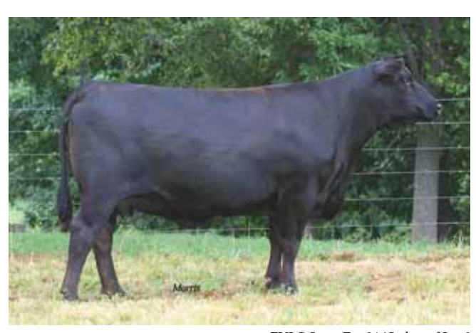
FULC Super Fox 314S, dam of Lot 8