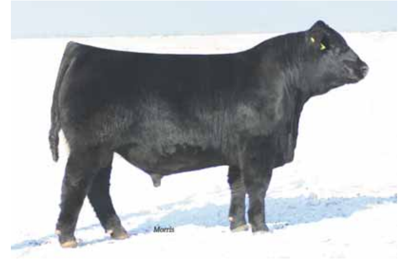
LVLS Creston 9101Y, service sire to Lot 52