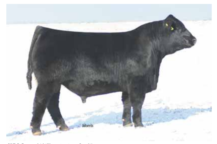
LVLS Creston 9101Y, service sire to Lot 35

LOT 35A - CJLM 8040Z - 10.25.12, PB Limousin, DB/DP. Sired by MINE Southern Lode 8130U.