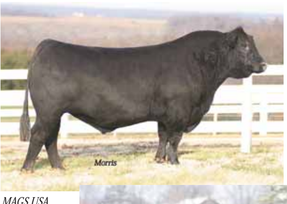
MAGS USA Choice, sire to Lot 30 embryos