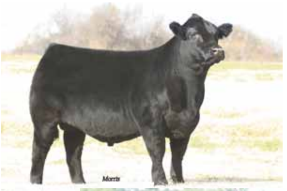
CALO Brickyard 902W, sire of Lot 28 embryos