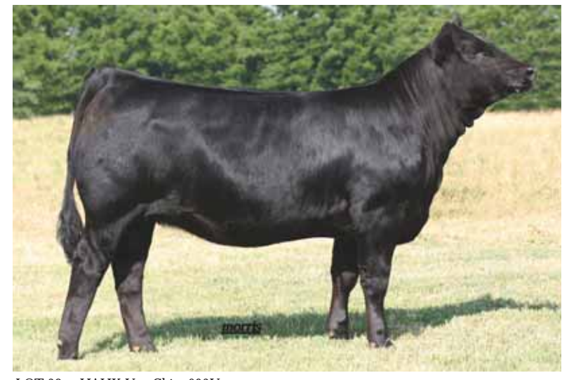
LOT 38 HAHK Una Chica 093U