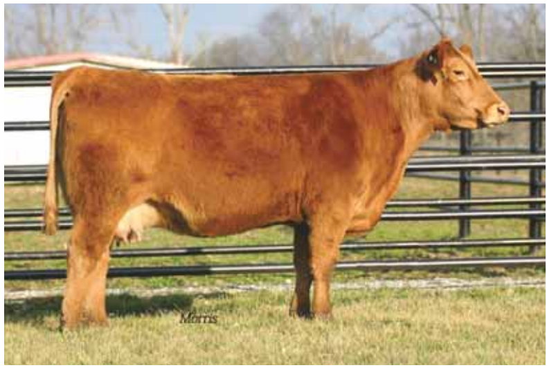
LOT 34 ARWL PLD Cashabanka 7131T

LOT 34A - CJLM 7131Z - Bull, 10.30.12, PB Limousin, DB/DP. Sired by MINE Southern Lode 8130U.