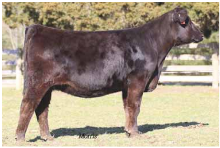
LOT 18 DPBN Thankful 087X