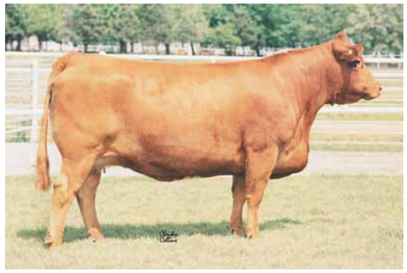
LVLS Rebeca, sister to Lot 42.