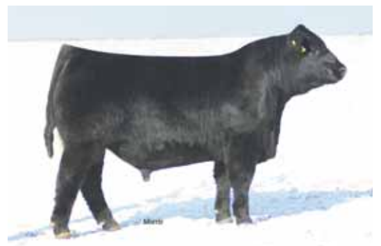
LVLS Creston 9101Y, service sire to Lots 24 & 25.