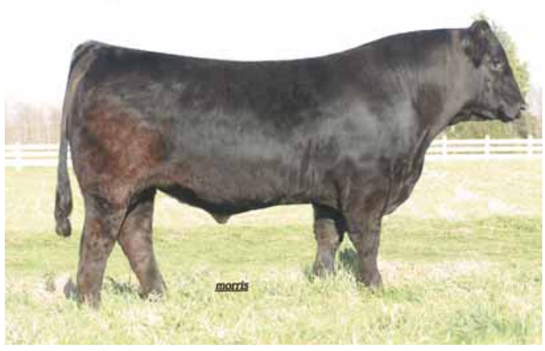
BOHI Titlelist 7050T. sire to Lot 53