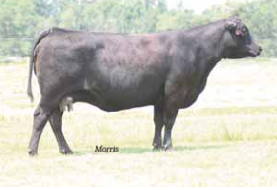
EXLR Rebeca 1014S, dam of Lot 29 embryos