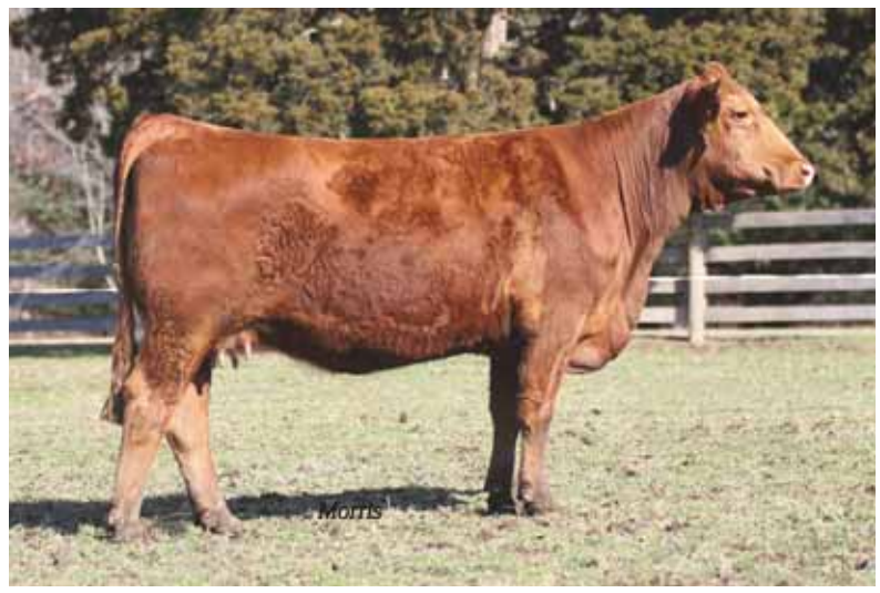
LOT 48 CJLM Winter Berry 395T