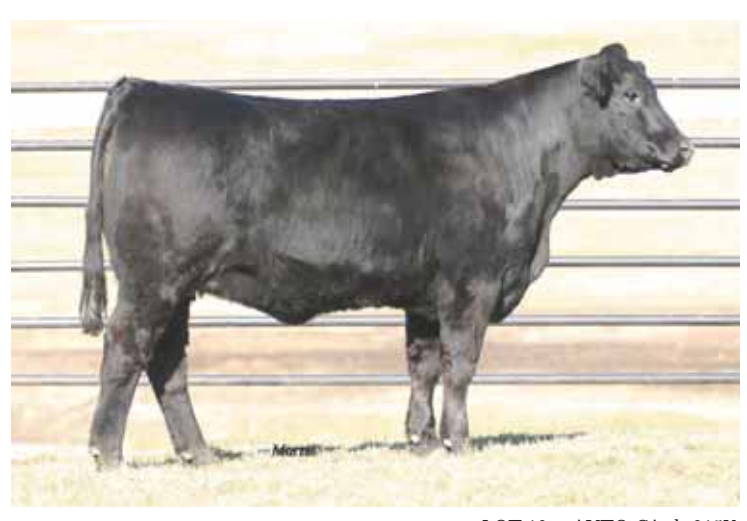
LOT 19 AUTO CAstle 215X