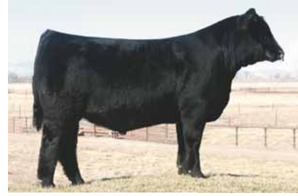
MAGS Xukalani, sire to Lot 32 embryos