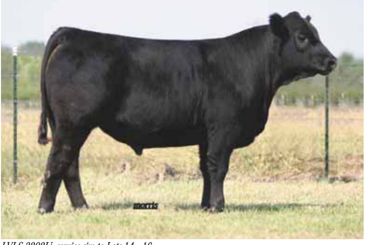
LVLS 3202U, service sire to Lots 14 - 16.