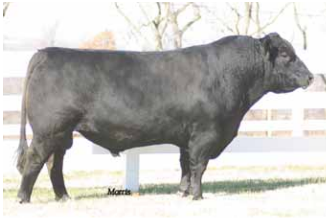
MAGS Teddie, sire of Lot 7