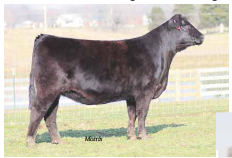
LOT 2 NHCA Yours Truly 316Y