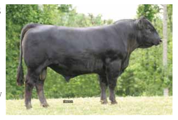
CJLM Putnam 423U