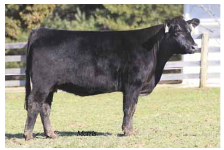
LOT 23 CJLM Miss 30X