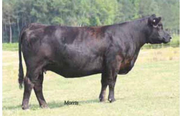
AUTO Mistee 229U, dam of Lot 28 embryos

CALO Brickyard 902W, sire of Lot 28 embryos