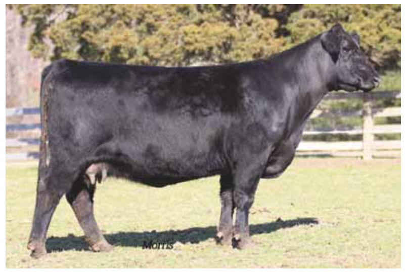
LOT 36 PBRS 578U