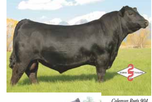
Coleman Regis 904, sire to Lot 31 embryos

LH Resourceful 324R. dam to Lot 31 embryos