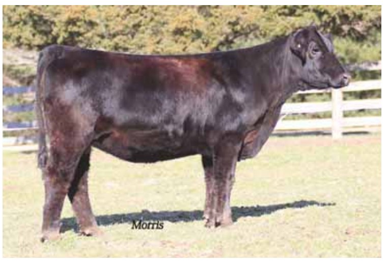
LOT 24 DPBN Thankful 087X