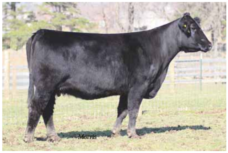
LOT 37 DL Rellic's Undeniable