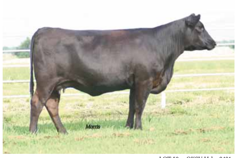
LOT 50 OKSU Helga 8401