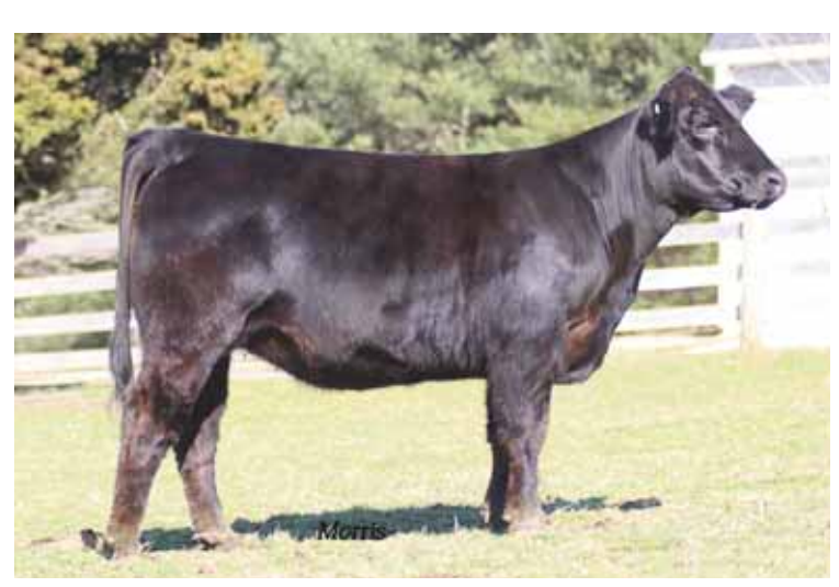
LOT 25 CJLM Miss 081X