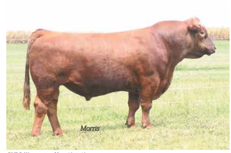
RVDR Winner, sire of Lots 48 & 49.