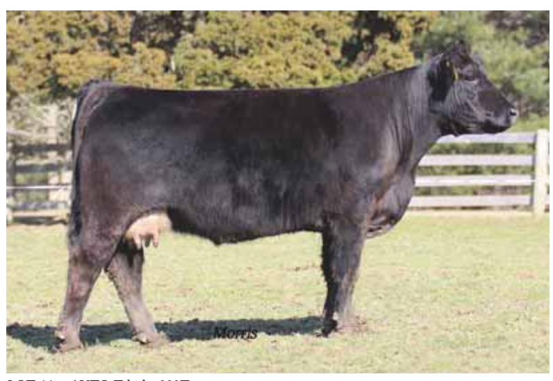
LOT 44 AUTO Tabitha 200T