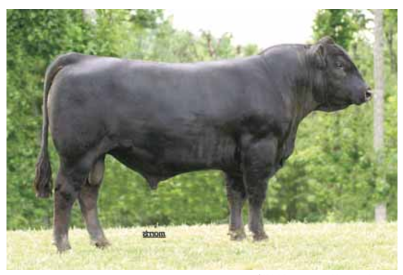
CJLM Putnam 423U, sire to Lot 62.