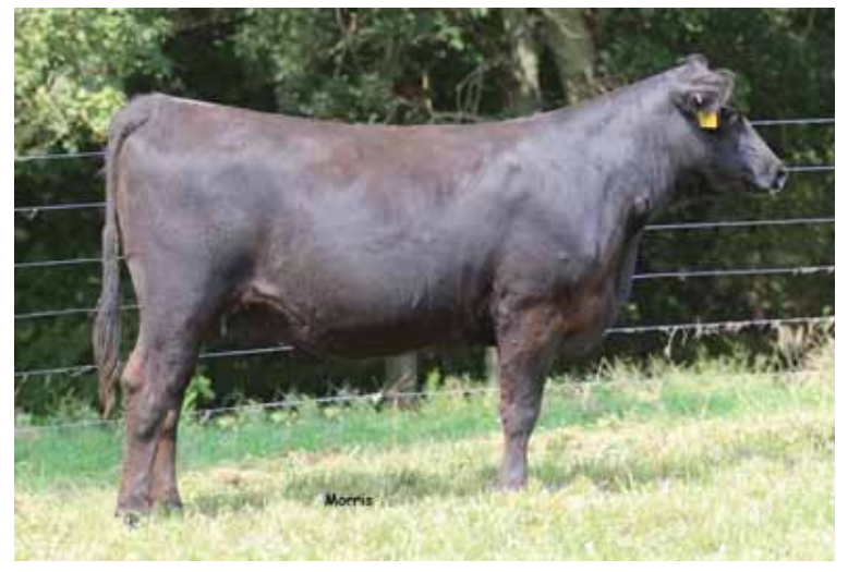
LOT 27 RVF All Starts Here 553Y