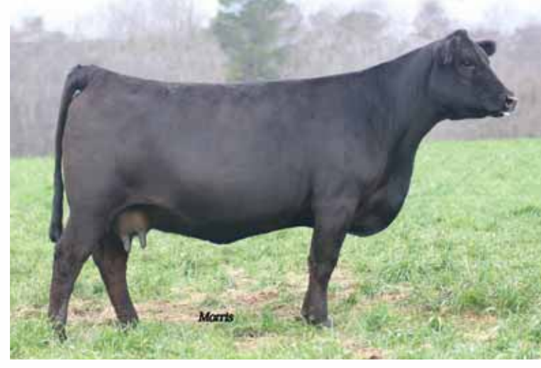
DFLC HBHPC 1S, dam of Lot 18