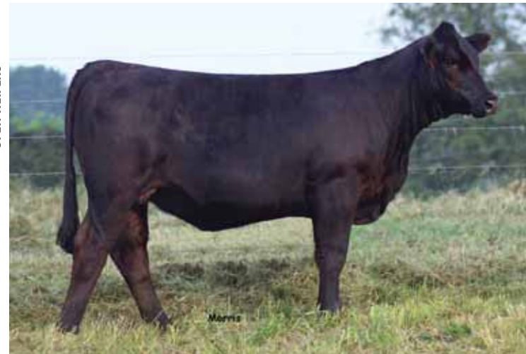
LOT 13 MCC Bright Lights 89Z