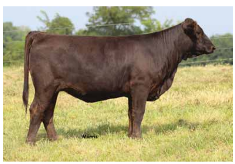
LOT 14 JEPS 103Z