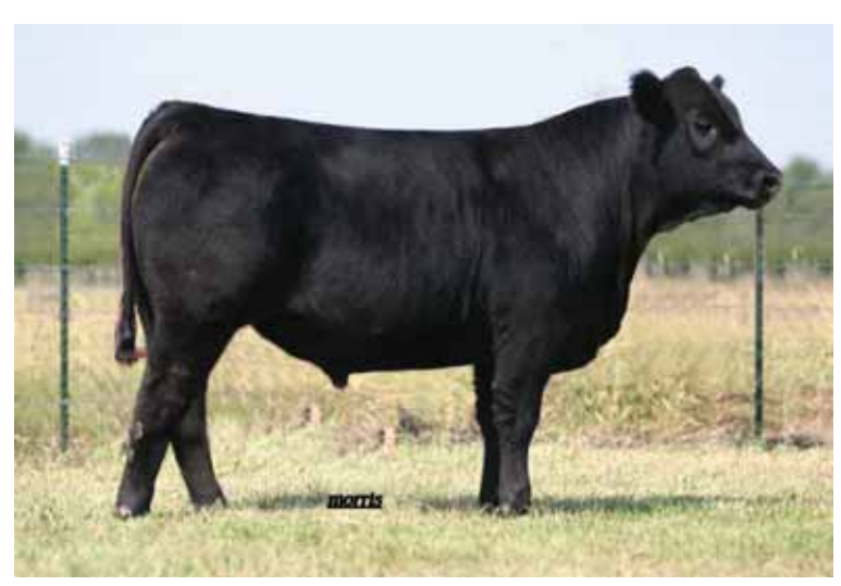
LVLS 3202U, service sire for Lots 51 - 61.