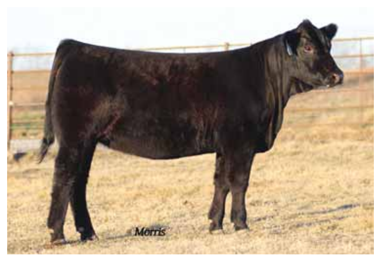
LOT 52 JEPS 368Z