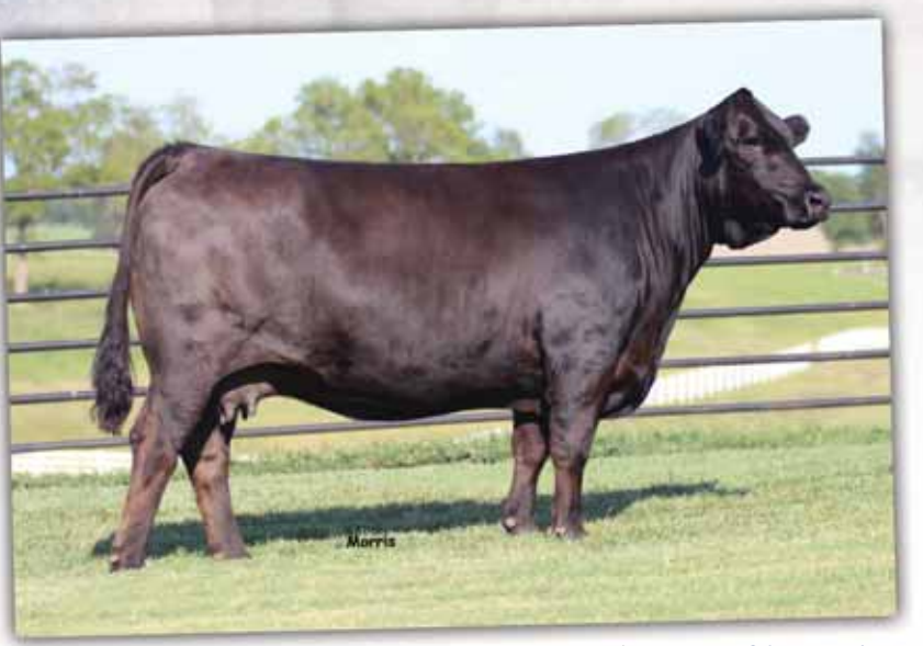
Dam of Lot 2, MAGS Manuela

CED CEM SC ST DOC CW REA YG MARB $MTI BW WW YW MA EPDs 58 9 1.9 59 106 41 35 -0.34 0.47 0.39 P Р Р