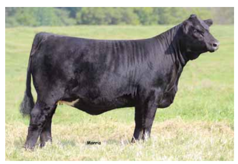
LOT 12 RVF Erica 589Z