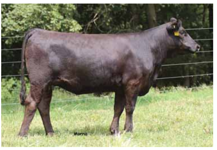
LOT 30 RVF Zoloft 572Z

Consigned by Riverside Valley Farm, Hohenwald, TN