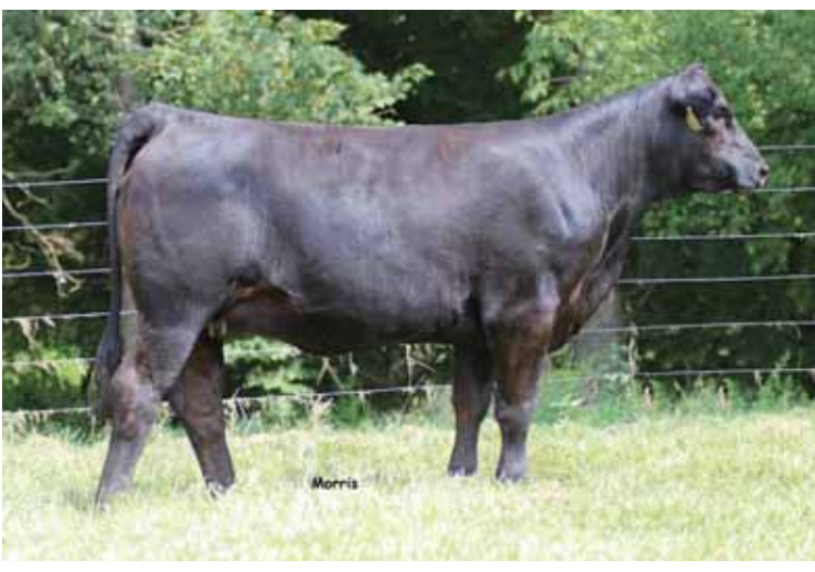
LOT 26 RVF Seduction 561Y

Consigned by Riverside Valley Farm, Hohenwald, TN