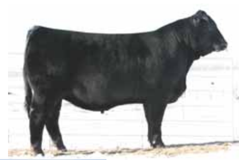
MAGS Winston, sire of Lot 13.