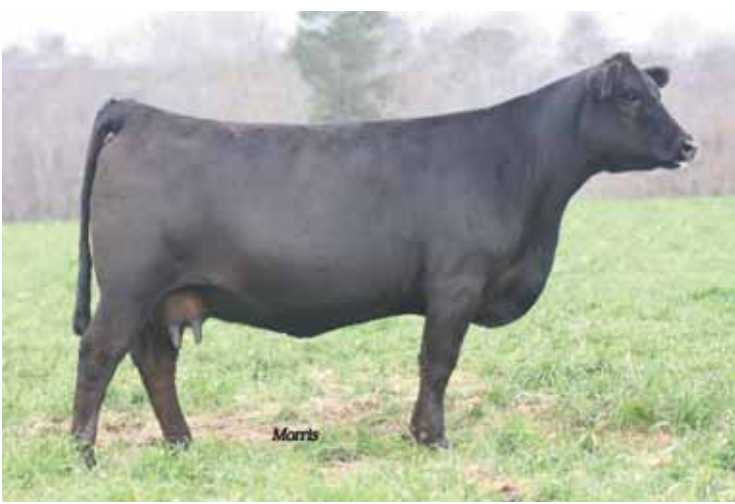
DFLC HBHPC 1S. dam of Lot 10A, 10B & 11

Embryos - National Championship Genetics