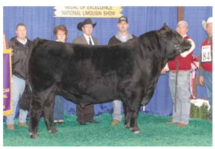
MAGS Unparalleled, sire to Lot 44.