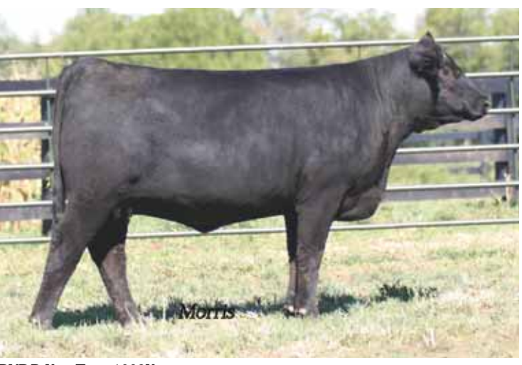
RVDR Xtra Treat 1038X