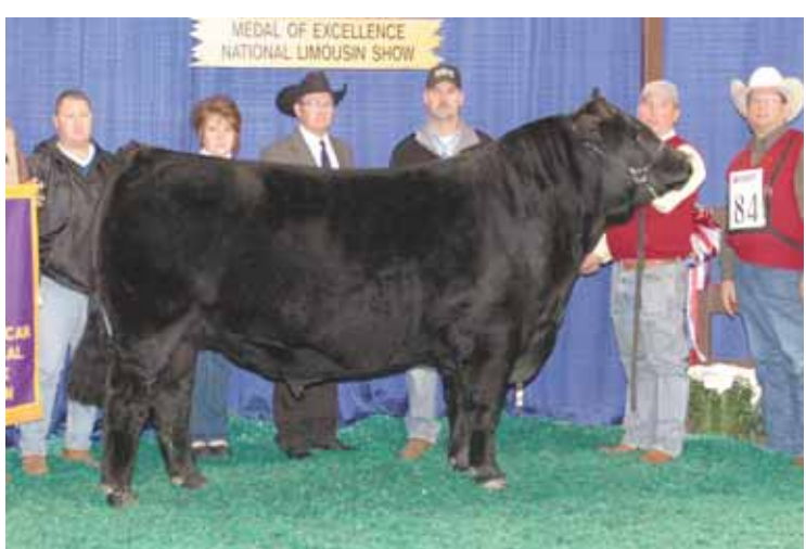
MAGS Unparalleled, service sire to Lot 20.