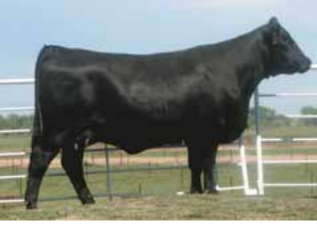
MAGS Rockcress 301R, dam of Lot 13.