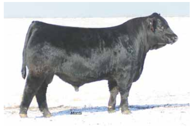
LVLS Yukon, service sire to Lot 23.