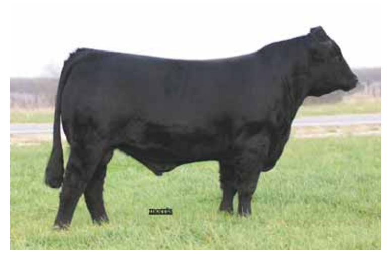
MAGS Unmerciful, sire of Lot 28, 29 & 30.