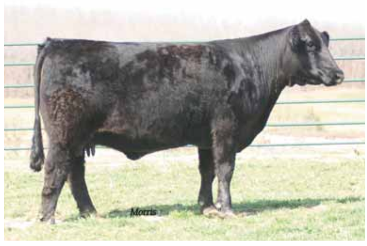
BBJY Angel 698S, dam of Lot 60.

If you have not a member of the North American Limousin Foundation we urge to do so. Feel free to contact NALF at 303.220.1693 or log on to www.nalf.org