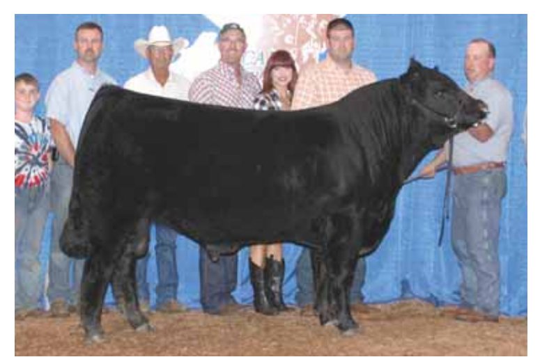
MAGS Landmark, sire to Lot 43.