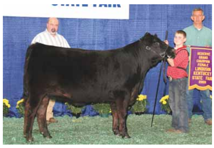
EXLR Sunny 8540U, dam of Lot 35.