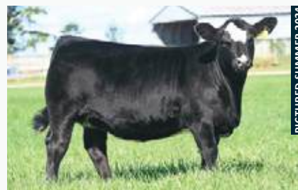
PICTURED SUMMER 2024