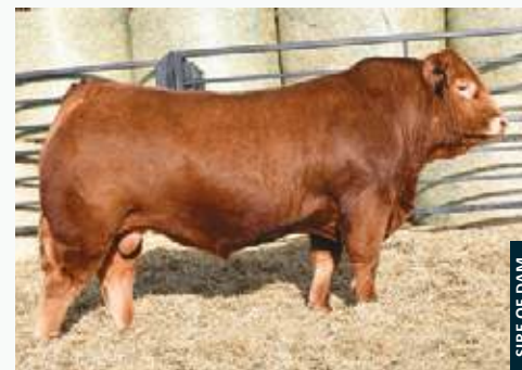
SIRE OF DAM