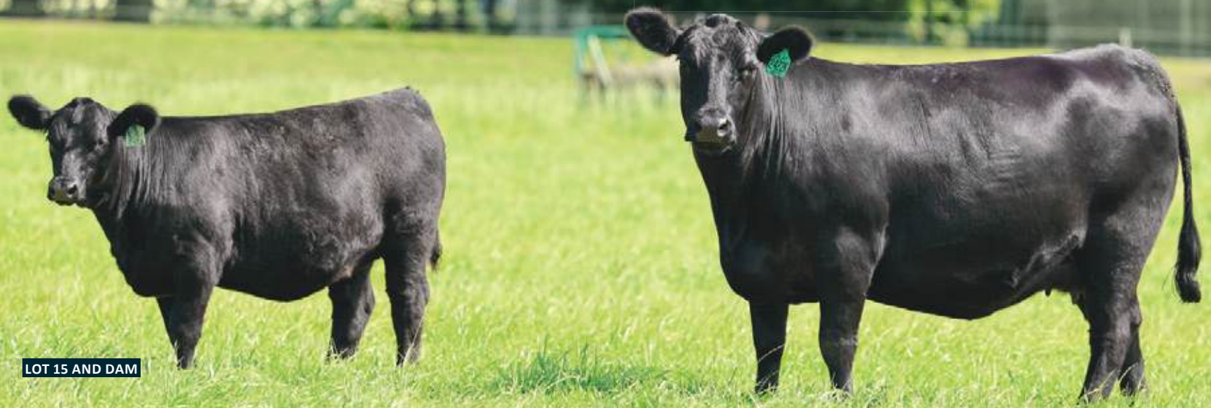
LOT 15 AND DAM