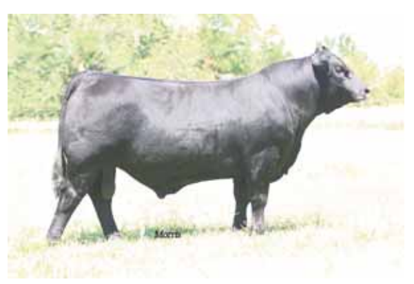
EBFL Ypsilanti 420Y, sire of Lot 26 embryos.

CONSIGNED BY MILAM CATTLE CO., OLMSTEAD, KY