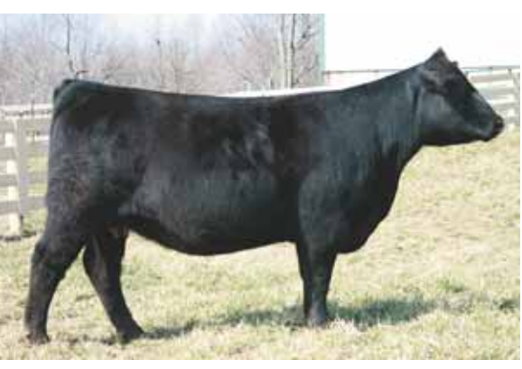
SBLX Untouchable 101U, Lot 23 donor dam.

CONSIGNED BY OWEN CATTLE CO., HORNBEAK, TN AND SUGAR BUSH CATTLE, INC., ALLEN MI