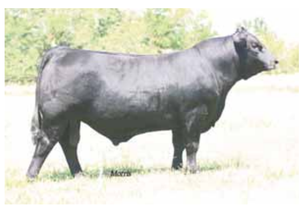
EBFL Ypsilanti 420Y, sire of Lot 19 embryos.