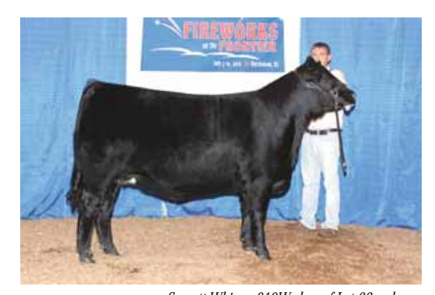
Sennett Whisper 919W, dam of Lot 22 embryos.