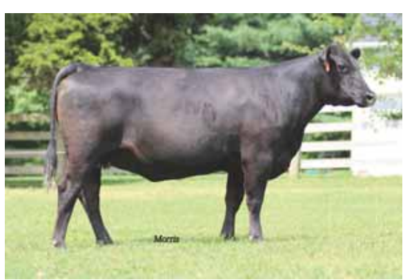
LVLS 3616W, dam of Lot 25 embryos.