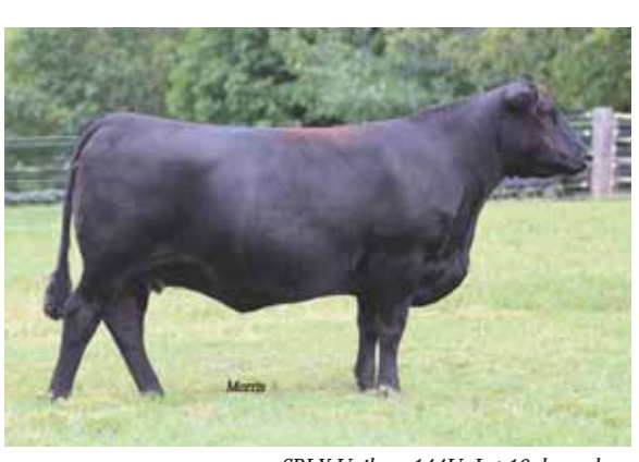
SBLX Unikorn 144U, Lot 18 donor dam.

CONSIGNED BY WIES LIMOUSIN, WELLSVILLE, MO AND SUGAR BUSH CATTLE, INC., ALLEN MI