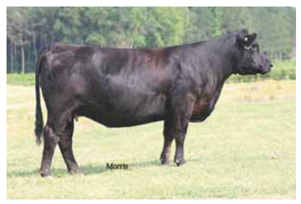
AUTO Mistee 229U, dam of Lot 24 embryos.