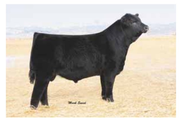
AHCC Westwind W544, sire of Lot 20 embryos.