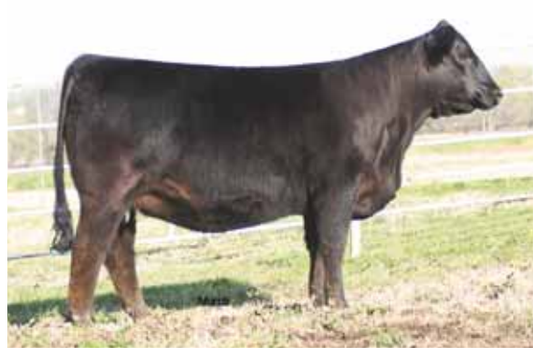
SBLX Underthecovers 201U, full sister to dam of Lot 18 embryos.