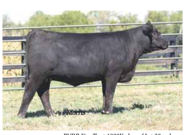
RVDR Xtra Treat 1038X, dam of Lot 26 embryos.