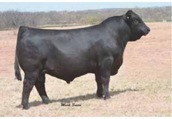
OKSU The Profit 3401, sire of Lot 17 embryos.

CONSIGNED BY EDWARDS LAND & CATTLE CO., BEULAVILLE, NC