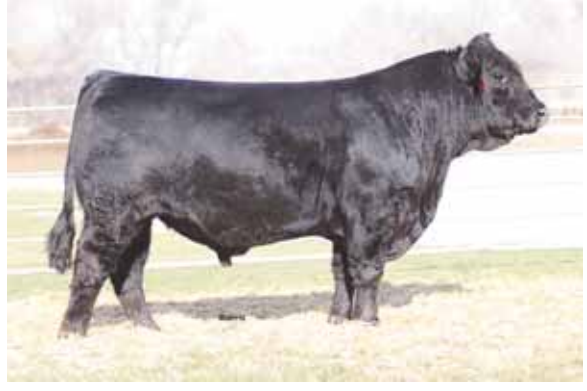
MAGS Xtra Wet, sire of Lot 25 embryos.