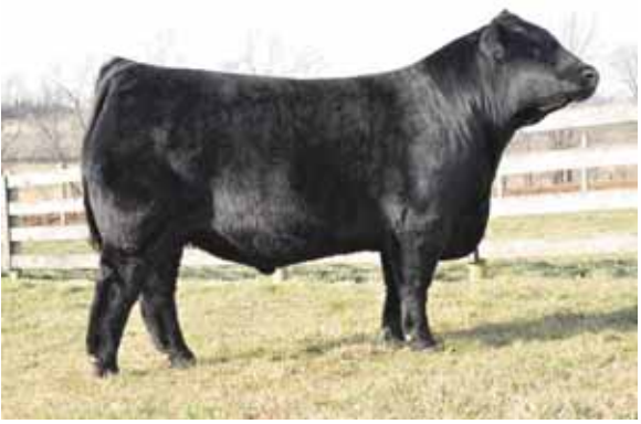
EF Xcessive Force, sire of Lot 21 embryos.