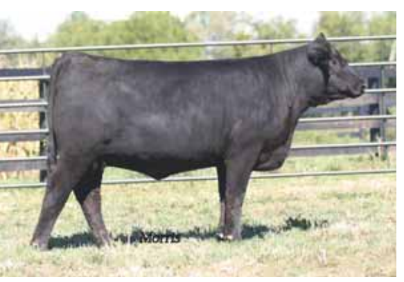
RVDR Xtra Treat 1038X, dam of Lot 27 embryos.