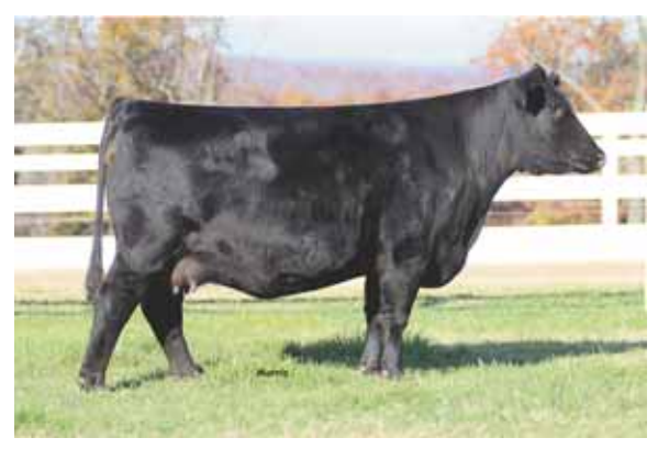
MAGS Whispering Canyon, dam of Lot 19 embryos.