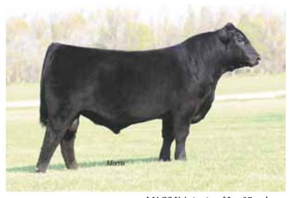
MAGS Y-Axis, sire of Lot 27 embryos.