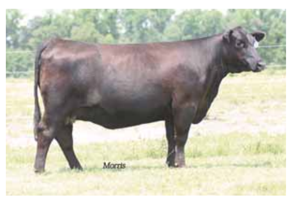
EBFL San Jose 170X, dam of Lot 17 embryos.