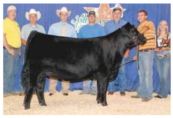
EF Xpect The Best, dam of Lot 20 embryos.