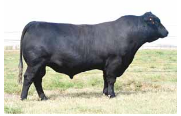
MAGS Eagle, sire of Lot 24 embryos.