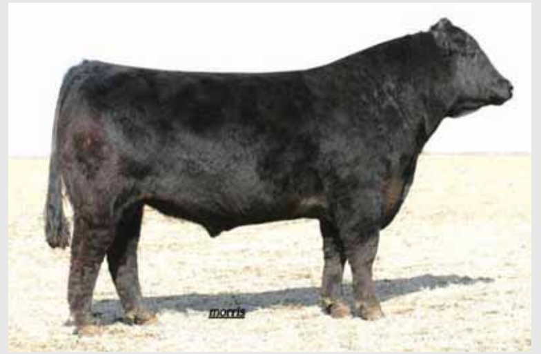
MAGS Shyllo, service sire to Lot 35 & 36.

Consigned by Owen Cattle Co., Hornbeak, TN