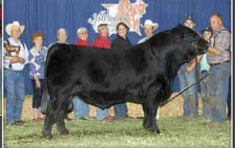
NLR Reloa - 2013 All-American Futurity Grand Champion Bull - Owned with Edwards Land & Cattle Co., Beulaville, NC