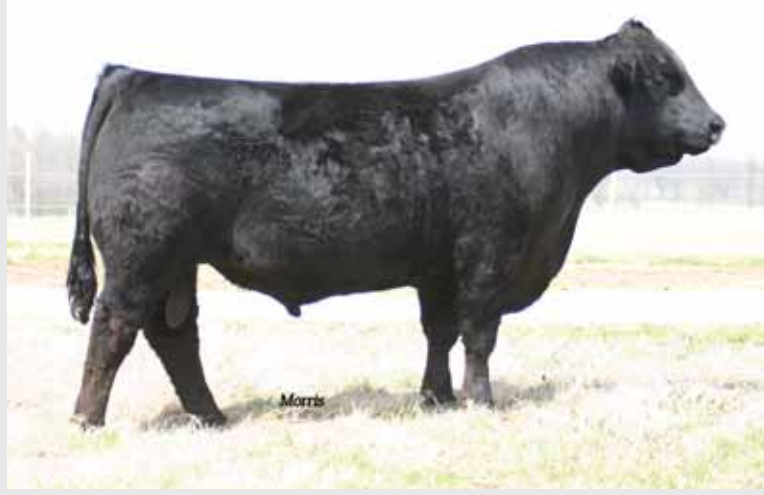
BOHI Top Dollar 7144T, sire to Lot 47 embryos.

PBRS Equinox 161Y, sire to Lot 48 embryos.