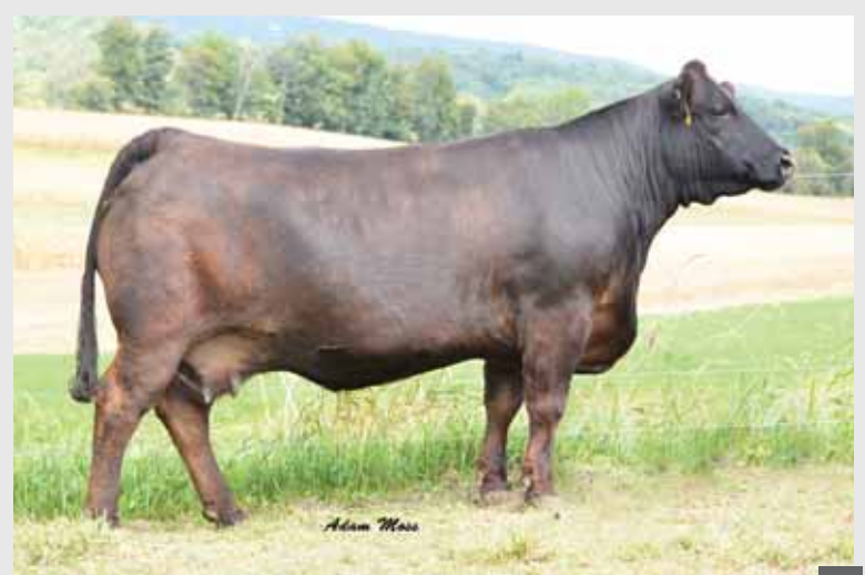
TYEJ DB Serenity, dam of Lot 50 embryos.

Connealy Consensus 7229, sire to Lot 50 embryos.