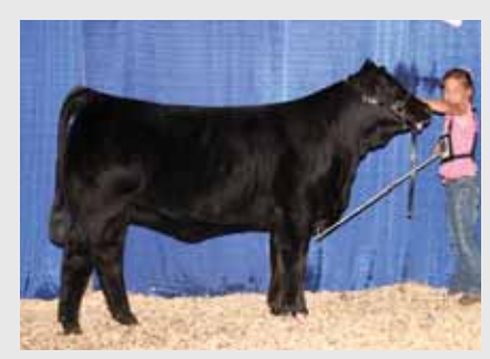
DBGR Something Cool 124Y - 2012 Missouri Junior Field Reserve Grand Champion Female - 2012 Southeast Summer Classic Division Champion - 2012 Misouri State Fair Division Champion - Owned by Carly Henderson