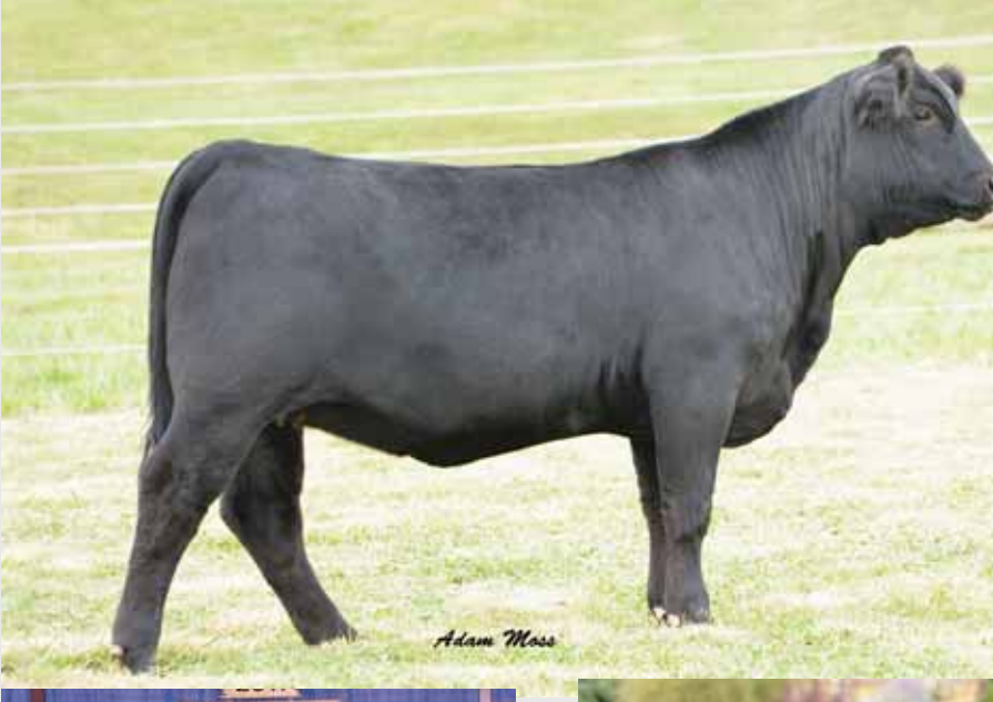
LOT 16 - DBGR Windsong 222A