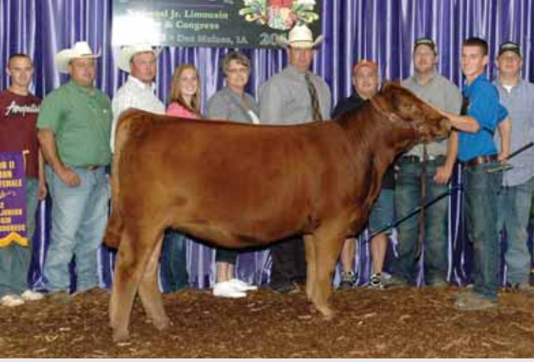
AUTO Bette, sib to Lot 46 embryos.