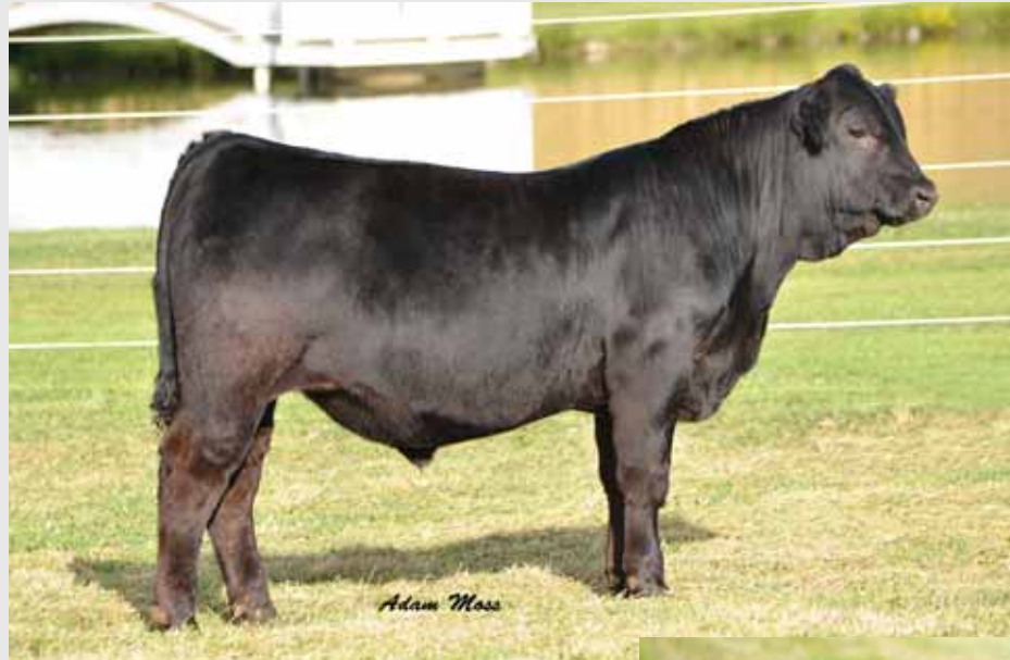
LOT 23 - DBGR Smoking Gun 303A