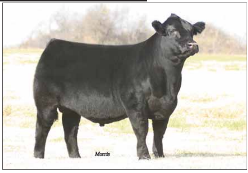
CALO Brickyard 902 W. maternal grandsire of Lot 24.