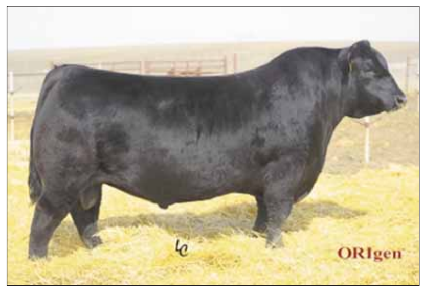
R B Tour of Duty 177, service sire to Lot 30.