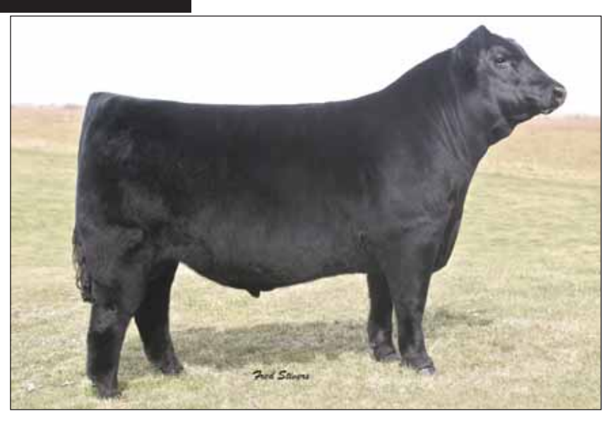
MAGS Y So Tangled, sire of Lots 17 and 18.