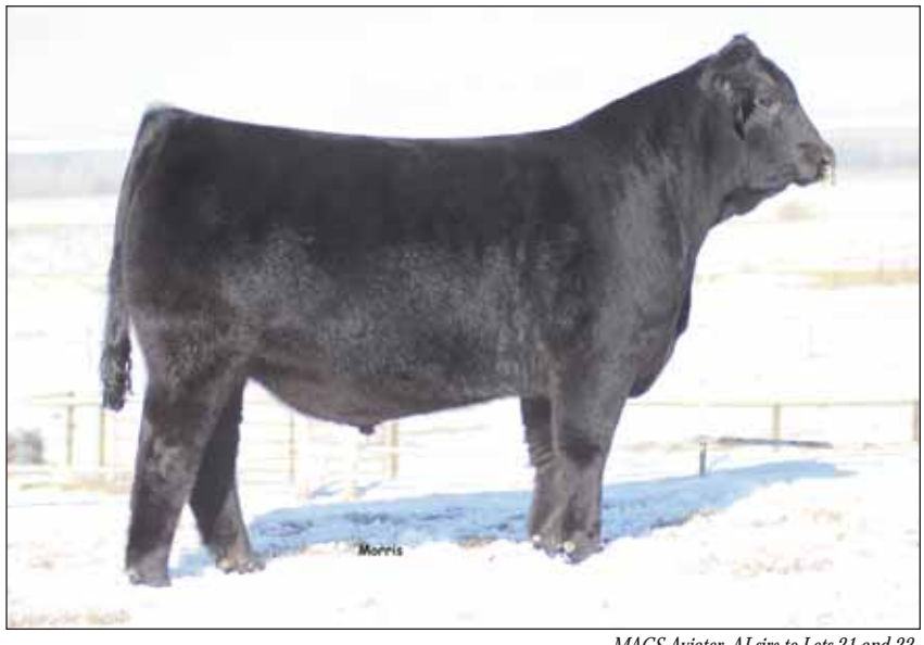
MAGS Aviator, AI sire to Lots 21 and 22.