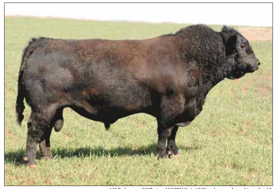
LH Rodemaster 338R, sire of MCBN Yasir 125Y and paternal grandsire to Lot 12.