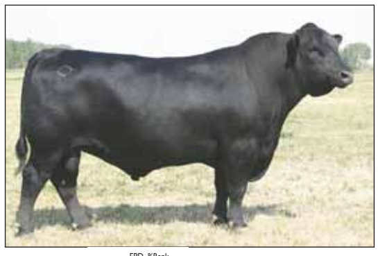
Mytty In Focus, sire of Lot 52.