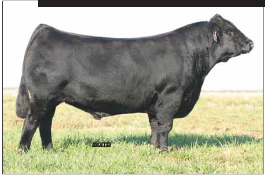
MAGS Savage, sire of Lot 48.