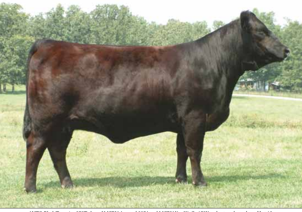
AUTO Black Tangerine 270T, dam of MCBN Armored 307A and MCBN Yere We Go 178Y and paternal grandam of Lot 19.