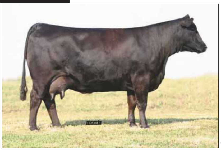
EXLR Scotchcap 1005N, maternal grandam of Lot