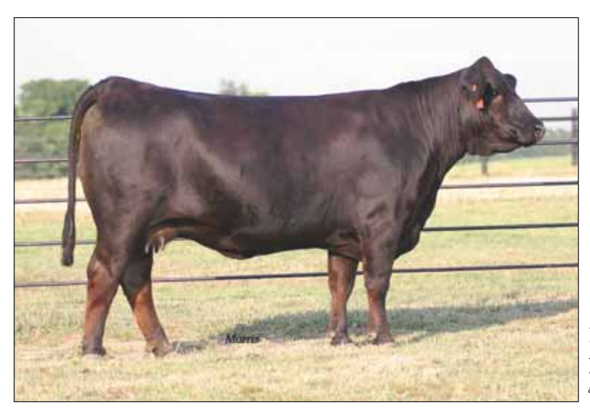
MAGS Roberta, dam of MCBN Zoolander 274Z and paternal grandam of Lot 8.