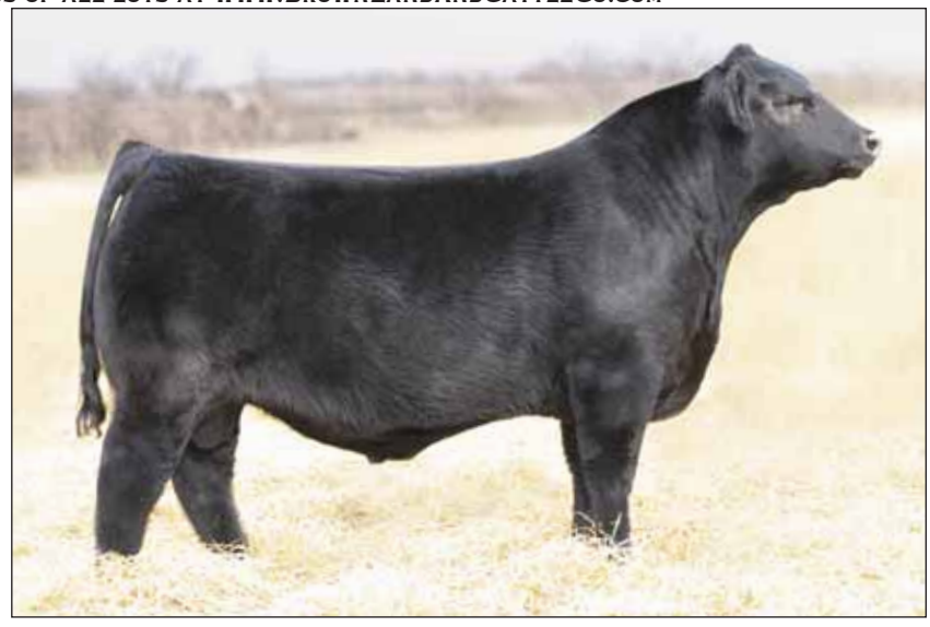
EXAR Upshot 0562B, sire of MCBN Zoolander 274Z and paternal grandsire of Lot 32.