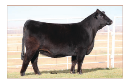
MAGS CANDREA Dam of Lot 6