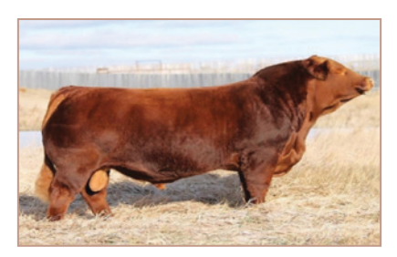
HUNT CREDENTIALS 37C ET Sire of Lot 12