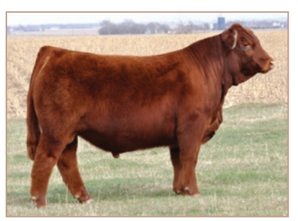
LFLC BANK ACCOUNT 701B Sire of Lot 1

Selling Exclusive Semen Packages 15 Units For $1,000!