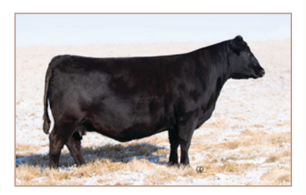
MISS WULFETTE 2285Z Dam of Lot 8

Here's one that promises to catch your attention sale day! Gravity Flow is a flawless structured, flat shouldered, long fronted, level made herd sire prospect that carries a tremendous amount of body depth. On paper, he's homozygous polled and offers a tremendously well balanced EPD profile. Pedigree-wise, he offers a unique mating worth noting being by the widely popular AHCC Earning Power A.I. sire and out of a tremendous Pioneer daughter. On January 14th, if you're in the market for a bull that's functionally sound and attractive made, don't overlook this exceptional individual.