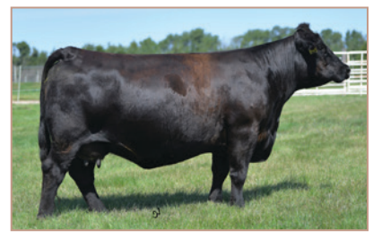
AHCC MISS WHILE Z266 Dam of Lot 13