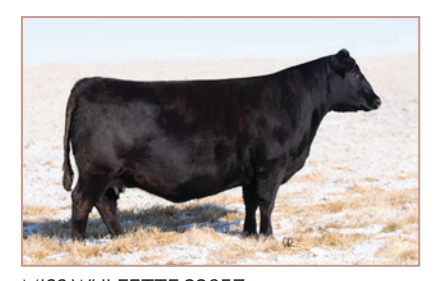
MISS WULFETTE 2285Z Maternal Grandam of Lot 7