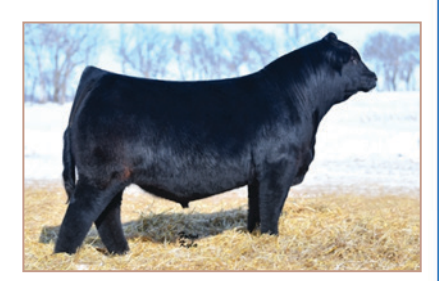
ROMN FLOYD MUDHENKEY 101F Paternal Sibling