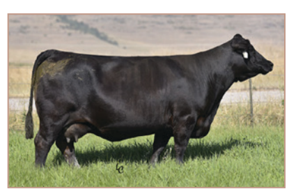
COLE MISS TRAVELER 029X Dam of Lot 9