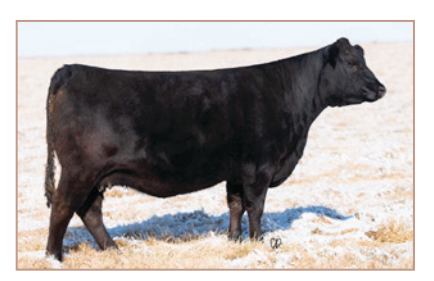
LEWIS SILVERMAKER D106 Dam of Lot 11