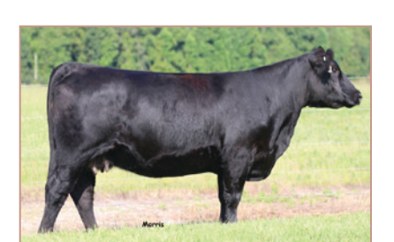
PBRS AUDREY 346A Dam of Lot 5

A full sib to LVLS 2F. This guy is a long-bodied, big-scrotaled bull that stands on such a big foot, substance of bone and an even more impressive width at the base of his skeleton. He is a higher percentage bull that will be a versatile breeding piece in any program looking to add elite genetics to their herd. LVLS 3F is from the RLBH Air Force One x PBRS Audrey 346A mating, so we're confident in the tremendous power, style and efficiency this bull brings to the table.