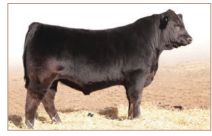
DANH DURHAM 54D Sire of Lot 10