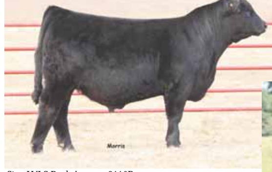
Sire, LVLS Bank Account 8116B