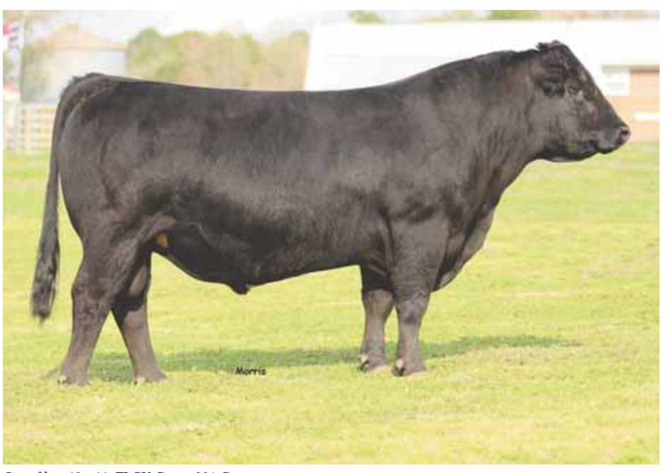
Sire of lots 42 - 44, ELCX Caesar 331 C

ELCX Futurest 308F is a daughter of a super exciting RLBH Air Force One son, ELCX Caesar. Her dam is ELCX Aeriela 308A, a MAGS Winston female. This female's marbling and birthweight EPDs both rank in the top 20% of the breed. She is homozygous black and heterozygous polled and 53% Lim-Flex.