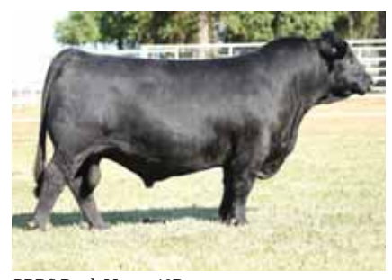
PBRS Bunk House 48B