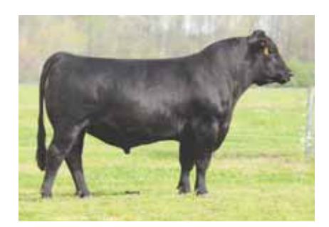
ELC Twisted Ex C561

Lim-Flex (43) Bull Polled / HB SSTO 456B LFM 2077532 10.03.14