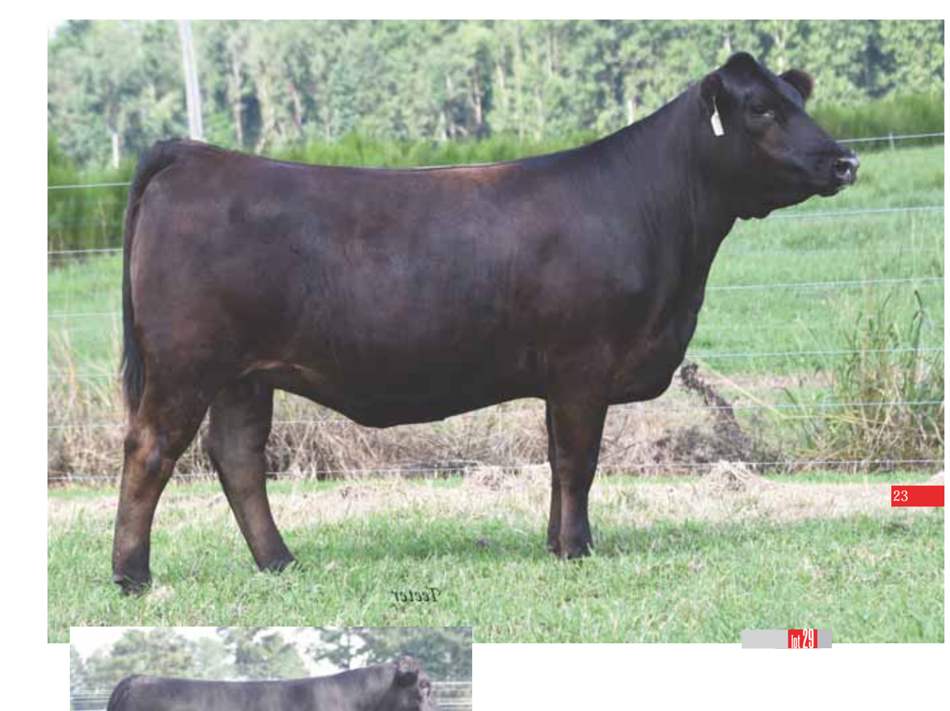
Sire of Lots 29 & 30, TW Fire N' Ice

Now this gal is straight fire! ELCX Fire Queen 806F is a homozygous polled and double black daughter of TW Fire N' Ice and out of a CALO Brickyard female, ELCX Victoria 306Z. Fire Queen has some impressive numbers- her milk EPD ranks in the top 4% of the breed and her birthweight ranks in the top 15%. She is a 62% Lim-Flex female.