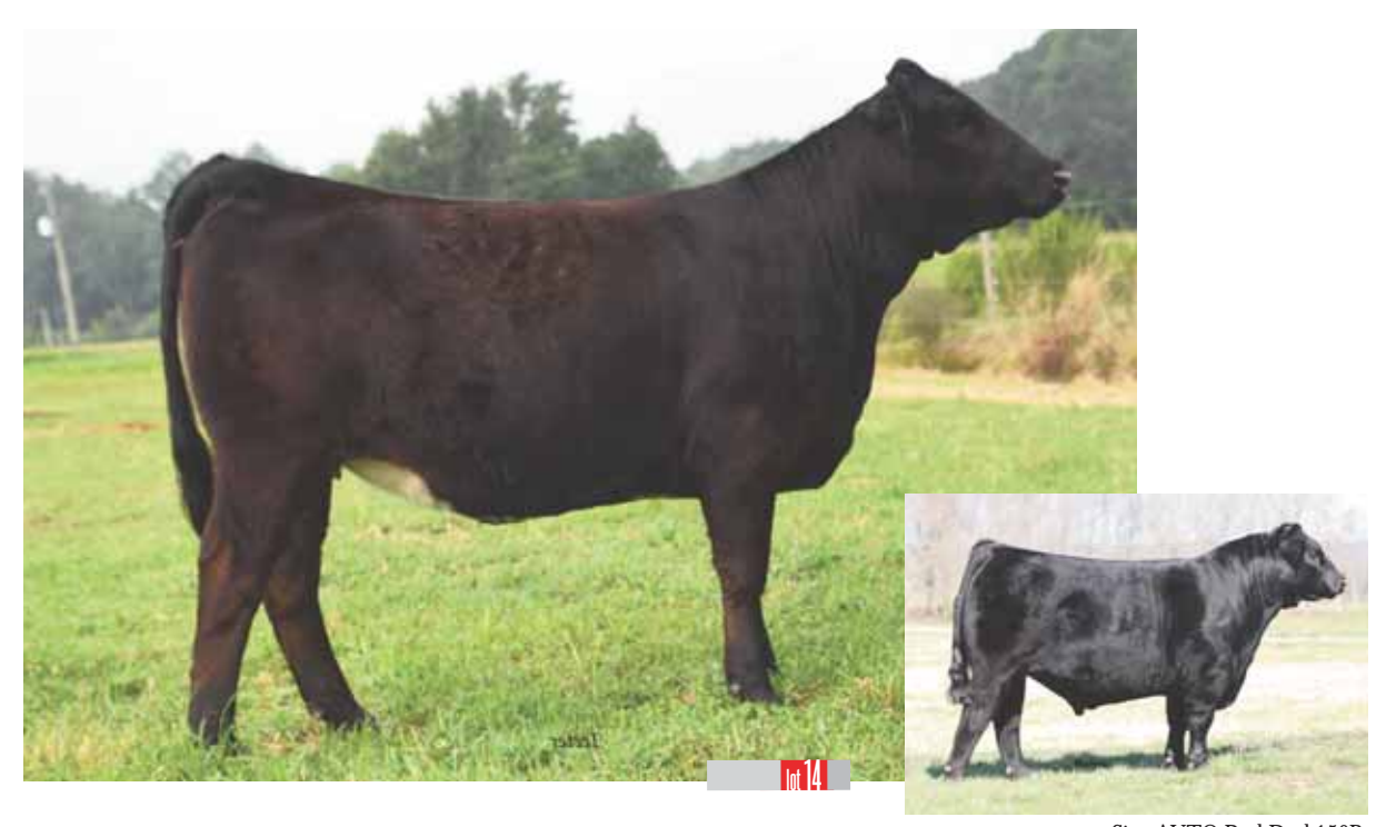
Sire, AUTO Real Deal 150B