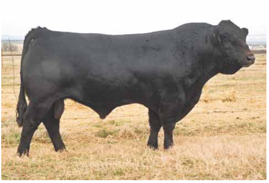
Sire of lots 36 & 37. JCL Lodestar 27L