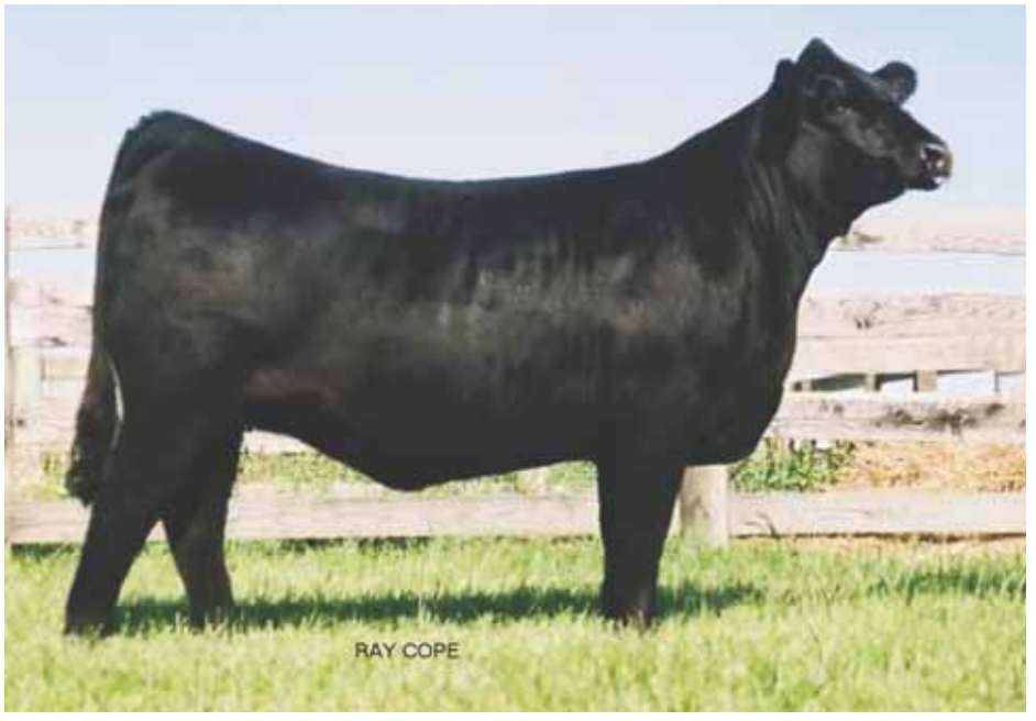
Dam of lots 35 - 37, AUTO Christy 8889R

ELCX Future Star 845F ET is a 75%-Flex female out of the legendary JCL Lodestar. Her dam is the EXAR New Design daughter, AUTO Christy 8889R. She is homozygous black and heterozygous polled. ELCX Future Star 845F is a full sibling to ELCX Fun Size 840F, so don't miss this phenomenal opportunity!