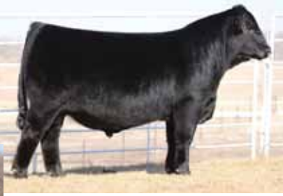
MAGS Firestone 218F