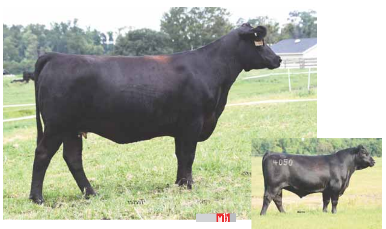
Sire, Woodside Rito 4050 of 0M3