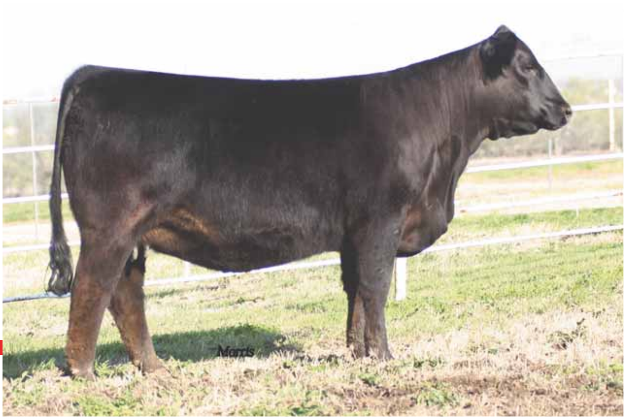
Grandam of Lot 31. ELCX Underthecovesr 201U