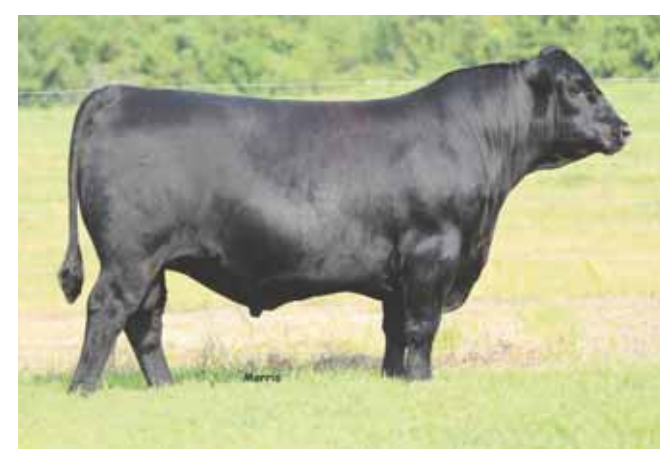
Sire, Benchwarmer 363B

P.E. 1.03.2020 to 4.04.2020 to ELCX Fully Royal 451F (75% DP/HB)