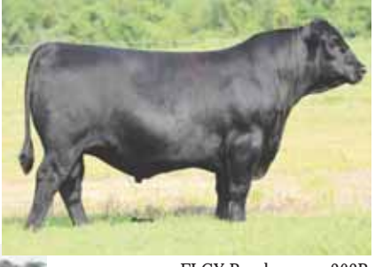
ELCX Benchwarmer 363B