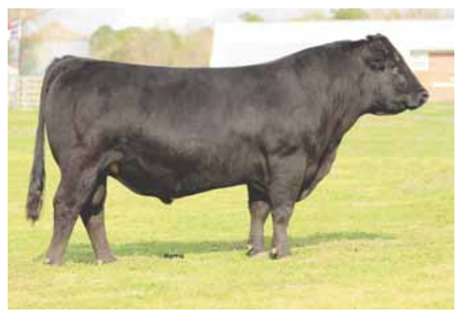
Sire, ELCX Caesar 331C