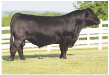
ELCX Bullet Proof 438B