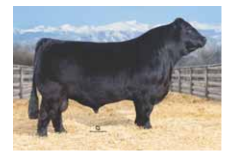
ELCX Kings Landing 599D