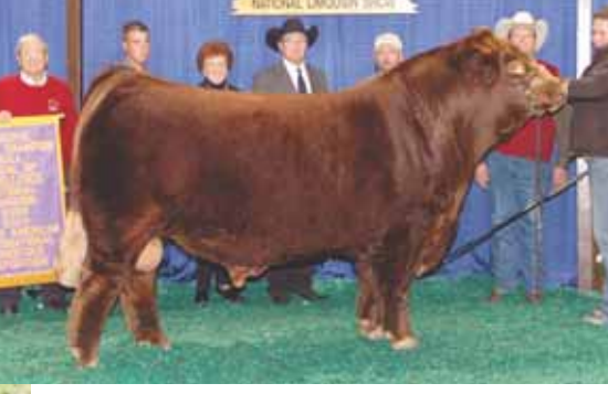
Sire, MAGS WLR Usual Suspect