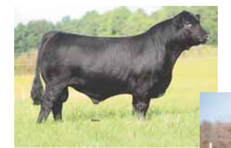
HWCB Eye of the Storm