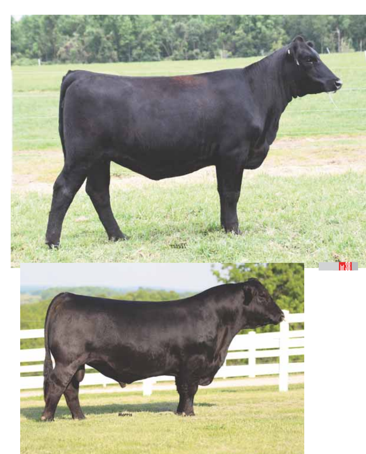
Sire of lots 38 - 41, ELCX Bullet Proof