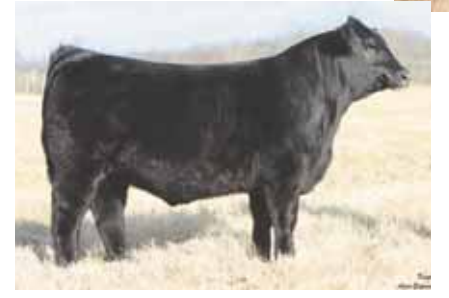
AGRI Chairman 1C ET