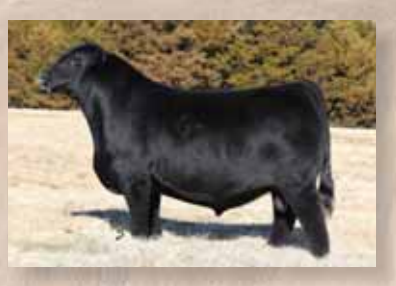
SIRE LOT 30 GCC MONEY EARNED 852E ET

This son of the extreme phenotype Conley Express 7211 has an incredible pedigree that's built around a decade of performance, eye appeal, highly maternal, and with plenty of muscle shape.