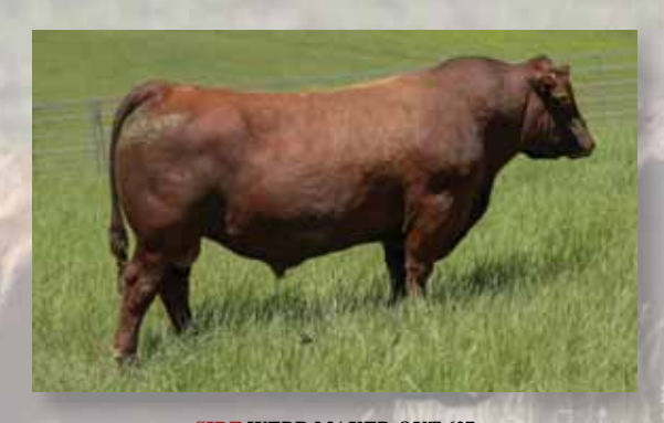
SIRE WEBR MAXED OUT 627

Another stout son of the J6 balance king WEBR Maxed Out 627. '150H' has a load of volume and capacity, along with being chucked full of red meat. His dam, J6 Betty 288F, has been a solid producer with a great udder. Don't miss out on these herd changing Maxed Out sons.