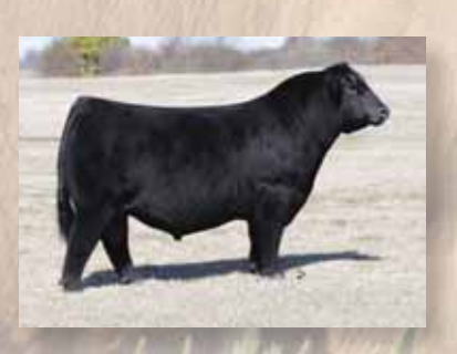
SIRE LOT 31 CONLEY EXPRESS 7211