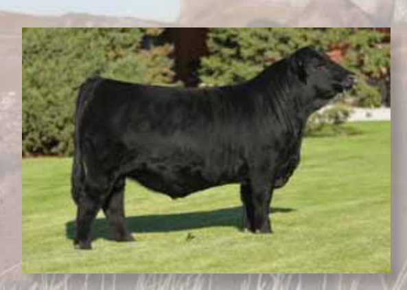
Service of Lot 52 WLR Final Call

This Lim-Flex daughter of MAGS Summit 284D is built to last with her massive rib shape and wide top, along with her very balanced makeup. '169G' has all the components of a great female. Bull Bred to J6 Lookout 213G ECD approx. 4-8-21