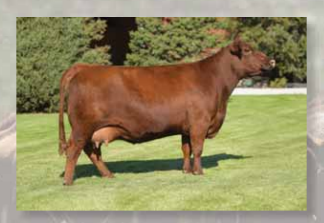
DAM LOT 10 & 11 SIX MILE SASSY SIERA 156B

Right on into another very complete powerhouse son of WEBR Maxed Out 627 the J6 Farm do-it-all herd sire. '155H', as you can tell by studying the picture has a load of muscle in his hip and an even bigger load of rib shape and body, deep in his heart girth, very correct on his feet and legs.