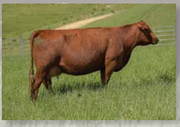
DAM RED SIX MILE MS EXTRA 367B