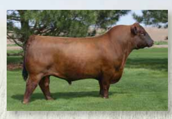
SIRE LOT 48 & REFERENCE SIRE NIGHT WATCH SIX MILE & CO JAGGER 780A

This Six Mile & CO Jagger 780A daughter has the ultimate brood cow look already with her deep soft rib shape, excellent level top line and smooth front one third. She puts it all together in a super complete package. Bull Bred to J6 Night Watch E602 ECD approx. 4-29-21