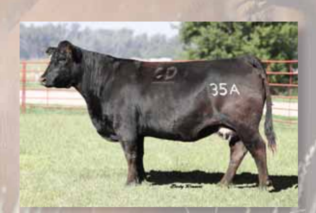
DAM LOTS 32&33 DANH ALTO 35A

This Lim-flex son of Red Wildman Cimarron 605D has some serious outcross performance with an ADG of 4.8 lbs. per day.