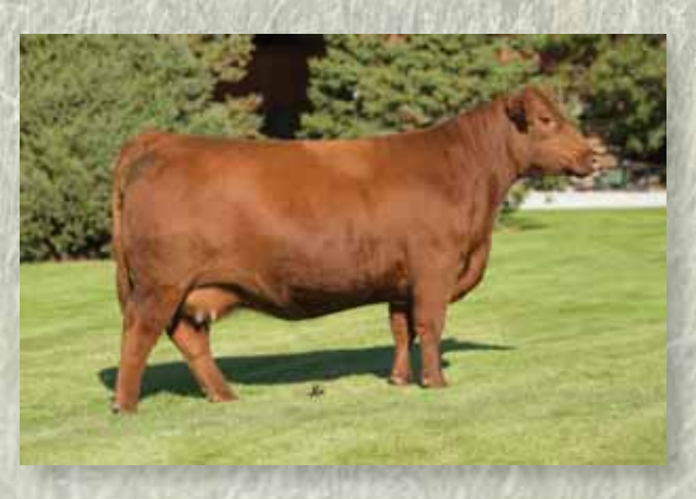
DAM LOTS 7, 18, 19 & 20 WR MS HOLLY 3042

Here's a full brother to lot 8, J6 Centerpiece 109H. '300H' has a remarkable growth spread, a birthweight EPD of 0.6 to a +131 year weight EPD, along with an ADG EPD of +131 top 1% of the Red Angus breed. '300H' has the eye appeal, and growth, along with an expressive muscle shape that puts pounds on the ground