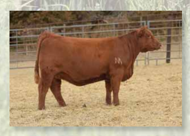
MATERNAL SISTER LOT 8 & 9

Another super complete son of the J6 herd changer WEBR Maxed Out 627. '103H' is a meat wagon with added rib shape and muscle.