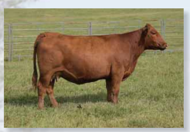
DAM LOT 17 RED SIXMILE DIAMOND MAY 324C