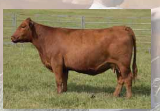
DAM LOT 35 RED SIXMILE DIAMOND MAY 324C