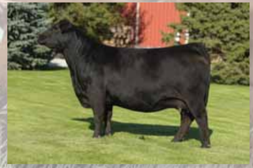
DAM LOT 36 AUTO DANA 265D ET