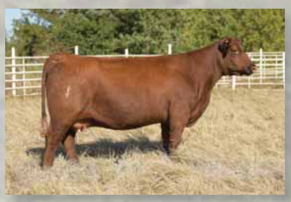
DAM LOT 12 RED SERENITY PATTY CU 1010Y