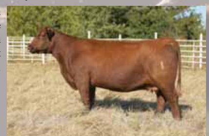
DAM LOTS 24, 25 & 28 RED SERENITY PATTY CU 1010Y

This son of Red Wildman Cimarron 605D will produce offspring that will excel on grass along with converting it to pounds and do it efficiently. Consistent genetics.