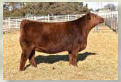
MATERNAL SISTER to Lot 6