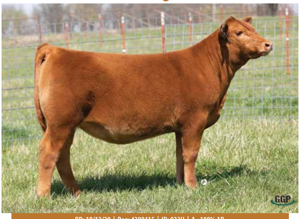
BD: 10/12/20 | Reg: 4388415 | ID: 033H | A - 100% AR

RED RINGSTEAD KARGO 215U Sire TWG TANGO 156D DAMAR THORA Y156