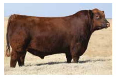
MANN Red Box - Paternal Brother to Lot 6

Her mother is not the youngest, but one of our best. We bred to her to SLGN Wide Load, in hopes of getting a brother to Red Box. We got a heifer. Everything happens for a reason!