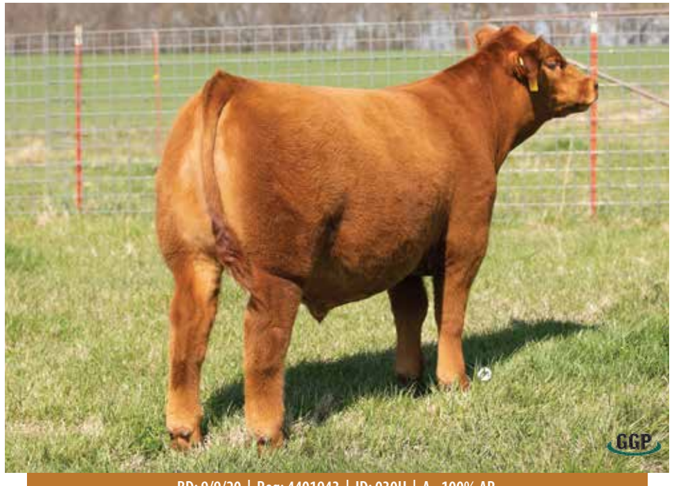
BD: 9/9/20 | Reg: 4401943 | ID: 030H | A - 100% AR

SILVEIRAS MISSION NEXUS 1378 Sire DAMAR NEXT D852