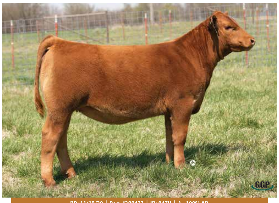
BD: 11/18/20 | Reg: 4388423 | ID: 047H | A - 100% AR

PZC TMAS FIRESTORM 1800 ET Sire JCL ICE STORM 805F RED LAZY MC LORIN 168D