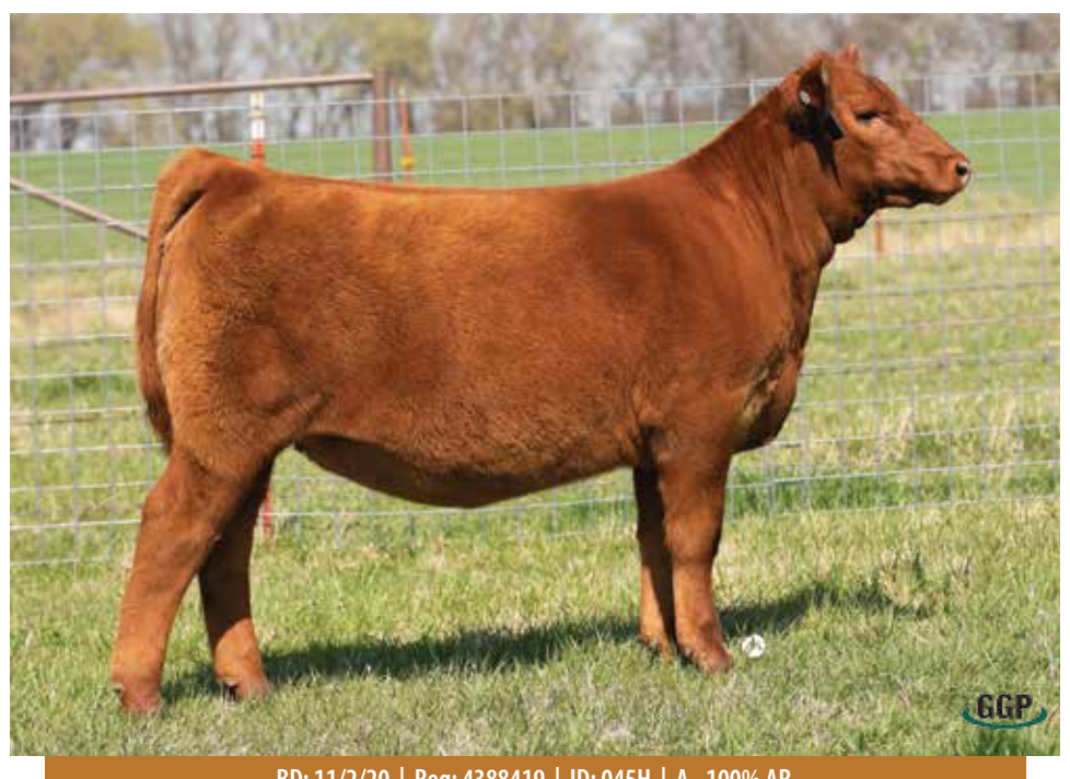
BD: 11/2/20 | Reg: 4388419 | ID: 045H | A - 100% AR

PZCTMAS FIRESTORM 1800 ET Sire JCL ICE STORM 805F RED LAZY MC LORIN 168D