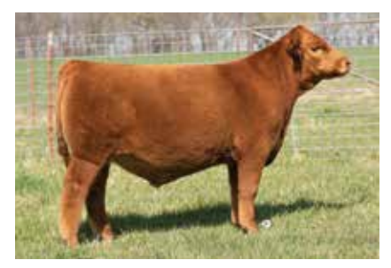
JCL Steer - Lot 12

Parent/Grandparent note: This little guy is a sweetheart. He loves to combed, led and played with. He sets up for a youngster as well as for an older person.