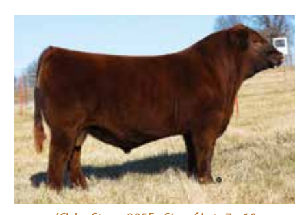
JCL Ice Storm 805F - Sire of Lots 7 - 10

Her mother is 3. Her mother enters our donor program this summer.