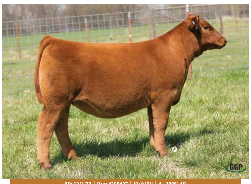
BD: 12/4/20 | Reg: 4388427 | ID: 049H | A - 100% AR

PZC TMAS FIRESTORM 1800 ET Sire JCL ICE STORM 805F RED LAZY MC LORIN 168D