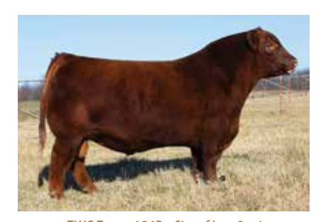
TWG Tango 156D - Sire of Lots 2 - 4

Co-owned with Willow Springs Cattle Company