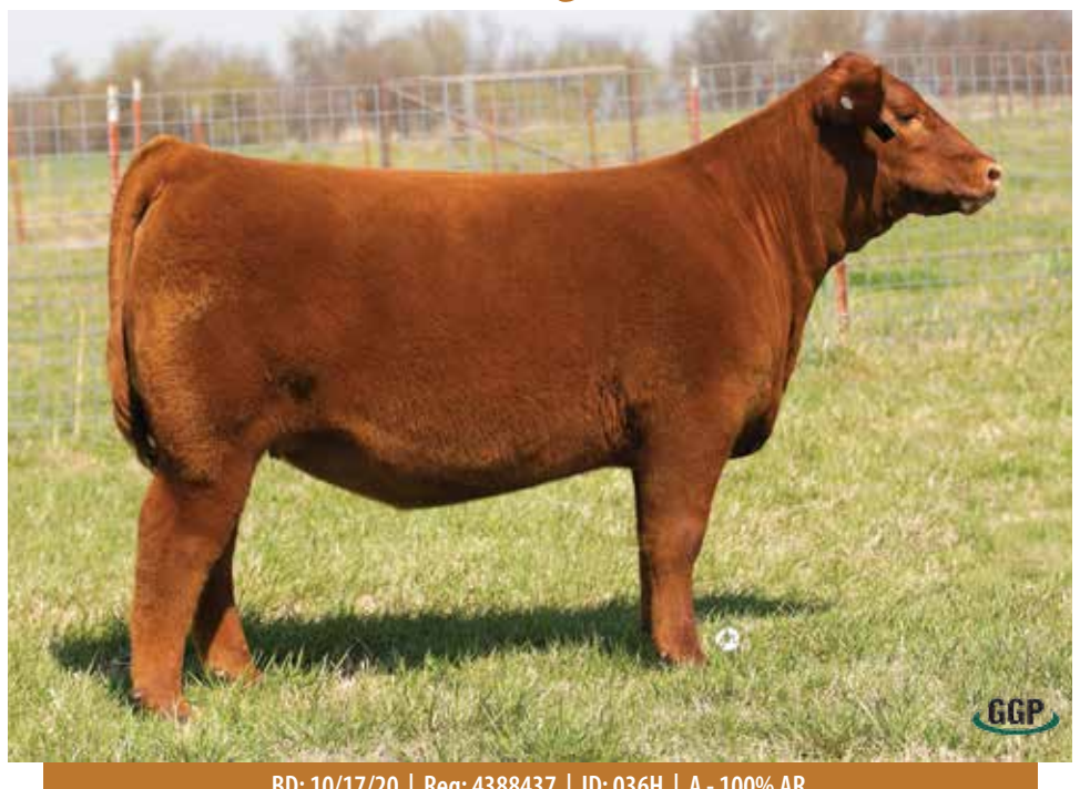
BD: 10/17/20 | Reg: 4388437 | ID: 036H | A - 100% AR

RED RINGSTEAD KARGO 215U Sire TWG TANGO 156D DAMAR THORA Y156