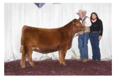
JCL Molly - Full Sister to Lots 2 & 3 2021 Cattlemen's Congress Division Champion

Selling ½ interest with the option to double your bid, and buy 100%