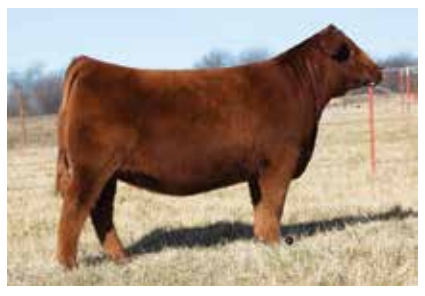
PL Miss November 769E Dam of Lot 5

JCL retains ½ breeding interest (details available from JCL).