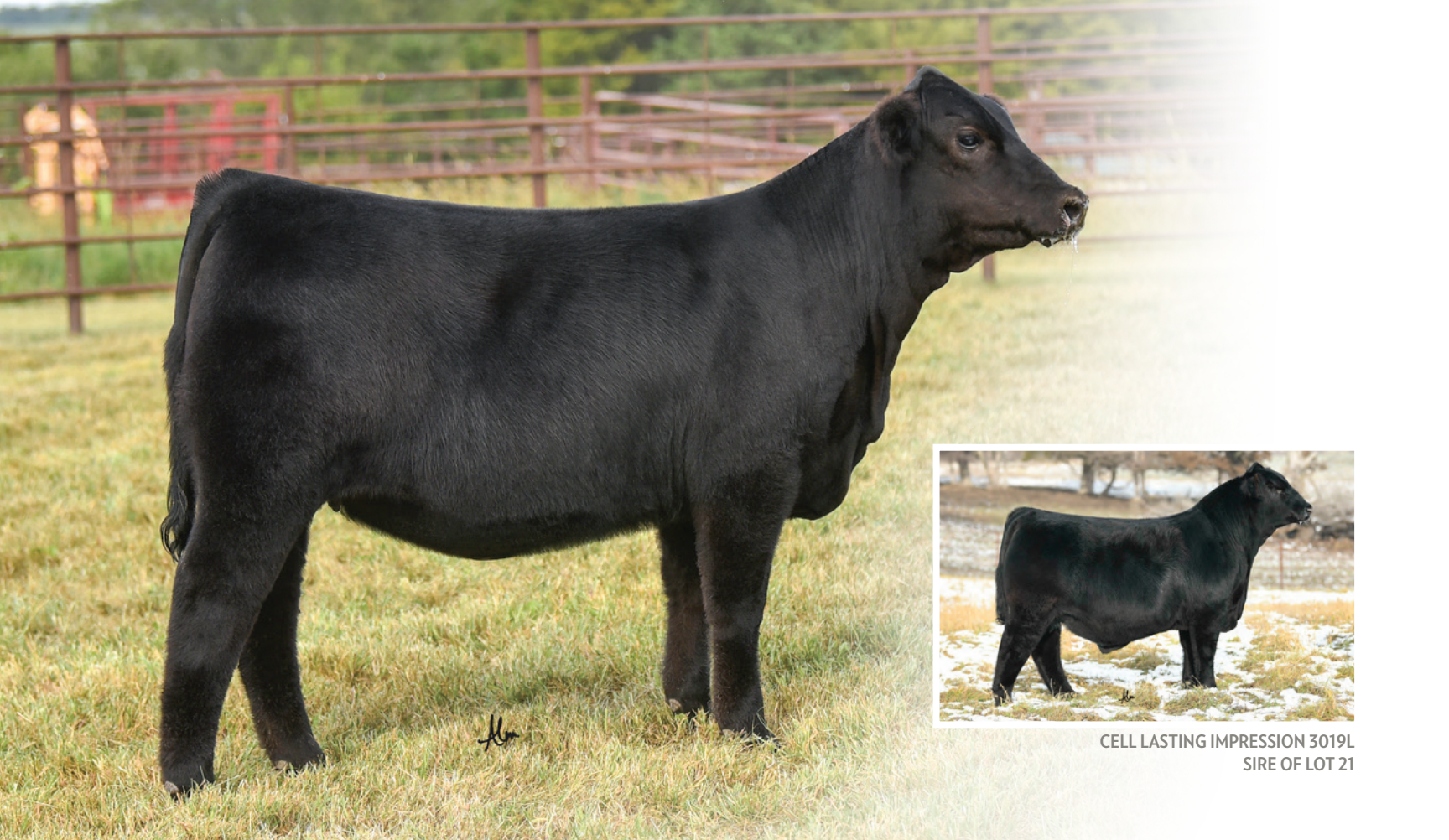
CELL LASTING IMPRESSION 3019L SIRE OF LOT 21