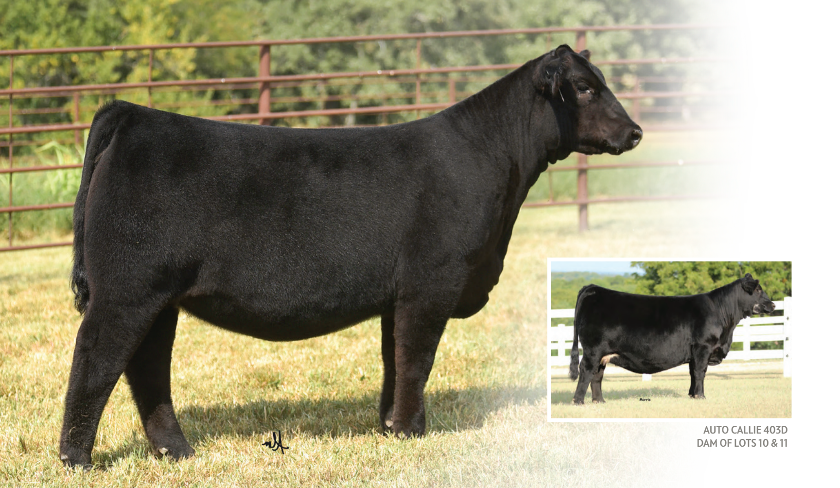
AUTO CALLIE 403D DAM OF LOTS 10 & 11