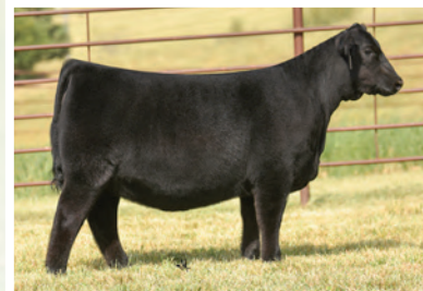
LOT 2 CARDI DAUGHTER SELLING