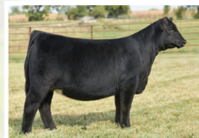
LOT 1 CARDI DAUGHTER SELLING