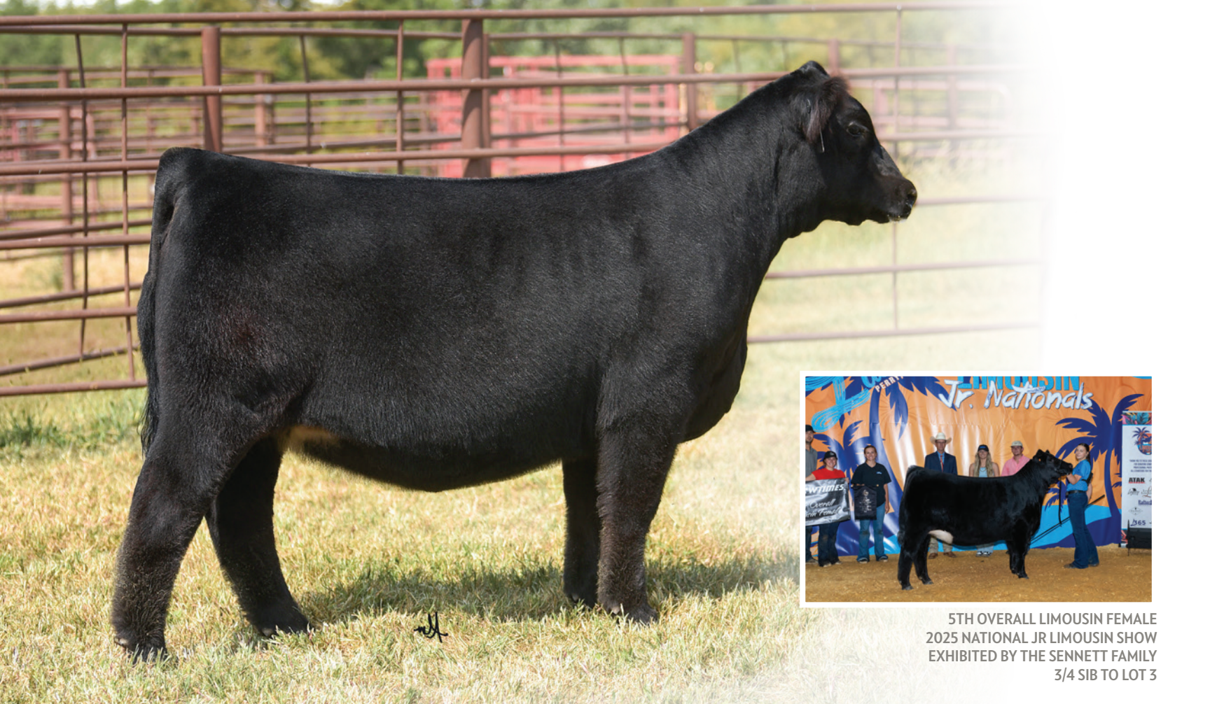
5TH OVERALL LIMOUSIN FEMALE 2025 NATIONAL JR LIMOUSIN SHOW EXHIBITED BY THE SENNETT FAMILY 3/4 SIB TO LOT 3