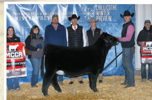
5TH OVERALL FEMALE 2023 CHILLICOTHE WINTER PREVIEW FULL SIB TO LOTS 25 & 27