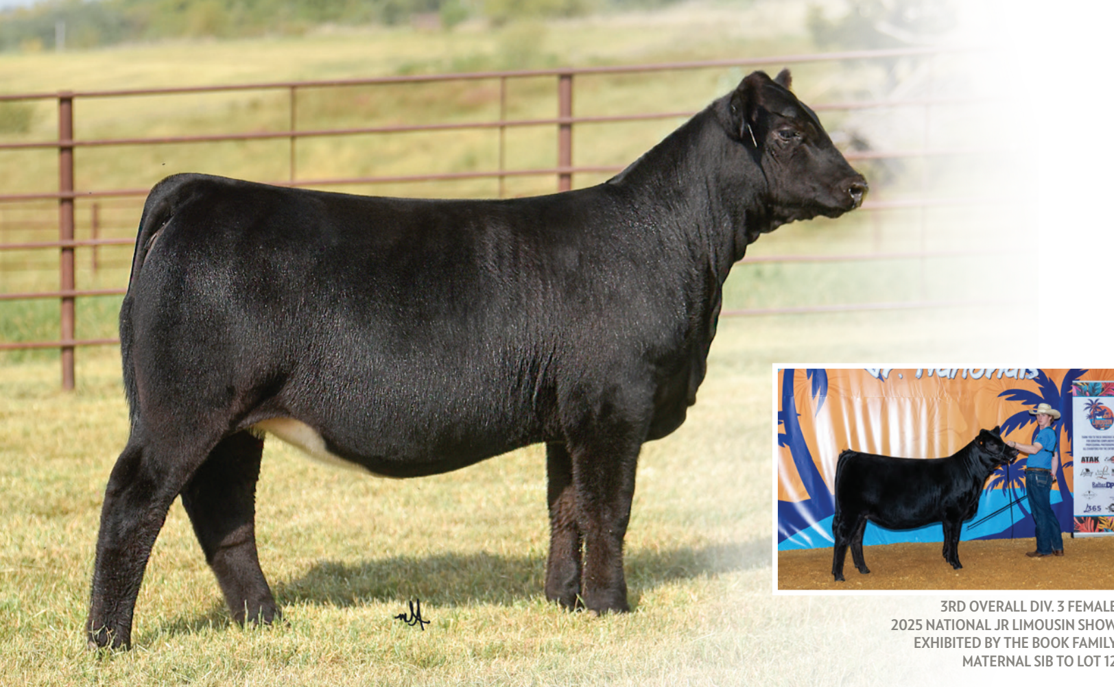
3RD OVERALL DIV. 3 FEMALE 2025 NATIONAL JR LIMOUSIN SHOW EXHIBITED BY THE BOOK FAMILY MATERNAL SIB TO LOT 12