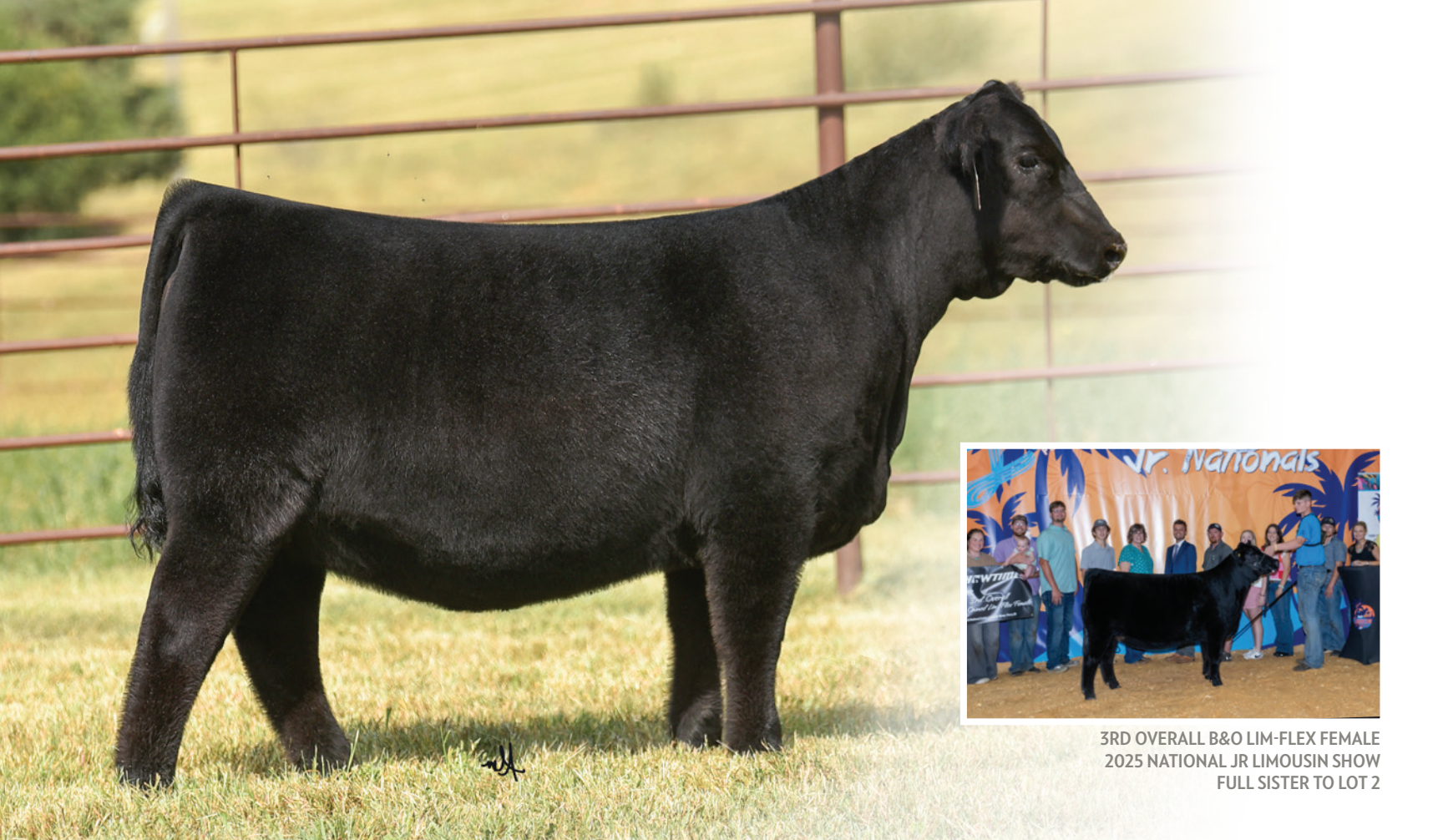
3RD OVERALL B&O LIM-FLEX FEMALE 2025 NATIONAL JR LIMOUSIN SHOW FULL SISTER TO LOT 2