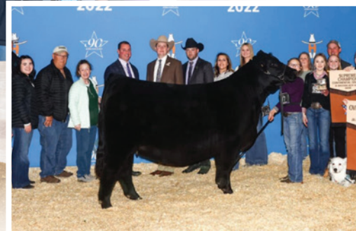
DL HOSANNA 526 GRANDDAM OF LOTS 36A-D