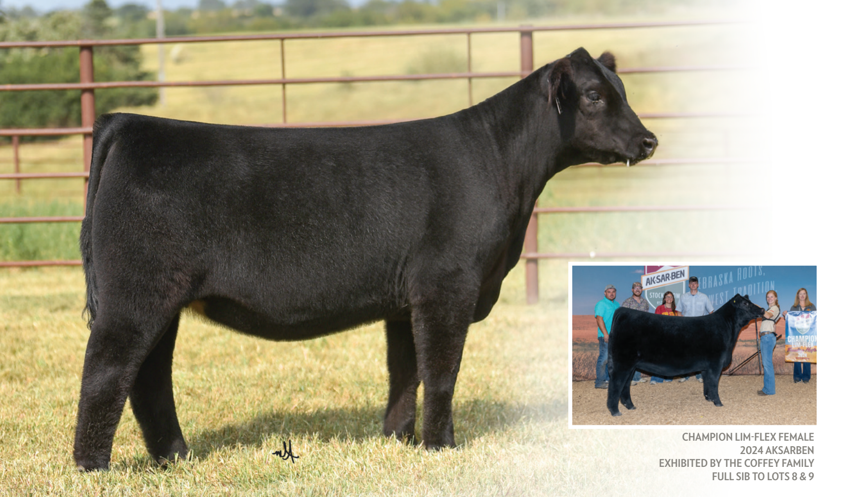
CHAMPION LIM-FLEX FEMALE 2024 AKSARBEN EXHIBITED BY THE COFFEY FAMILY FULL SIB TO LOTS 8 & 9