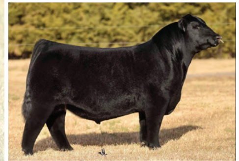
STAG GOOD TIMES 201 SIRE OF LOTS 10 & 11