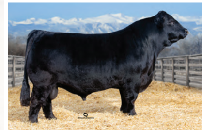
ELCX KINGS LANDING 599D CHOICE SIRE OF LOTS 37A & 37B