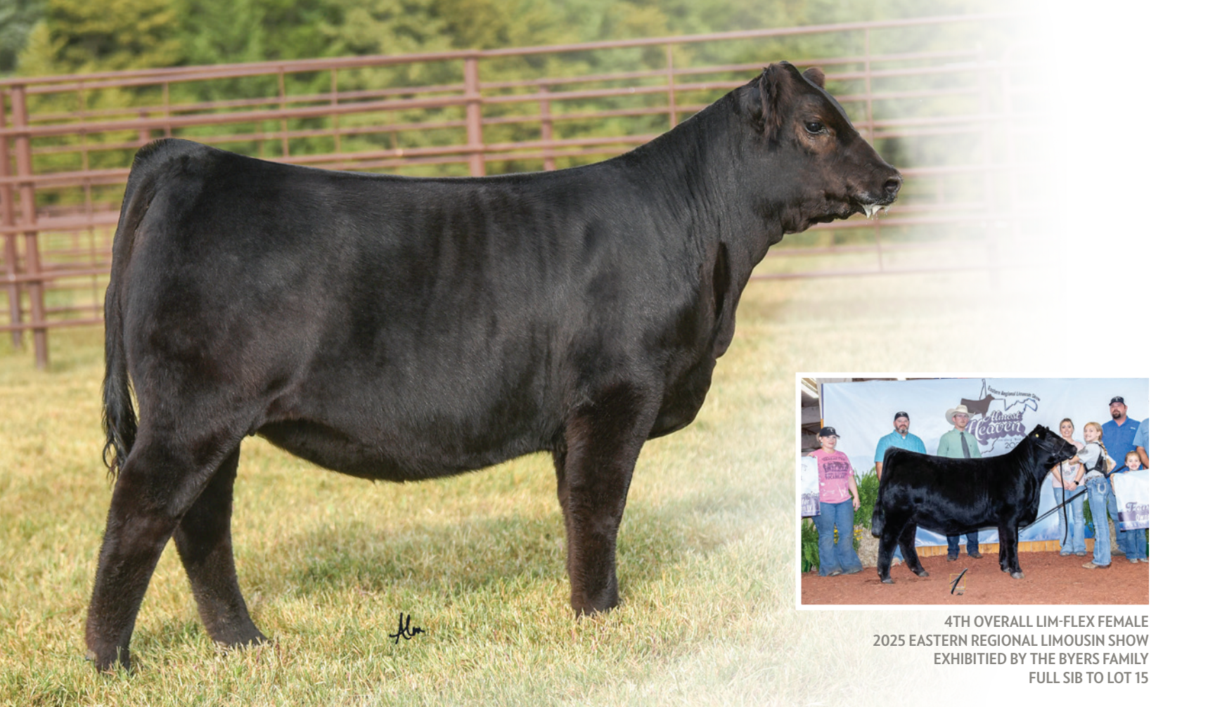
4TH OVERALL LIM-FLEX FEMALE 2025 EASTERN REGIONAL LIMOUSIN SHOW EXHIBITED BY THE BYERS FAMILY FULL SIB TO LOT 15