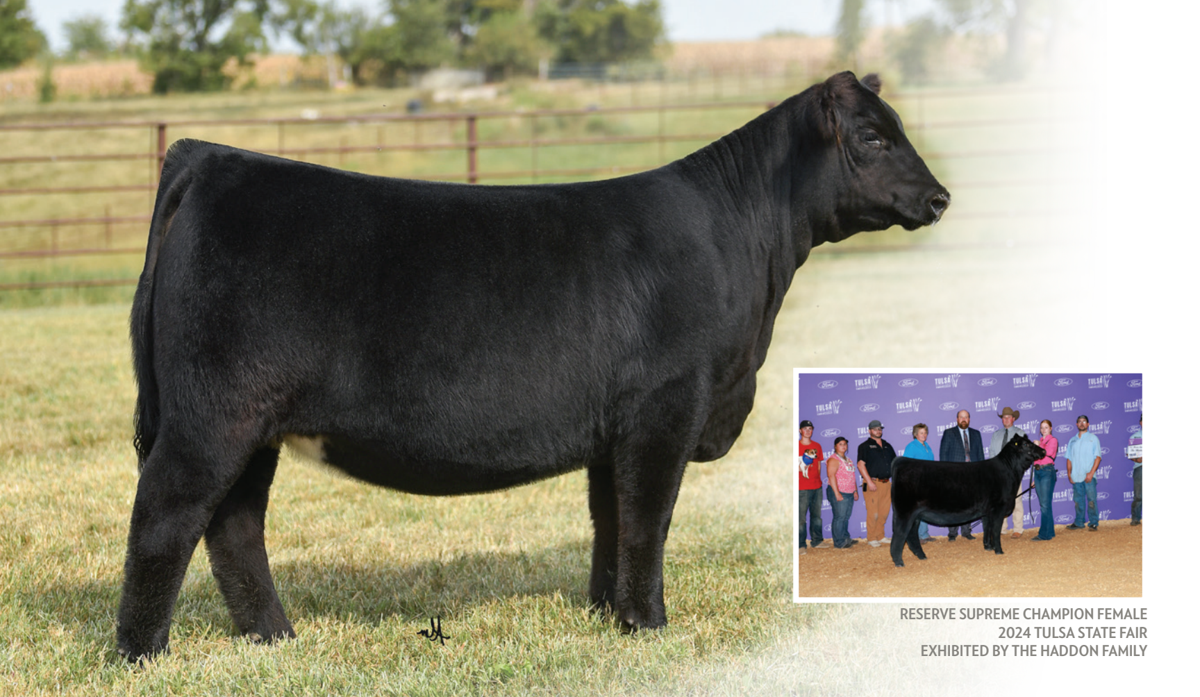
RESERVE SUPREME CHAMPION FEMALE 2024 TULSA STATE FAIR EXHIBITED BY THE HADDON FAMILY