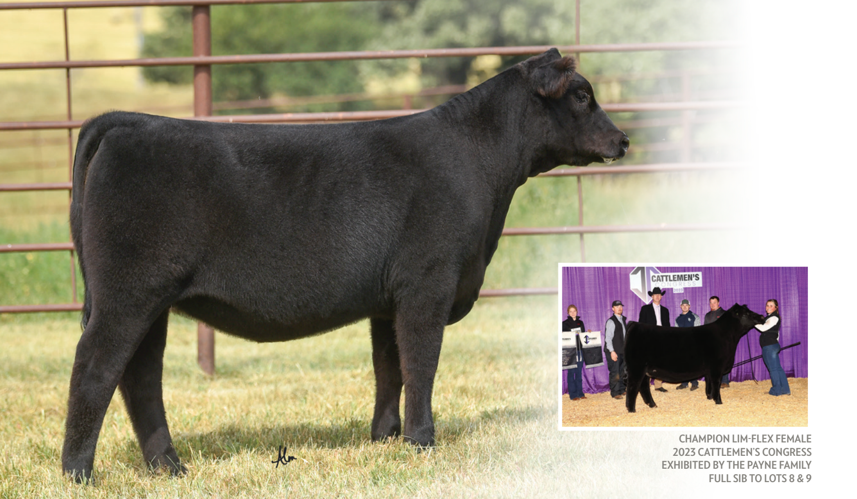
CHAMPION LIM-FLEX FEMALE 2023 CATTLEMEN'S CONGRESS EXHIBITED BY THE PAYNE FAMILY FULL SIB TO LOTS 8 & 9