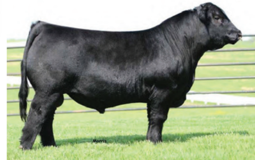
AUTO LUCKY GUY 140D SIRE OF LOT 39A EMBRYOS