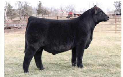
CELL KEYSTONE 2221K SIRE OF LOT 38B