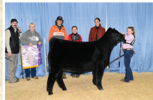
RESERVE GRAND LIMOUSIN FEMALE 2025 NATIONAL WESTERN EXHIBITED BY THE WILKINS FAMILY MATERNAL SIB TO LOT 13