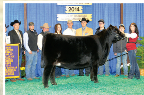
LLJB ABSOLUTE STYLE 3056A DAM OF LOT 14