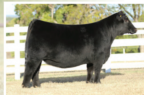
CELL LEGACY CHARM OWNED BY THE MORRIS FAMILY FULL SIB TO LOT 7