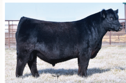
PVF DLX KING PIN 0058 CHOICE SIRE OF LOTS 37A & 37B