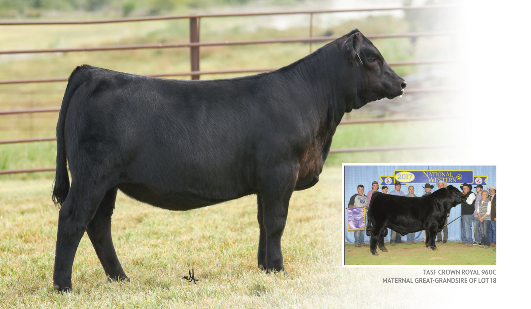
TASF CROWN ROYAL 960C MATERNAL GREAT-GRANDSIRE OF LOT 18