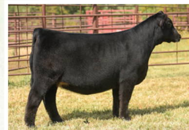
LOT 3 CARDI DAUGHTER SELLING