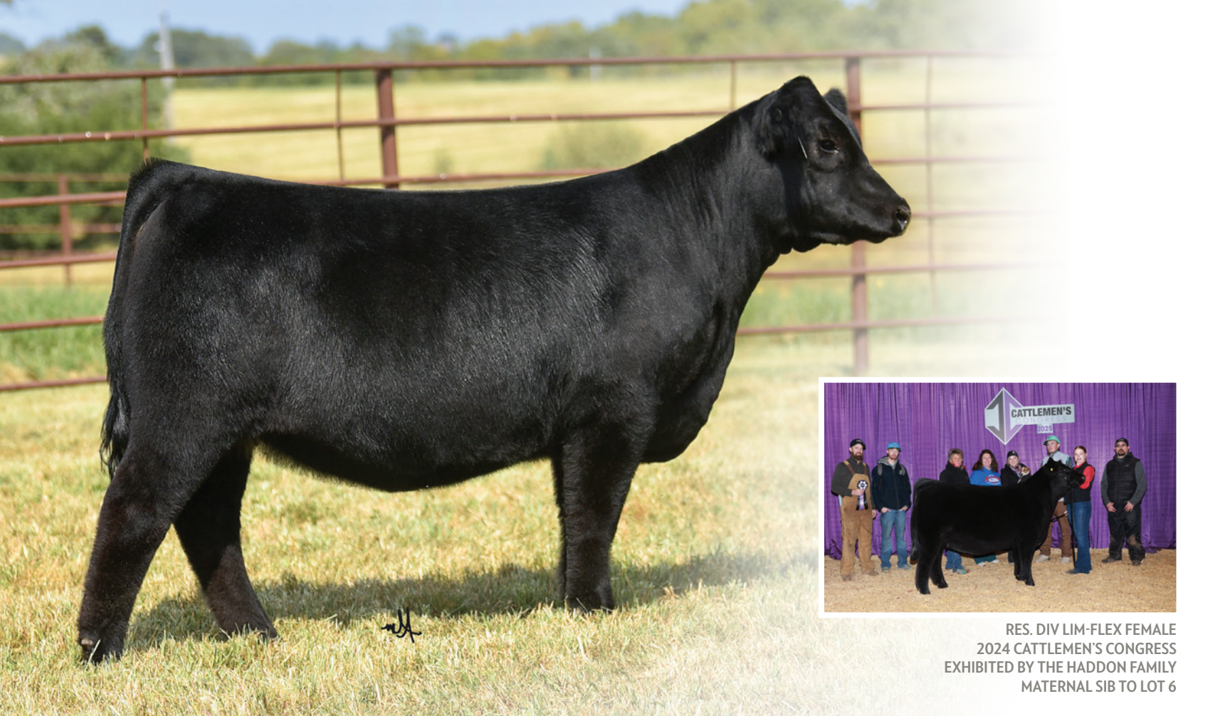
RES. DIV LIM-FLEX FEMALE 2024 CATTLEMEN'S CONGRESS EXHIBITED BY THE HADDON FAMILY MATERNAL SIB TO LOT 6