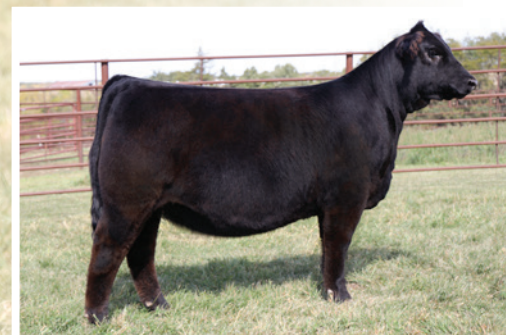
CELL KOOL 2043K DAM OF LOT 24