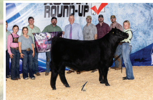
3RD OVERALL CHAMPION FEMALE 2024 AJCA ROUNDUP EXHIBITED BY THE FRANKLIN FAMILY MATERNAL SIB TO LOT 4