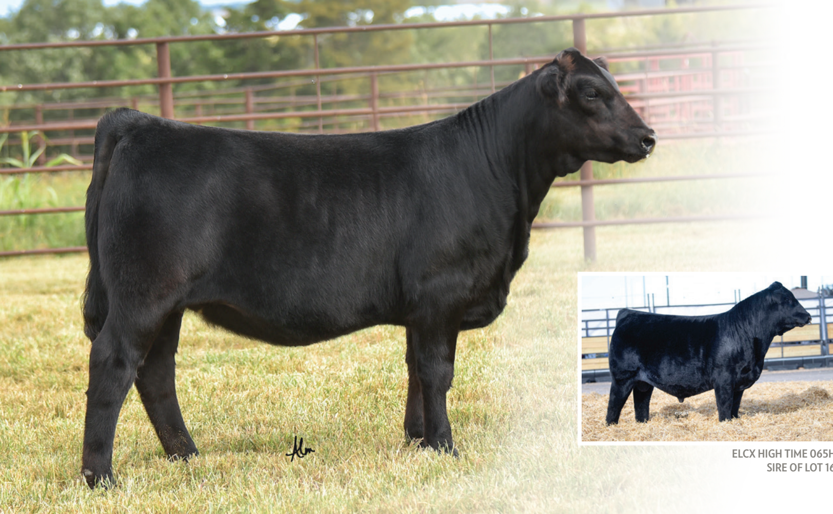
ELCX HIGH TIME 065H SIRE OF LOT 16