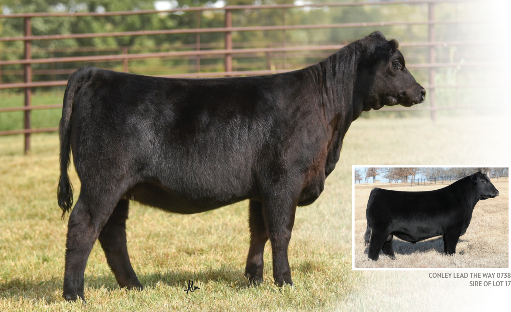
CONLEY LEAD THE WAY 0738 SIRE OF LOT 17