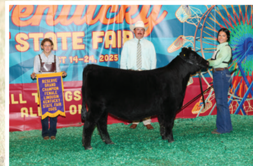
RESERVE LIM-FLEX FEMALE 2025 KENTUCKY STATE FAIR EXHIBITED BY THE PORTWOOD FAMILY MATERNAL SIB TO LOT 5