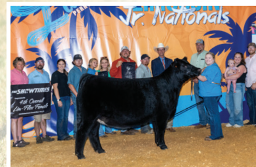
CELL MIA 4019M ET 4TH OVERALL CHAMPION LIM-FLEX FEMALE 2025 NATIONAL JR LIMOUSIN SHOW EXHIBITED BY THE TURNER FAMILY & WHITTINGTON CATTLE CO, FL FULL SISTER TO LOT 34