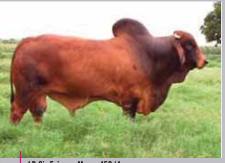
LB Sir Fairway Manso 156/4