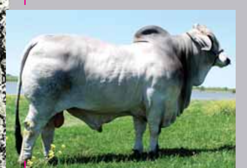
TTT Mr Suva Martin 363

HK Magnetic 630 is a deep-bodied, dark pigmented bull with lots of capacity. He combines thickness, mass, volume and balance on a set of structurally correct and heavy-boned feet and legs. 630 also has a pedigree second to none with legends of the breed such as HK Blue Blood and +HK Mr. America and twice listed +HK Passport 777.