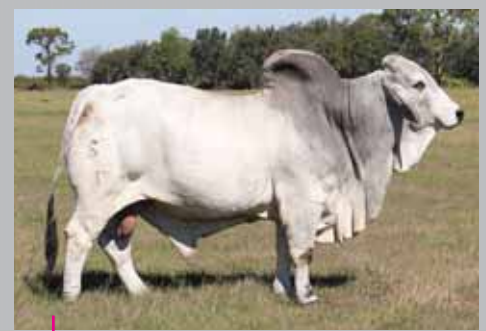
Mr Slugger 12/7