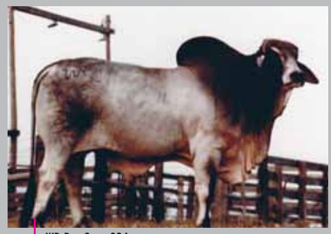
WR Rex Suva 204