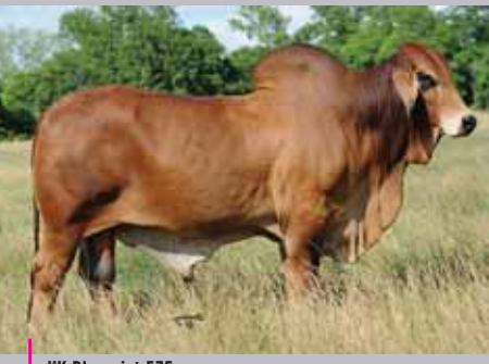
HK Blueprint 575

With genetics from both the V8 and Manso lines, Bennett Farms meant business when breeding Mr. KC Justice Manso. A long bodied straight lined bull, 847/5 will certainly add size, performance and profit to any herd. Make this bull an asset to your herd by investing in these units. No restrictions and AI certificates available from the consignor.