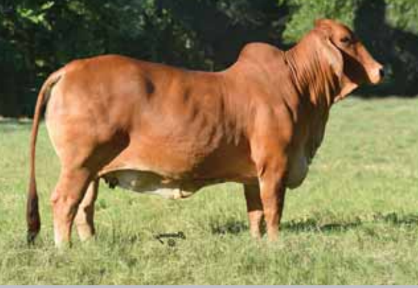
VL Rojo Apache 1/50