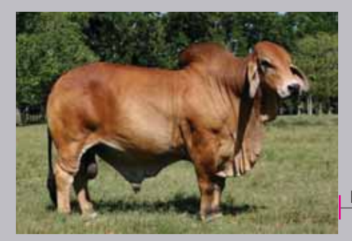
HK Magnate 607