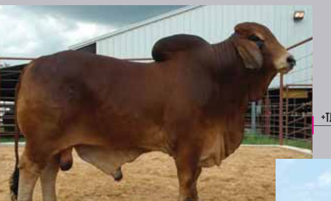
+TJF Mr. Smokin Gun