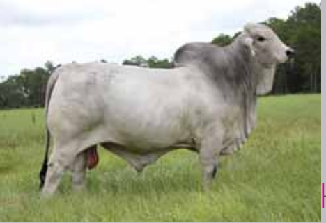
Mr B-F 255/1