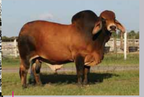
HK Polo 757 (P)

the status quo. He is a sire that produces as well as he looks and is a compliment to the effort of all the breeders that use him. Use Magnate with confidence that he was bred to be a herd sire.