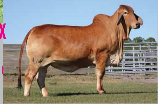
Moreno Ms Lady Elsa 814