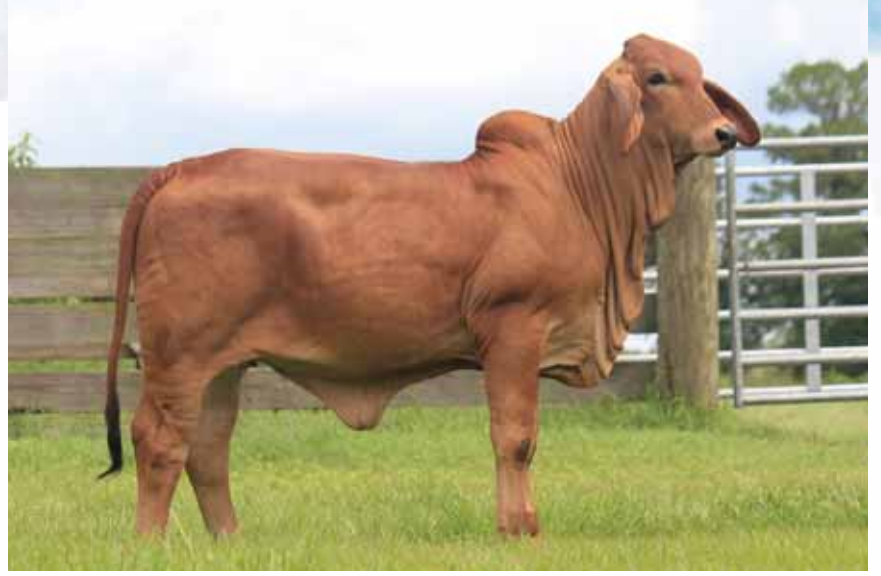
{ LOT 4 Moreno Ms. Lady Rebella 118/1 }

What a dream come true! We have been so anxious to see and experience the results of this much anticipated mating