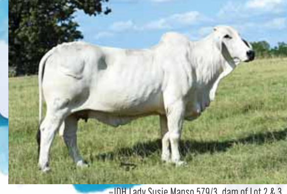
=JDH Lady Susie Manso 579/3, dam of Lot 2 & 3.