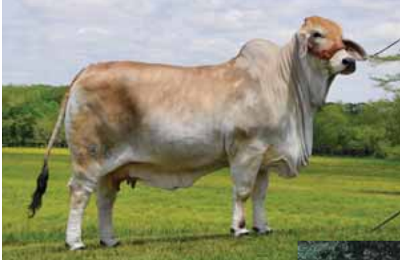
JDH Lady Babette Manso 486/4, dam of Lot 8.