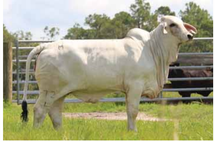
{ LOT 2 Moreno Ms. Lady Sparky 72/1 }