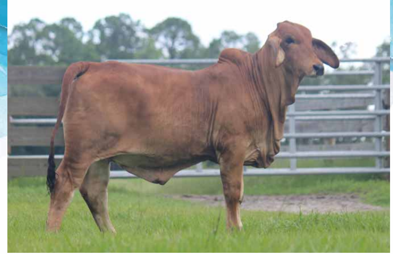
{ LOT 9 Moreno Ms. Lady Rabona 106/1 }