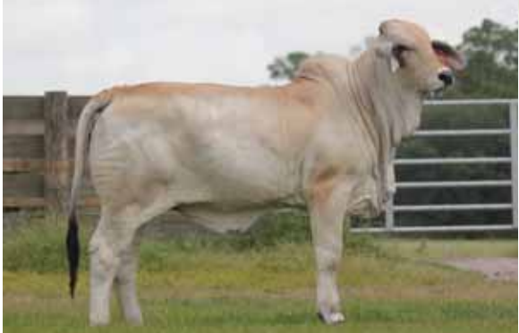
{ LOT 1 Moreno Ms. Lady Salsera 32/1 }