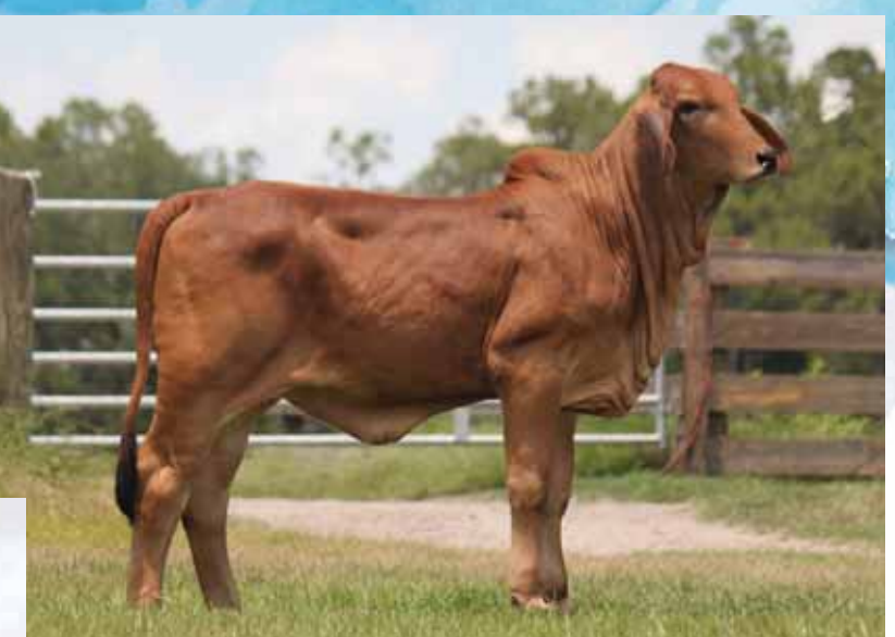
{ LOT 28 Moreno Ms. Lady Raizel 102/1 }