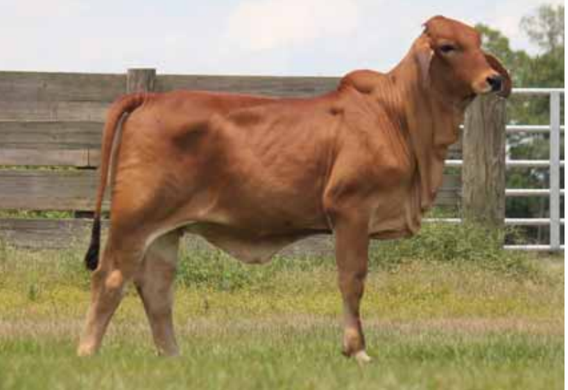
{ LOT 30 Moreno Ms. Lady Robyn 128/1 }