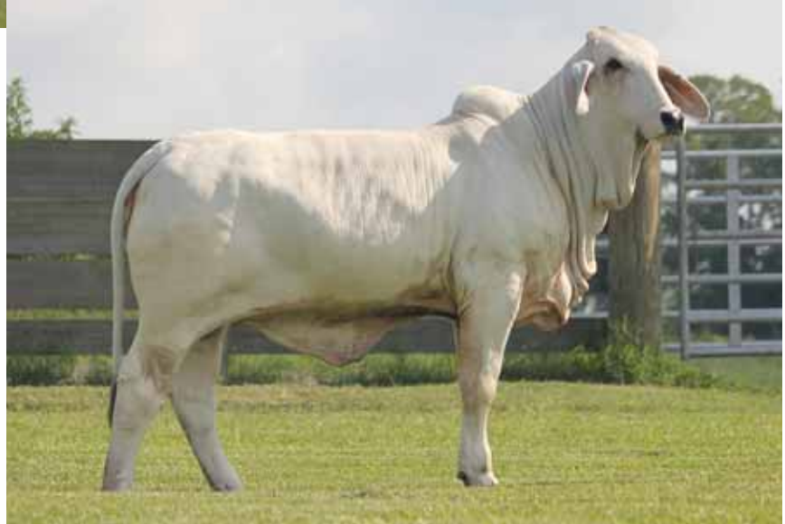
{ LOT 26 Moreno Ms. Rally Girl 146/1 }