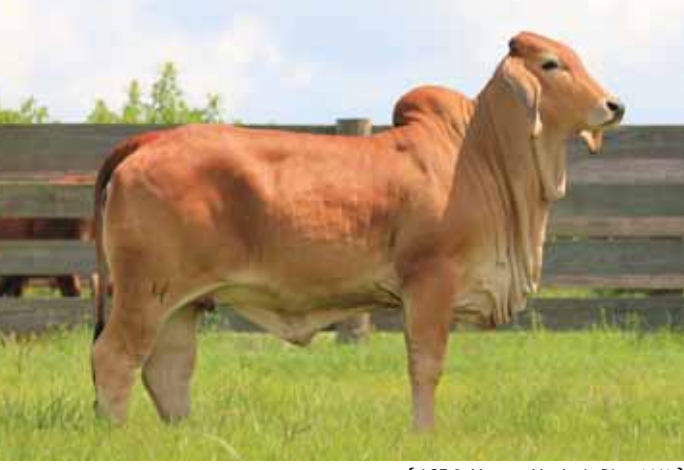
{ LOT 6 Moreno Ms. Lady Rina 14/1 }