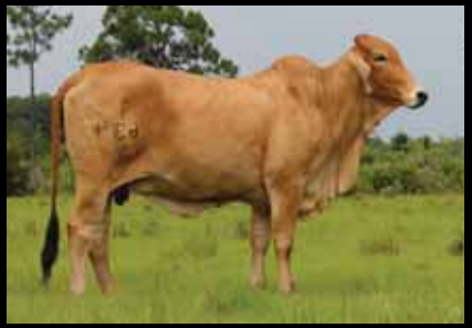
Miss MK 7/634