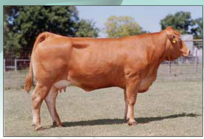
Laura's Accent 857C, dam of Lot 28 embryos.