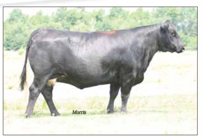
MAGS Satchel, dam of Lot 18.