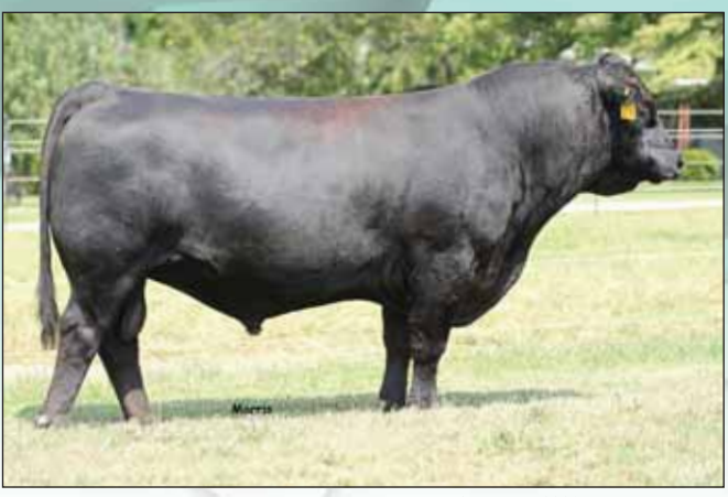
BDHC Ironman 2006Z, sire of Lot 17A.