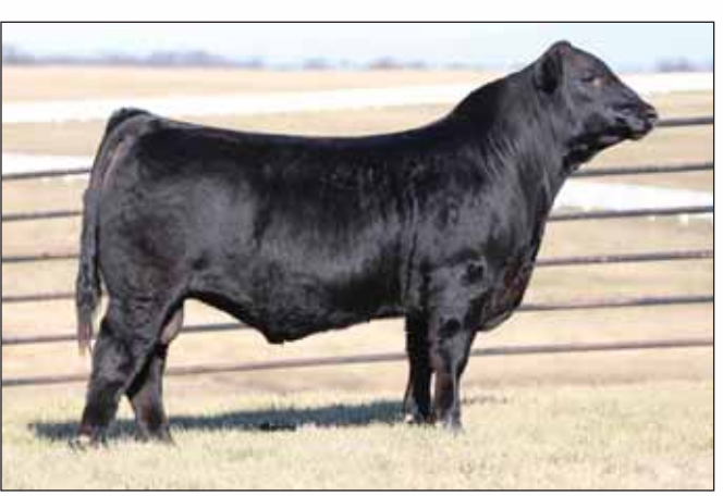
AUTO Transmission, a full sb to Lot 27 embryos.

Consigned by Riverside Valley Farm, Hohenwald, TN