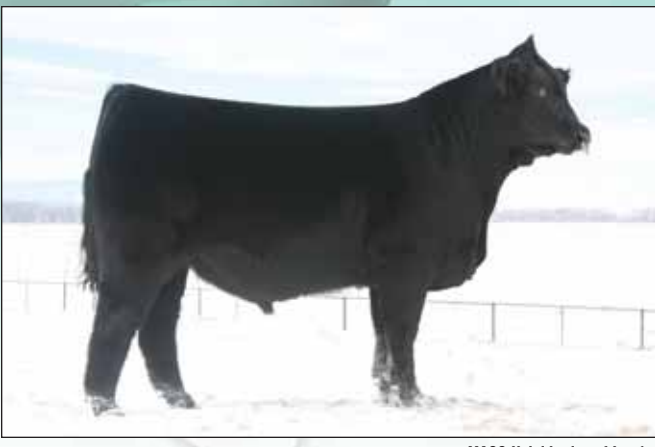
MAGS Xyloid, sire of Lot 1.