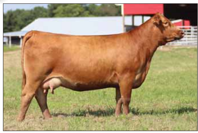
SBLX Zane, dam of Lot 9.