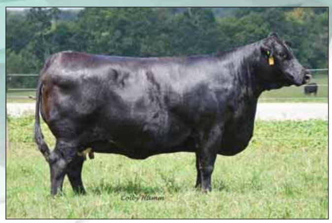
Win Vue Lady Deuce 073X, donor dam of Lot 25.

Consigned by Riverside Valley Farm, Hohenwald, TN