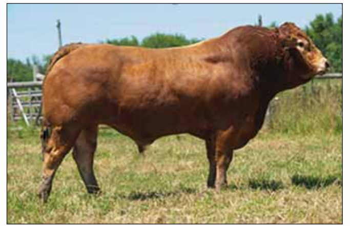
Posthaven Polled Yellowstone, sire of Lot 13.

Consigned by Owen Cattle Company, Hornbeak, TN