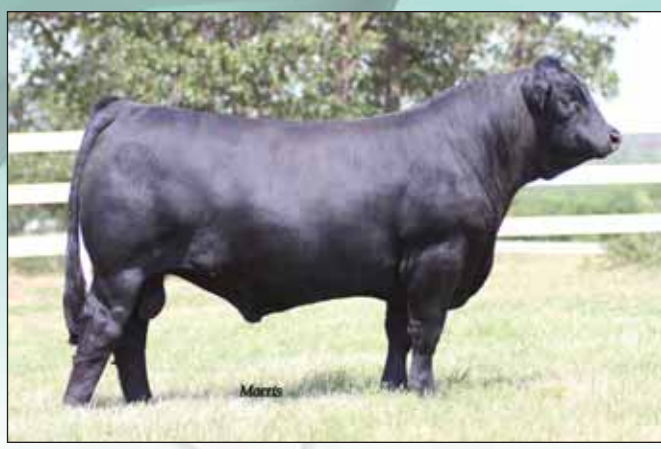
MAGS Zamindar, sire of Lot 11.