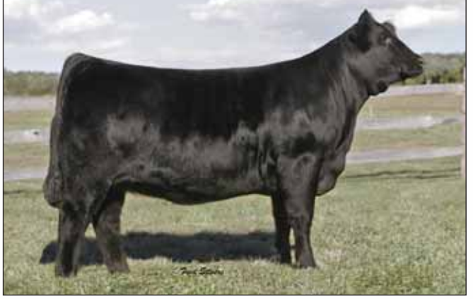
MAGS Wallpaper, dam of Lot 30.

Consigned by ACH Holdings, LCC, Bowling Green, KY