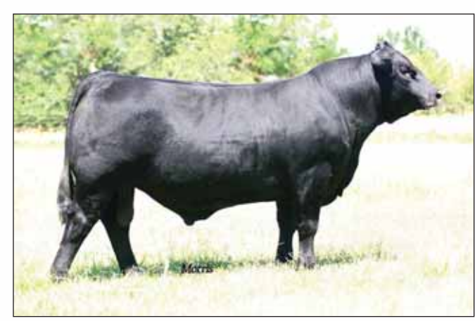
EBFL Ypsilanti 420Y, sire of Lot 16.