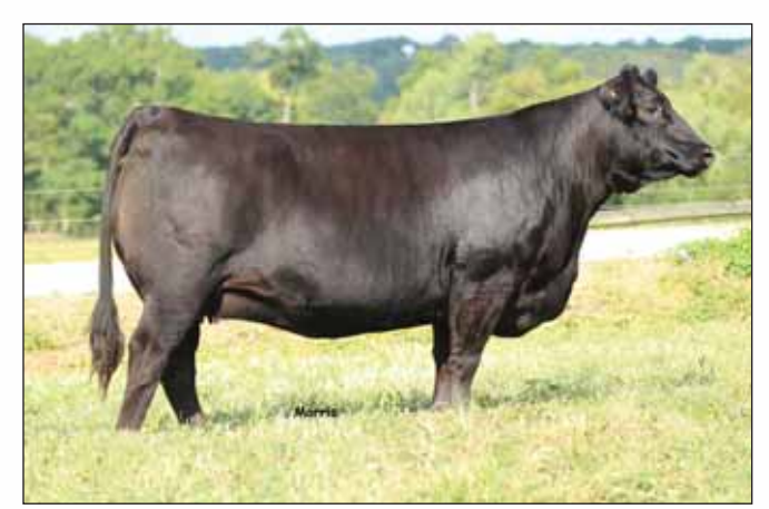
SBLX Maria 662Y, donor dam of Lot 26.

Consigned by Riverside Valley Farm, Hohenwald, TN