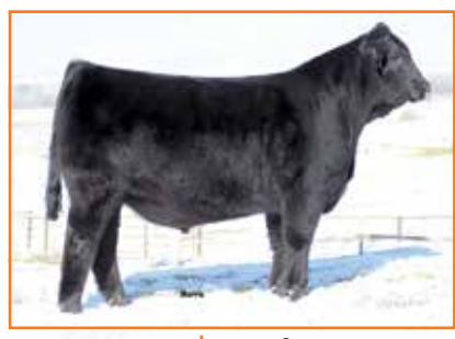
MAGS AVIATOR | Sire of Lots 18A & 18B