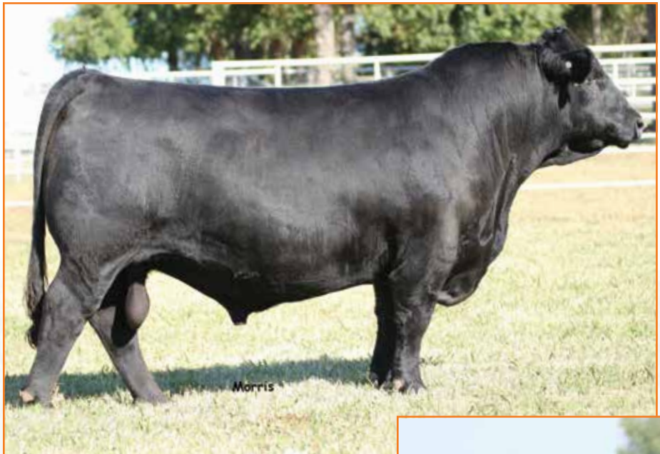
PBRS BUNK HOUSE 48B | Sire of Lot 9