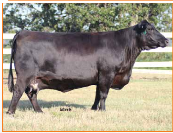
FLLR TIGER LILY | Dam of Lot 19

This 42% Lim-Flex homozygous polled and homozygous black daughter of MAGS Aviator is one top replacement female. She has surfaced as one of the leading replacement females and they felt it necessary to showcase her in the 11th annual sale. She is from one of the P Bar S Ranch foundation donors, FLLR Tiger Lilly, a daughter of Mytty In Focus. She is a leading donor that has as much rib shape and capacity as any 50% Limousin you can find. This female ranks in the top 1% of the breed for gestation, top 2% for marbling, top 4% for $MTI, top 10% for calving-ease direct and CEM.