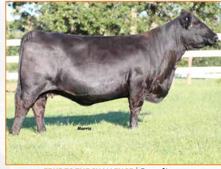
EF UP TO THE CHALLENGE | Dam of Lot 32

Al'd 5.15.18 to RLBH Days Of Thunder (62% Lim-Flex, B/HP) - Safe