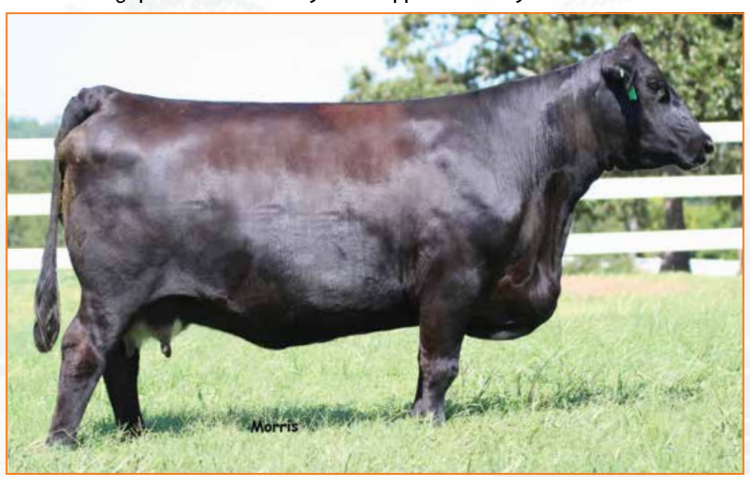
PBRS WINNING WAYS 29W | Dam of Lots 29-31