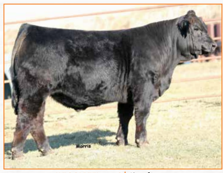
LVLS CARTEL 1023C | Sire of Lot 44

Purebred genetics and predictable genetics at its finest with this replacement heifer. She is a daughter of LVLS Cartel, a high percentage son of EF Zen 344Z that was a top purchase from the long running Lonely Valley Seedstock operation. Her dam is a daughter of the national champion sire DHVO Deuce from MAGS New Games 169N.