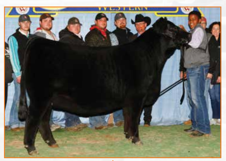
AUTO DANA 265D | Daughter of Lot 10 2017 National Western Junior Limousin Show Grand Champion Lim-Flex Female

LIM-FLEX(50) COW PLD/HOMO BLK (T) 58 50 2.7 85 S A V MANDAN 5664