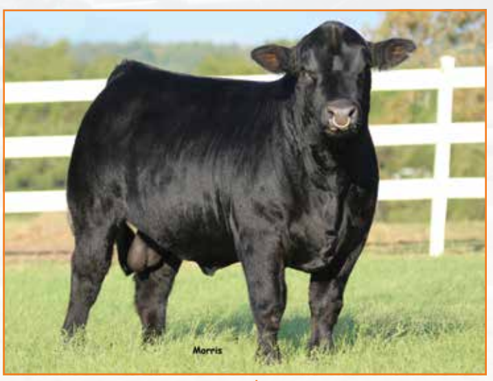
RLBH DAYS OF THUNDER | Service sire of Lots 13-17

When Lim-Flex was created this is exactly what our board members had in mind! This female is absolutely perfect in her design and is one of the finest to ever carry the PBRS prefix. She just happens to be sired by the now deceased but very popular PBRS Bunk House 48B. He is the double homozygous son of MAGS Yip from the purebred Angus donor. LBAF Shawnee 602. She is sired by the elite Angus sire, Twin Valley Precision E161. PBRS 6259 is from PBRS Zandra 294Z, a daughter of the once All-American Futurity supreme champion sire MAGS Xyloid. She sells bred to the black and homozygous polled bull RLBH Days of Thunder, a full brother to RLBH Air Force One.