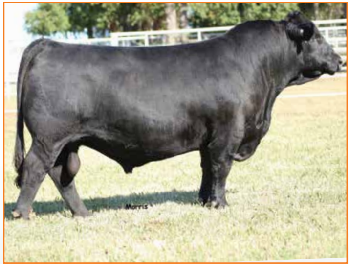
PBRS BUNK HOUSE 48B | Service sire of Lot 37