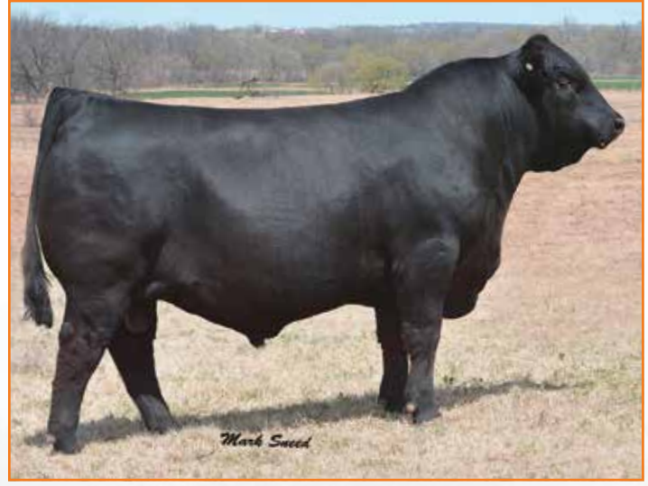
OKSU THE PROFIT 3401 | Sire of Lot 45