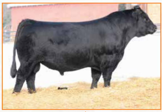
SBLX FIRST CLASS | Sire of Lots 29-36