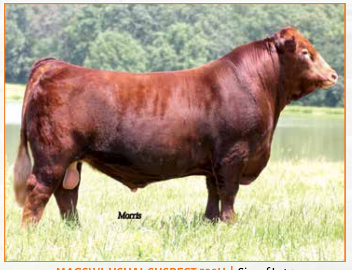
MAGSWL USUAL SUSPECT 538U | Sire of Lot 1

PBRS First Suspect is the result of blending the best Red Angus with the best purebred Limousin. This open heifer is a prime example of exactly why P Bar S Ranch incorporated Red Angus into the mix. They are raising some of the finest purebred Red Angus along with their purebred Limousin, Lim-Flex and Angus cattle. This heifer is sired by the Wies Limousin/Magness Land & Cattle Co. sire MAGSWL Usual Suspect. The Triple Crown winning bull continues to be the go to sire when looking for red, purebred Limousin genetics. He was mated to the purebred Red Angus female, CRSL Champagne, a daughter of Red Northline Jesse James. PBRS First Suspect is awesome from the ground up. She is massive in her foot size, heavy in her bone structure and deep bodied. She is massive in her rib shape and has so much capacity. We certainly love her through her head and neck.