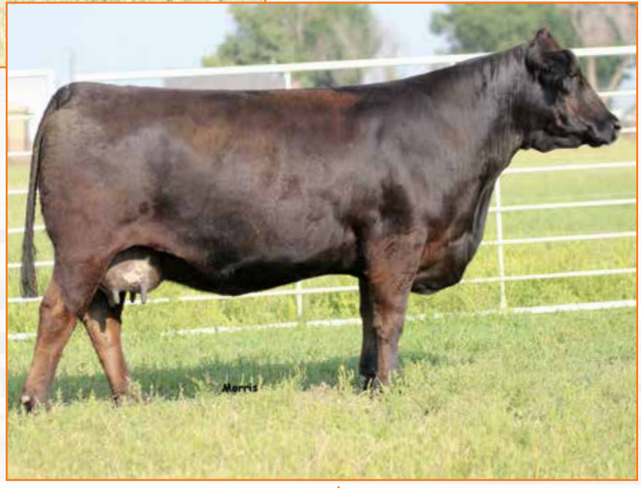
MAGS ZENOVIA | Dam of Lot 9