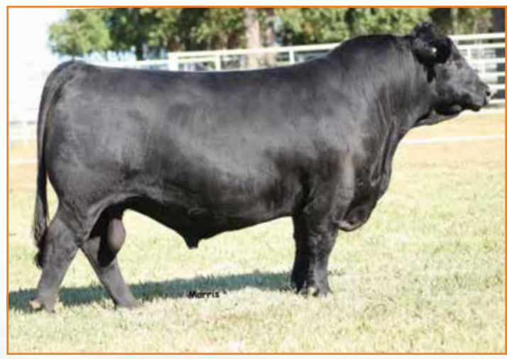
PBRS BUNK HOUSE 48B | Sire of Lot 77

PBRS 7109E is a 50% Lim-Flex son of PBRS Bunk House 48B. He is the leading sire for P Bar S Ranch, Lonely Valley/LV Bar and Stowers Limousin. He is deceased but recognized as one of the top sires in the business. This son of his is from a daughter of EXAR Classen from MAGS Manuela.