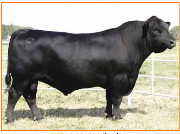
MYTTY IN FOCUS | Sire of Lot 61

This purebred Angus heifer is a daughter of SAV Bruiser, a son of SAV Bismarck and from a daughter of SAV 8180 Traveler 004 back to a daughter of Bon View New Design 1407. This female is very easy on the eye, appealing in her design and moderate in her frame.