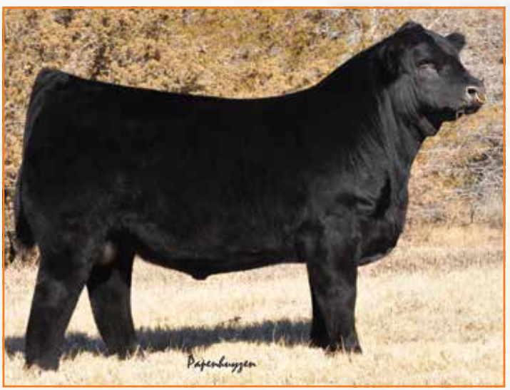
COTTAGE LAKE BORDER AGENT | Sire of Lot 39

Really good cattleman don't care what % females are, they care how good they are and this female is a prime example of that statement. She is a 25% Lim-Flex female and daughter of SAV Brand Name. Her dam is the leading donor, PBRS Wagon Wheel 994W, a daughter of GAR Predestined from the now deceased WLF Rendezvous 050R female. This female has the pedigree and promotion already stacked in her favor.