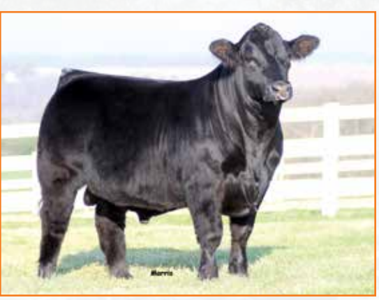
ELCX TURNING POINT | Sire of Lots 21-34