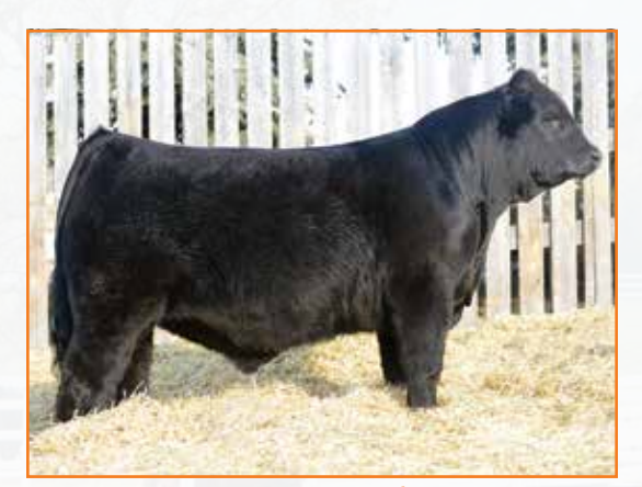
RIVERSTONE CROWN ROYAL | Sire of Lots 25-28

Riverstone Crown Royal is the leading purebred sire for P Bar S Ranch, Riverstone Cattle Co. and Stowers Limousin. He is a son of TMCK Durham Wheat from the Riverstone purebred donor, HSF Your Fantasy. He is a full brother to the all time great purebred show female, Riverstone Charmed. She is the $100,000-valued female that is owned by the Ratliff Family and embryo partnership with Stowers Limousin. The genetics behind this sire is like no other and has tremendous promotion behind it. These Riverstone Crown Royal heifers are from purebred Angus females. The combination of purebred Limousin blended with the best of purebred Angus has worked out well with these heifers.