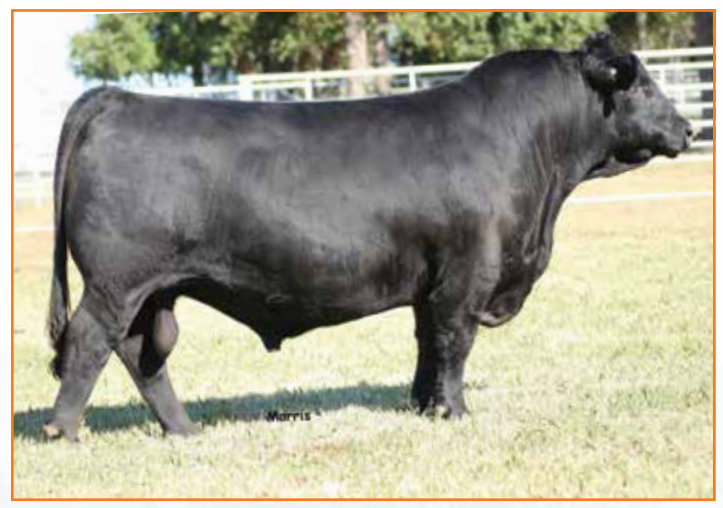
PBRS BUNK HOUSE 48B | Maternal sib to Lot 6