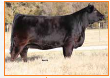
SBLX ZNOTE | Dam of Lots 18A & 18B