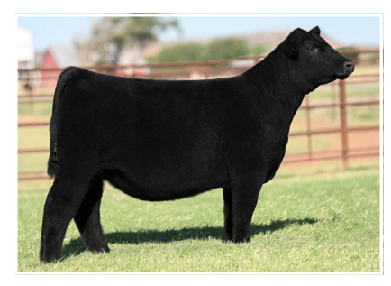
JSUL PCC WHOS LOOKIN 2113K ET $85,000 flush sister to lot 6

Killer look! Lot 6 is flawless in terms of balance and added style. She is big-boned, bold centered and stout hipped. Additionally, she is elegant through her front end and offers just the right amount of white. Her moderate kind will keep her easy to maintain, while her flashy look will garner attention in the ring early and often.