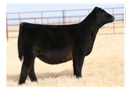
PCC LB SARA'S DREAM 938 $25,000 maternal sister to lot 2

• Lot 2 is a beautiful necked, perfect structured June prospect with an impeccable spine and phenomenal profile and pattern. She is sure to make a run at the top of the summer division at any level of competition and would be perfect for a young showman with her awesome disposition.