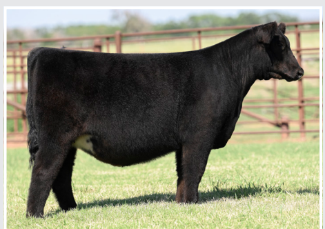
PCC WHO DAT HOTTIE 306K $45,000 Maternal Sister to Lot 21

Selling four sexed female IVF embryos with a guarantee of at least one pregnancy to result if implanted within one year of purchase by a certified embryologist.