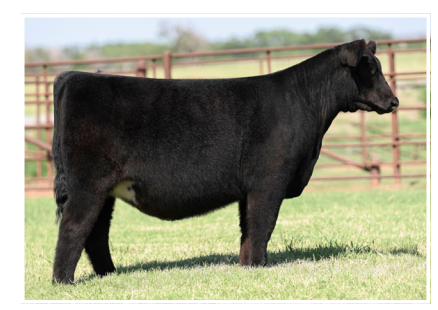
PCC WHD DAT HOTTIE 3D6K $45,000 flush sister to lots 10 and 11

• Lot 10 is striking on the profile with an absolute beautiful outline. She has a long, slender, feminine neck and a beautiful head that is complemented by her impeccable structure and exceptional design.