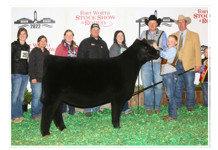
JSUL PCC FETTYS PRIDE 1407J ET 2022 Grand Champion Chi Female Ft Worth. Flush sister to lot 8 and maternal sister to lot 5

Lot 8 is clean jointed, perfect structured, and level hipped being extra smooth out over her tailhead. She has the look the look and presence one would expect from a direct daughter of JSUL Who Dat Fetty 6322D, who is a decorated producer of champions and high sellers including a flush sister to this lot that was named the 2022 Grand Champion Chi Female at Ft Worth and was also a 2022 NJCS Reserve Division Champion, as well as a $36,000 maternal sister and the 2022 OYE Bronze Medallion Heifer. Sells open.