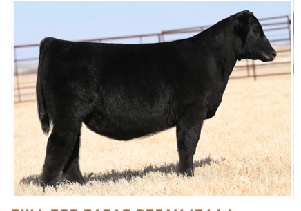
SULL PCC SARAS DREAM 1544J $37,000 flush sister to lot 1 and maternal sister to lot 3