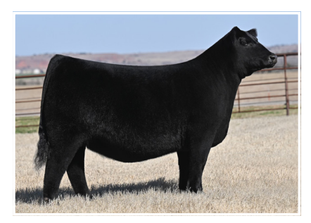
JSUL DAT SHINY DARLIN 9000G "STELLA" Dam of lot 4

• This dual-registered prospect offers added power, bone, and rib shape without sacrificing eye appeal. One of our favorites in this offering.