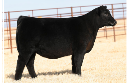
SULL PCC SARAS DREAM 1541J $50,000 flush sister to lot 1 and maternal sister to lot 3