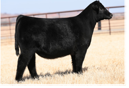
SULL PCC SARAS DREAM 1551J $85,000 flush sister to lot 1 and maternal sister to lot 3