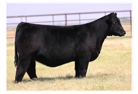
JSUL PCC WHO DAT 3544L ET $16,000 flush sister to lot 12 and maternal sister to lots 7, 9, and 13

• This late March heifer offers an incredible pattern and profile while also being one of the longest spined, most feminine fronted heifers in the offering.