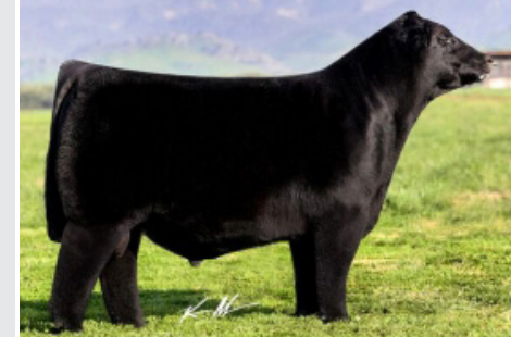
COLBURN PRIMO 5153 Sire of Lot 21