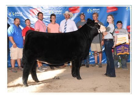
AMERICA 866 Dam of lot 14

• Here's a big boned, stout, good looking Purebred Simmental that is tricked out with all the bells and whistles and holds her own among the best Simmental females we have offered!