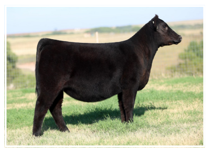
PCC KS SARA 418 $26,500 flush sister to lot 1 and maternal sister to lot 3