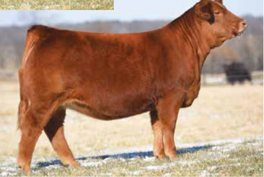
LOT 93 | AUTO EVONE 216E ET