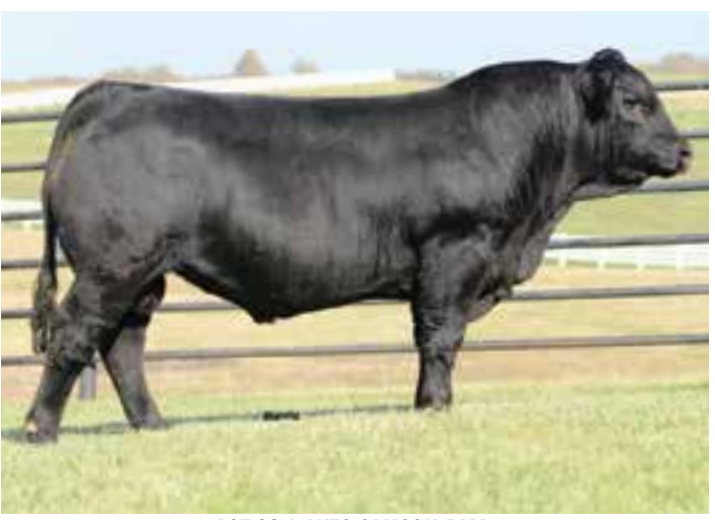
LOT 32 | AUTO SAMSON 561D

Wow, check out the growth on this homozygous black, homozygous polled Lim-Flex bull! There are a lot of pounds of performance to capitalize on in AUTO Samson 561D, with a 77 WW EPD and 113 YW EPD. We are super confident in these numbers and the fact that they are going to transmit to his offspring. 561D's sire, LH Advantage was ultra fast growing and high performing and Samson is following suit with a 1,289 Adj. Yearling Weight and a 786 adj. Weaning Weight. He also scanned a 14.67 inch REA!