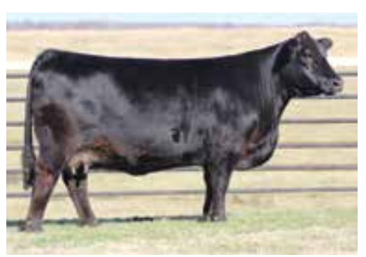
SBLX UMBRELLA 305U | DAM OF LOT 47