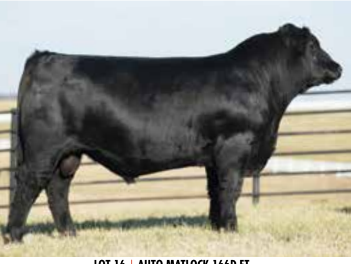
LOT 16 | AUTO MATLOCK 166D ET