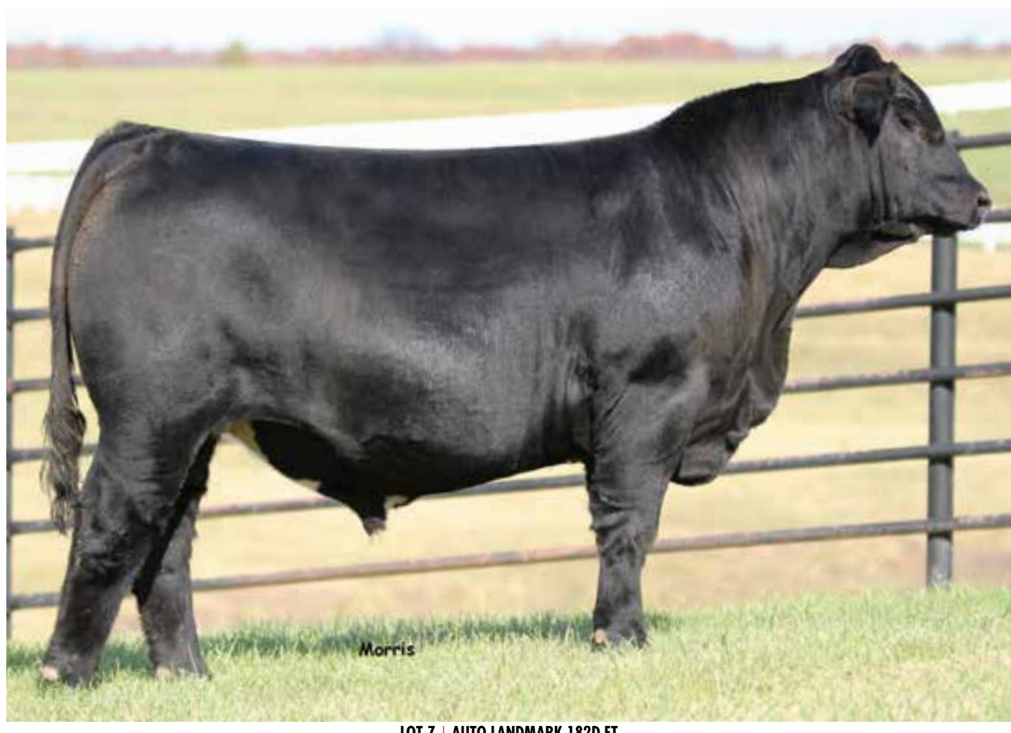
LOT 7 | AUTO LANDMARK 182D ET