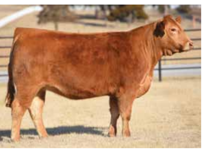
LOT 60 | AUTO DONLITA 237D ET

AUTO CLIFF HANGER 194D FULL SIB TO DAM OF LOTS 57, 58 & 59