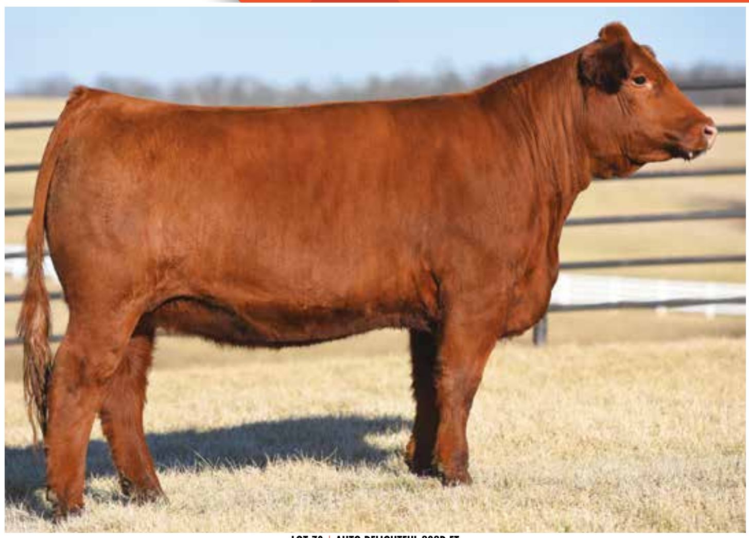
LOT 70 | AUTO DELIGHTFUL 282D ET