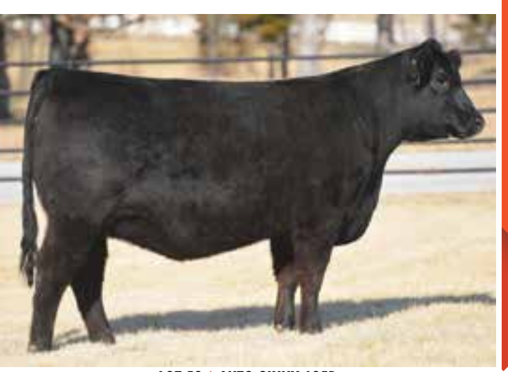
LOT 53 | AUTO GINNY 635D

AUTO Ginny 635D is an AUTO Gunn Point 192Y daughter. Gunn Point is from AUTO Gretchin 818Y, a daughter of the once National Limousin Sale top seller, AUTO American Idol 162L. She is a 75% Lim-Flex homozygous polled, homozygous black female. Her milk EPD ranks in the top 30%. We love the length and width of top she offers, the muscle design and the fleshing ability. She is so deep bodied and has a tremendous amount of natural rib shape.