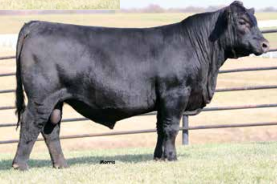
LOT 6 AUTO FIRE 199D ET