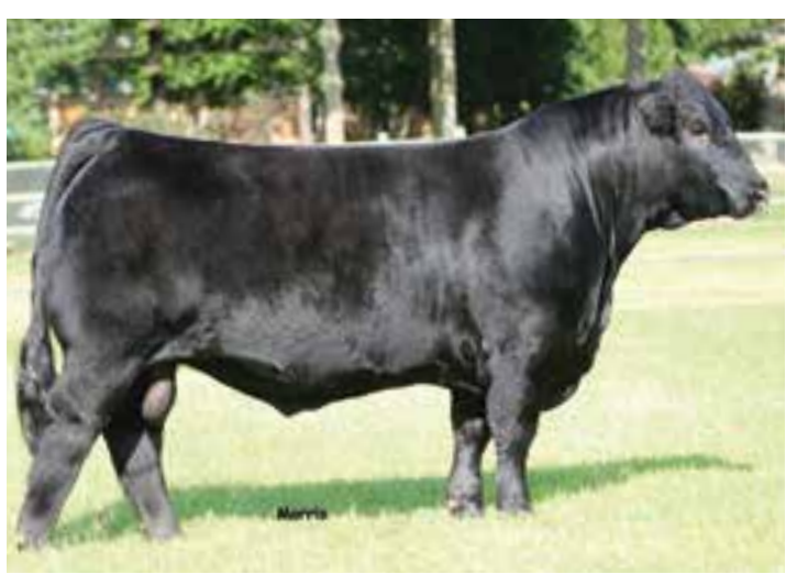
AUTO LUCKY STRIKE 117B | FLUSHMATE TO SIRE OF LOTS 74, 75 & 76

Another full sib to AUTO 425D and AUTO 442D, AUTO Ambrosia 423D is a homozygous polled and homozygous black female. We admire the length of body and sound structure on this female. When you put her on the move she tracks with an incredible amount of confidence. She will produce cattle with look, dimension and functionality.