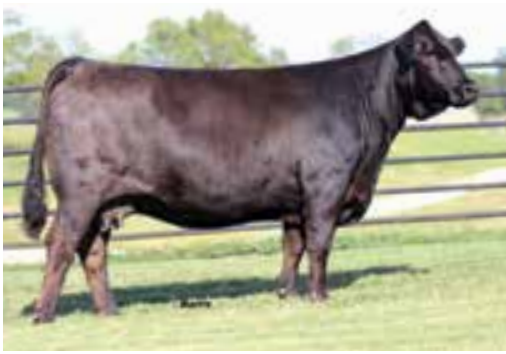
MAGS MANUELA | DAM OF LOT 46