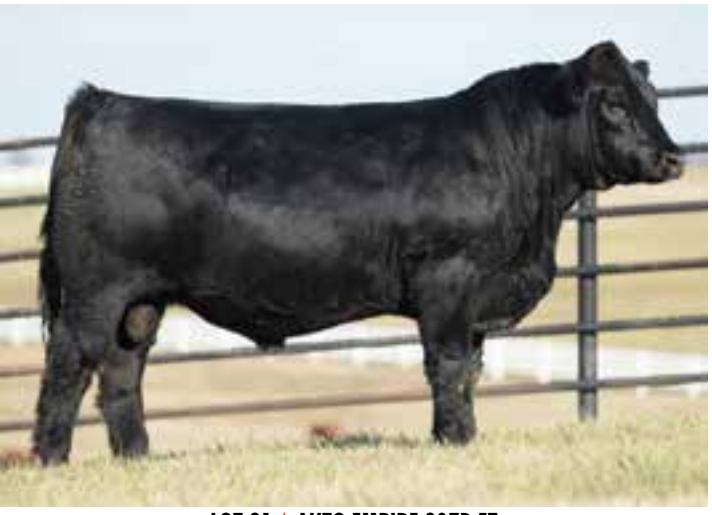
LOT 31 | AUTO EMPIRE 307D ET

MAGS Manuela, WLR Direct Hit, AUTO Luckie 246W and LH U Haul all in the first generation back in AUTO Star Wars 570D's pedigree, with that being said, he is bound to be epic and timeless. These cattle are bred to withstand the test of time and add good to programs from so many different angles that their value is hard to measure. 570D has some of the all-time greats in his lineage, and he possesses the DNA to produce one of the next great ones.