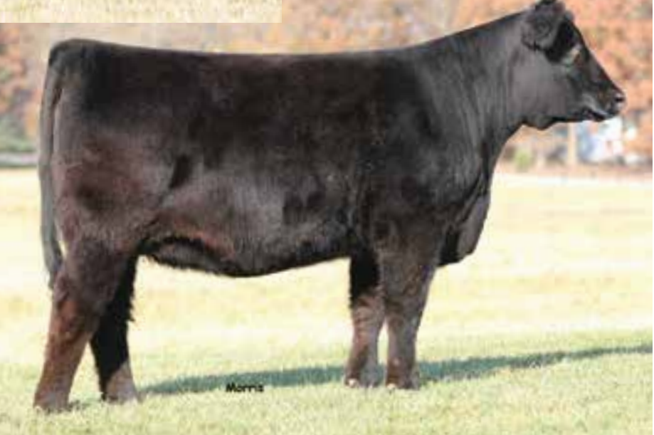
LOT 51 | AUTO DIOR 245D ET