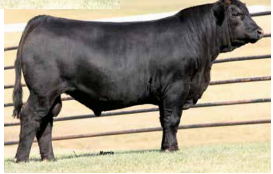
LOT 2 | AUTO BEST DEAL 559D