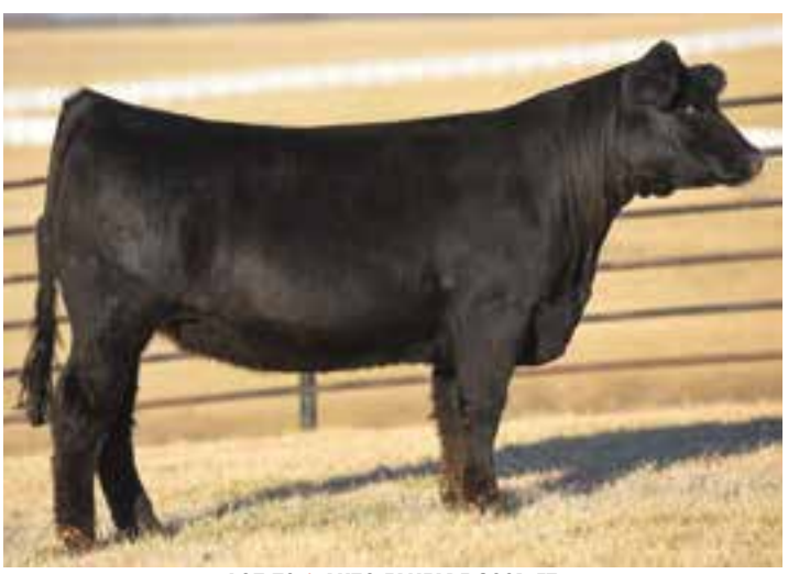
LOT 78 | AUTO FANFARE 299D ET