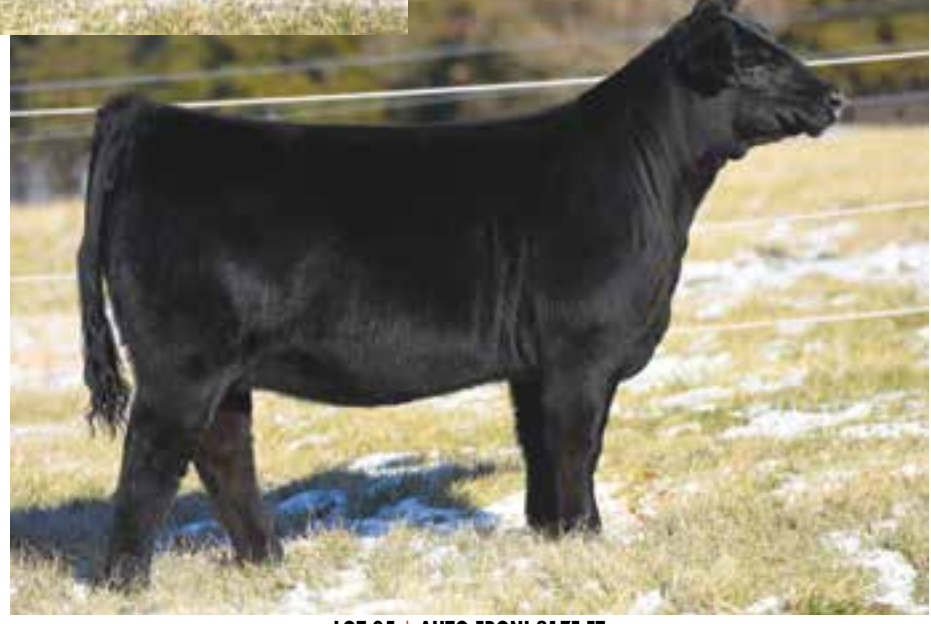
LOT 85 | AUTO EBONI 217E ET