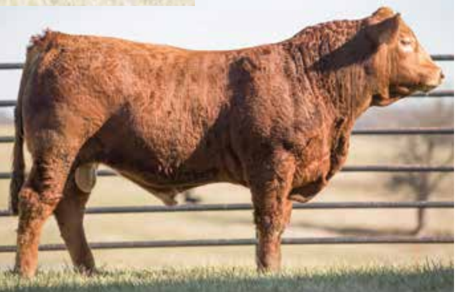
LOT 20 | AUTO GENUINE 147D ET