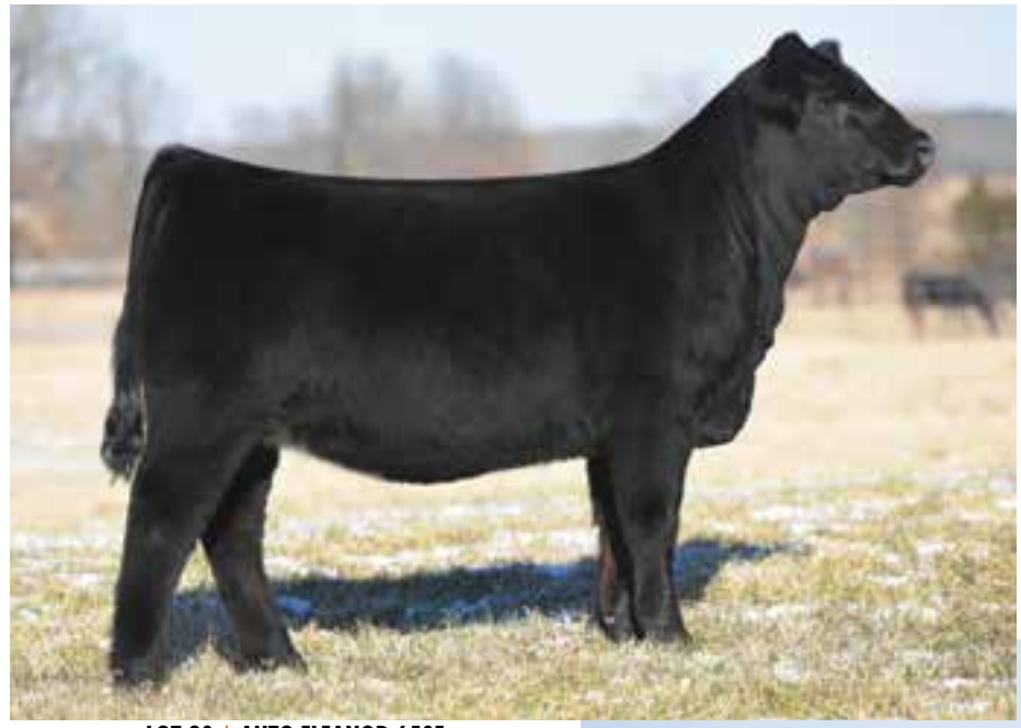
LOT 90 | AUTO ELEANOR 650E