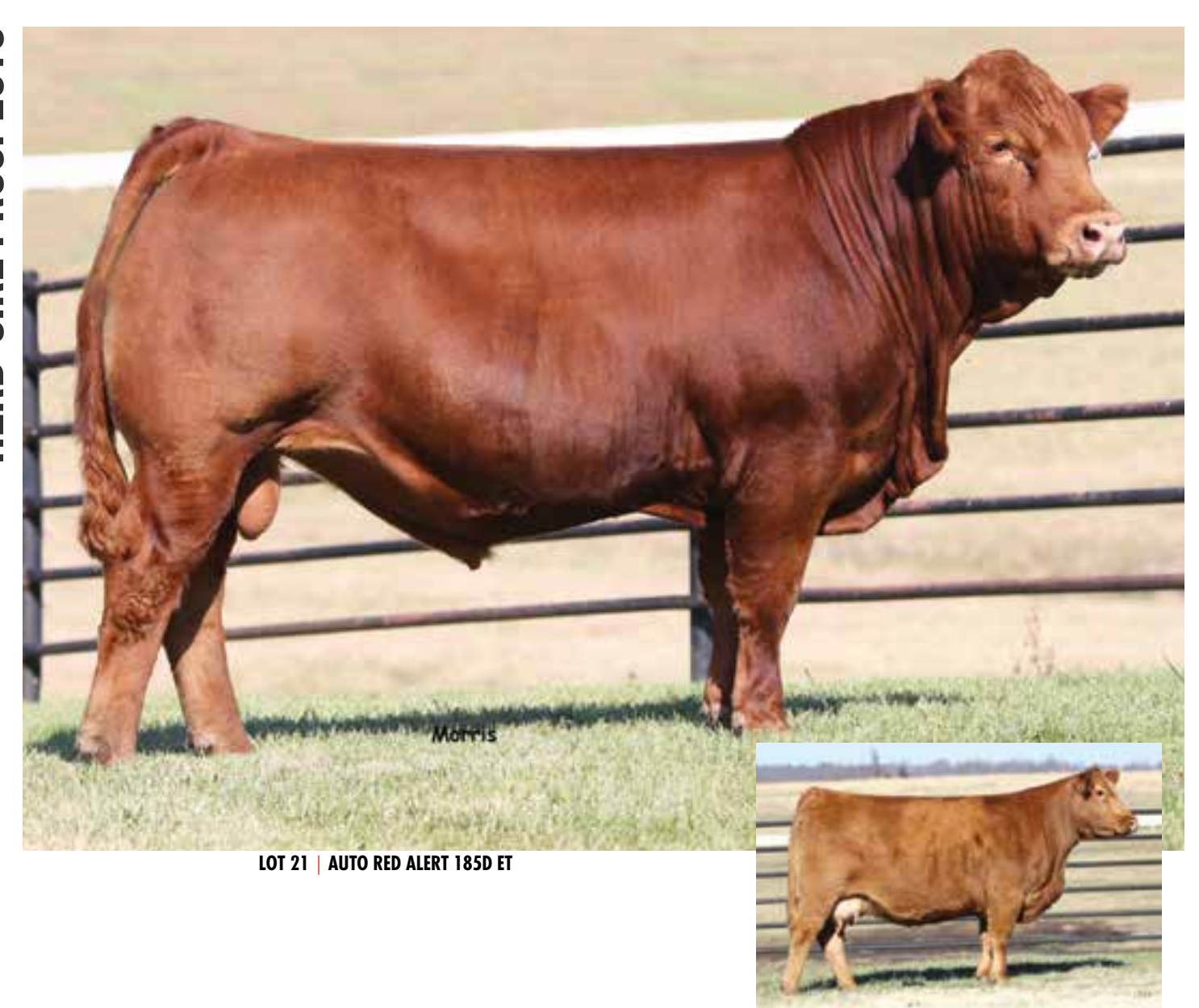
MAGS HANNAH 9726W | DAM OF LOTS 21 & 22