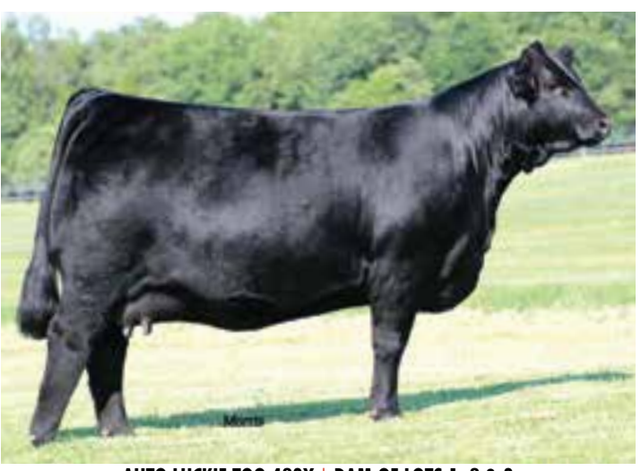
AUTO LUCKIE TOO 423Y | DAM OF LOTS 1, 2 & 3

It really has been a toss up as to which one of these trios we wanted to use for our Lot 1 bull this year, they all are as equally as impressive and will be similarly impactful in the Limousin population. AUTO Sweet Deal ratios a 98 for BW, 106 WW, 105 YW, indicating his spread from birth to yearling is legitimate and undeniably accurate. AUTO Cruze progeny are in high demand and seeking top dollar, there is no wonder why when you study these cattle from the ground up. Big footed, heavy boned, great topped and wide at their pin set. Their athleticism speaks for itself when you study the appropriate angles in their skeleton.