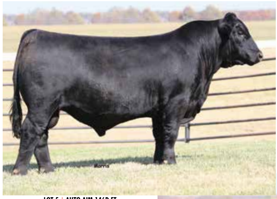
LOT 5 | AUTO AIM 146D ET