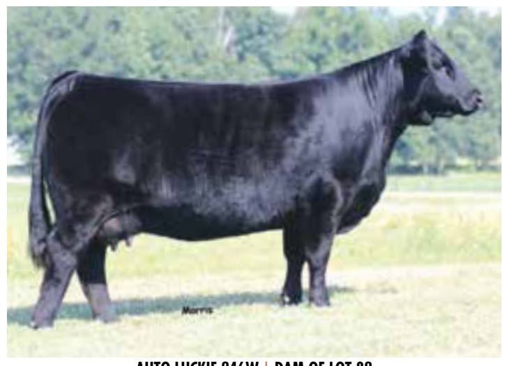
AUTO LUCKIE 246W | DAM OF LOT 82

This is one impressive daughter of AUTO Cruze 132X. Cruze is one of the hottest purebred bulls in the entire breed. His semen is not on the open market and what few progeny have surfaced in our program have topped sales and had numerous trips to the backdrop. Her dam, AUTO Luckie 246W is from the many-time show champion female who produces excellence time and time again. She is one that represents the AUTO prefix to-a-T. AUTO Emaline 267E is clean up through her head and neck, straight in her lines and very sound from her knee to the ground. She is a homozygous black, homozygous polled female who ranks in the top 25% for weaning weight.