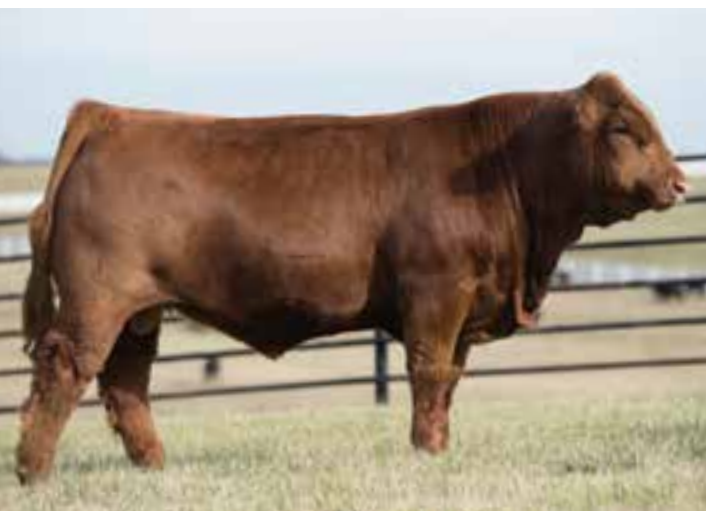
LOT 40 | AUTO RECALL 505E

Take a look at this high percentage polled, red bull, he is powerfully constructed, big middled and sound in his structure. He ranks in the top 2% of non-parent males for MK, and the top 15% for CEM. Recall is sired by the popular Fosdick sire FC Angels Answer, who is a full brother to the very popular 2015 Eastern Regional Junior Show Champion female for Micaela Fosdick, FC Beloved Angel. His dam, AUTO Rosalie, is a direct daughter of LH U Haul 135U, one of the most consistent birth to yearling spread bulls in the breed, out of the proven and predictable Pinegar donor, Carrousels Peaches 4330P.