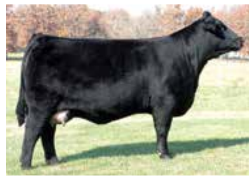
AUTO REBECA 292S | DAM OF LOTS 65 & 66