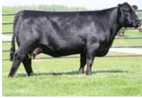
PBRS DUTCHES 790X | DAM OF LOT 80