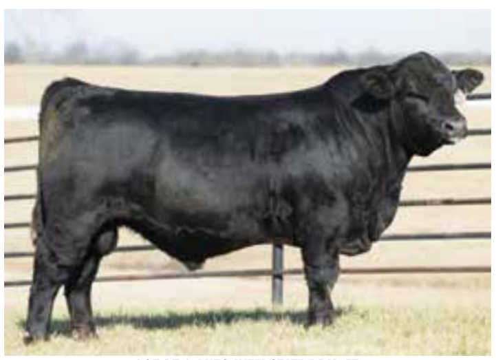
LOT 17 | AUTO INTERSTATE 154D ET