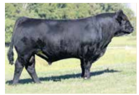
AUTO CRUZE 132X | SIRE OF LOTS 44 & 45