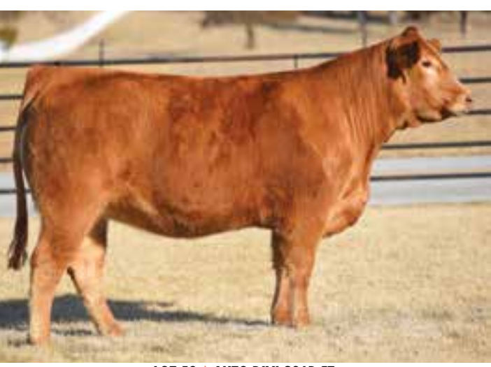
LOT 59 | AUTO DIVI 236D ET