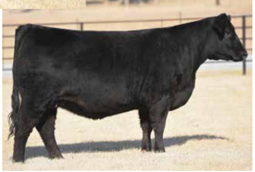
LOT 43 | AUTO DUSTY 217D ET