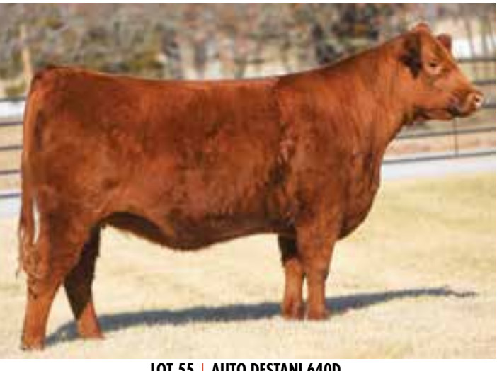
LOT 55 | AUTO DESTANI 640D