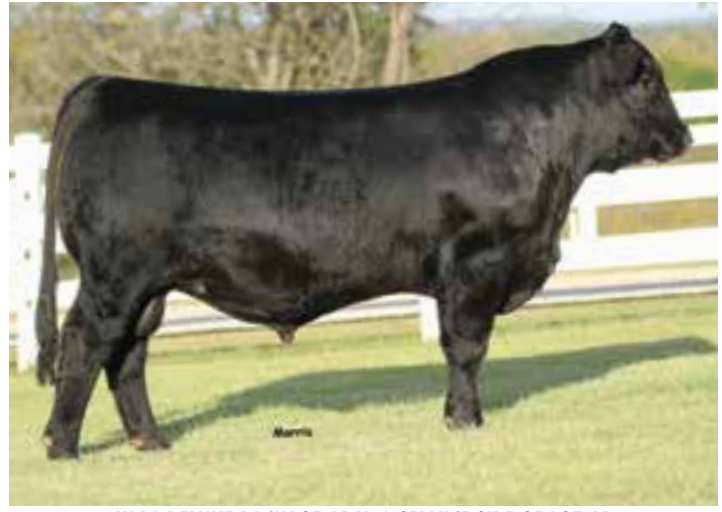
HBRL DELUXE PACKAGE 614D | SERVICE SIRE OF LOT 61

This homozygous black, homozygous polled daughter of MAGS Zarah is one you won't want to look past. Zarah is the Whitcomb son who has been producing some of the best showheifer prospects across the country. AUTO 281D's marbling EPD ranks in the top 25%. Her dam, AUTO Pamela 6622Y, is a daughter of the breed-leading MAGS Manuela cow and MAGS U Haul. Manuela has proven time and time again that she is the all-time leading donor of show champions and breed changers. AUTO Danica 281D is super long bodied and we love the set to her hind leg.