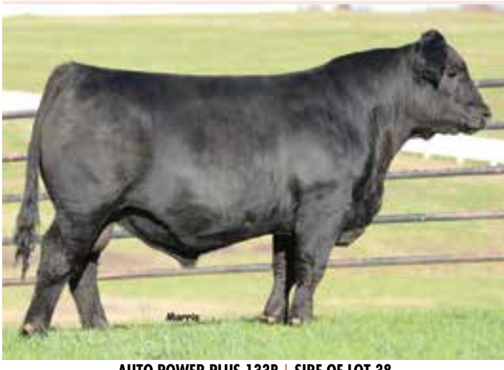
AUTO POWER PLUS 133B | SIRE OF LOT 38

AUTO Wide Trak 703D, son of AUTO Power Line 135B ET, who is by the leading Angus sire EXAR Denver and out of the leading Linhart Limousin donor EF Yadda Yadda 809Y. She is a daughter of the two-time National champion sire DHVO Deuce. His dam AUTO Bojo 421B ET, is a direct daughter of the world renown MAGS Manuela, the most prolific Pinegar donor to date having 241 recorded offspring, sired by EXAR Classen. He is homozygous polled, and is in the top 5% for MB and the top 10% for SMTI.