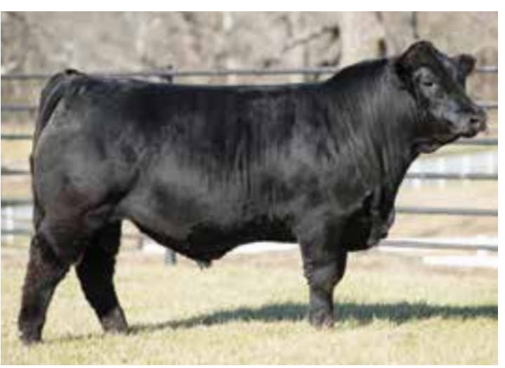
LOT 27 | AUTO DISCOVERY 564D