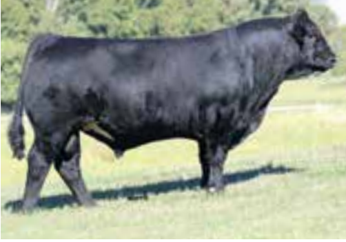
AUTO CRUZE 132X | SIRE OF LOTS 1, 2 & 3