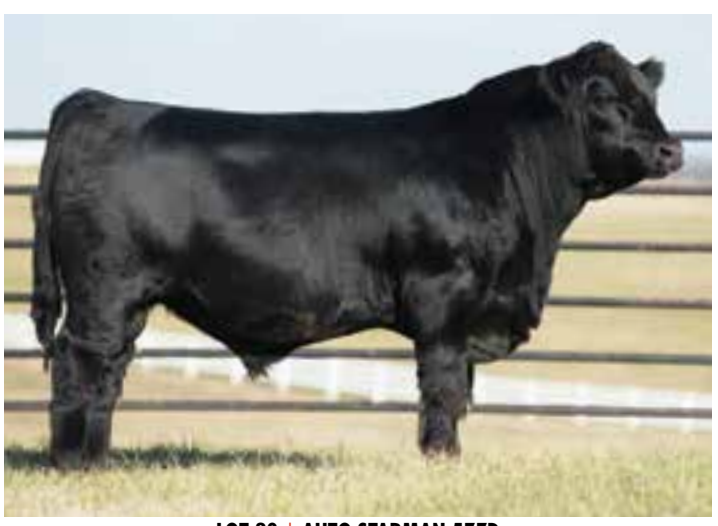
LOT 28 | AUTO STARMAN 577D