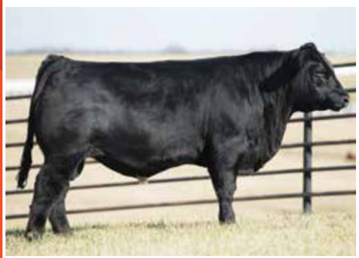
LOT 18 | AUTO ENTERPRISE 100E ET