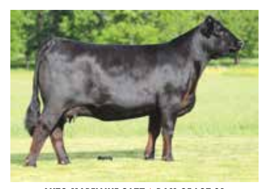
AUTO MABELLINE 267Z | DAM OF LOT 81