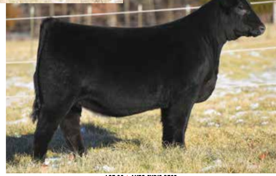
LOT 89 | AUTO EYDIE 278E