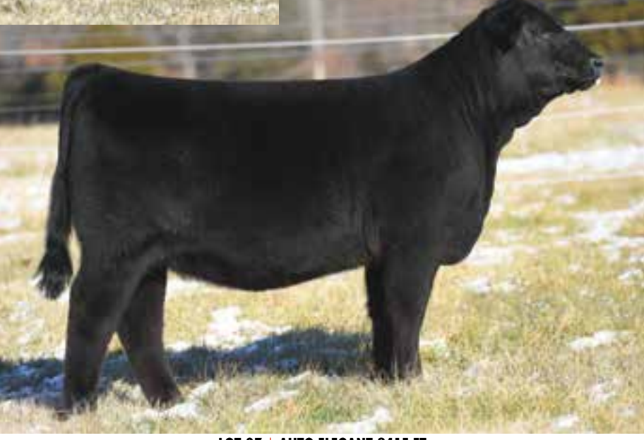
LOT 87 | AUTO ELEGANT 241E ET