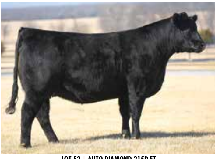
LOT 52 | AUTO DIAMOND 215D ET

AUTO Diamond 215D is a SAV Brand Name 9115 daughter. Brand Name was the top-selling bull in the record-setting 2010 Schaff Angus Valley Bull Sale. He is out of the famed Bismarck bull. Her dam, EXLR Luvly 080T is an elite donor of ours who is out of LESF Asphalt. This female is homozygous polled and heterozygous black. She is a 50% Lim-Flex female. We admire the length of body this female has and how clean fronted she is through her front one third. She has a tremendous amount of muscle expression and depth of body.