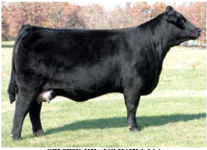
AUTO REBECA 292S | DAM OF LOTS 4, 5 & 6

When we originally mated these cattle, we had NALF convert the Tour of Duty numbers over for us and it was a no-brainer to flush Rebeca that way. Thankfully, the results were a surefire and right on target. 198D is in the top 2% for WW, top 3% for YW and a trait leader for T M. At just 16 months of age, 198D has the power of a mature bull, yet still as sound and fresh as a weanling. A full sister to 198D, 146D and 199D is a highlight in this sale as well.