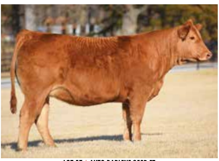
LOT 57 | AUTO DARLENE 259D ET