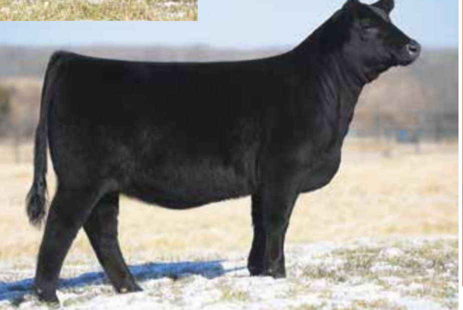
LOT 91 | AUTO EASTON 261E ET