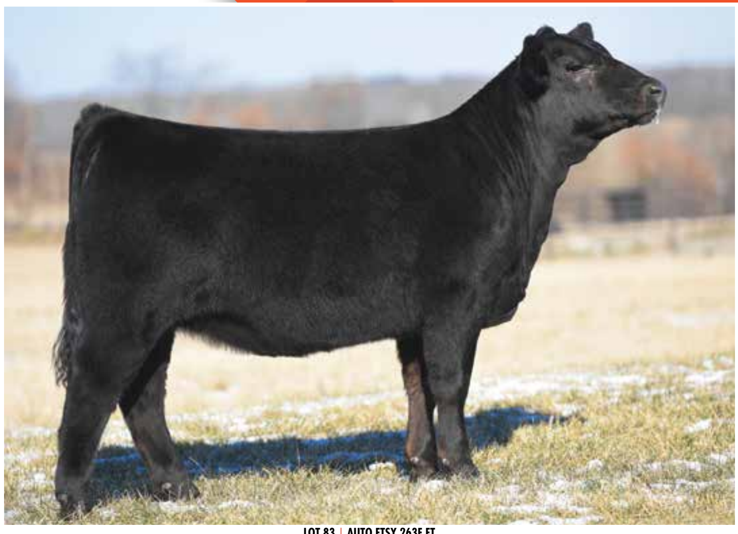
LOT 83 | AUTO ETSY 263E ET