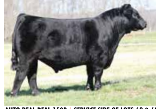
AUTO REAL DEAL 150B | SERVICE SIRE OF LOTS 62 & 63