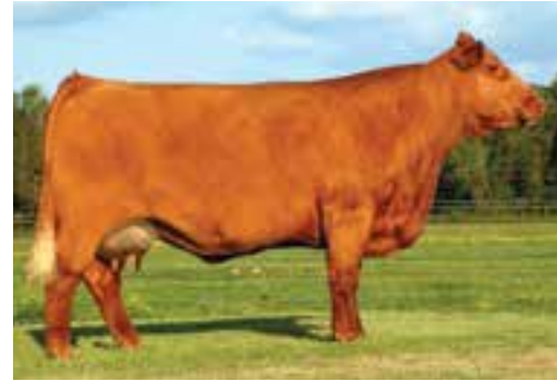
CARROUSELS PEACHES 4430P | DAM OF LOT 42