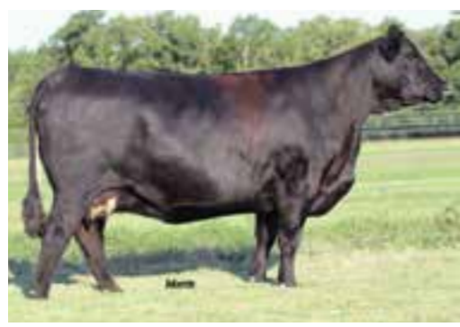
SBLX UNNA 391U | MATERNAL SISTER TO LOTS 48 & 49

DONOR FOR COUNSIL FAMILY LIMOUSIN & DEMAR FARMS