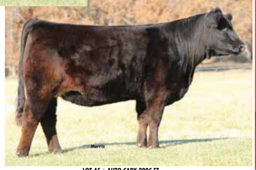
LOT 45 | AUTO CARY 299C ET