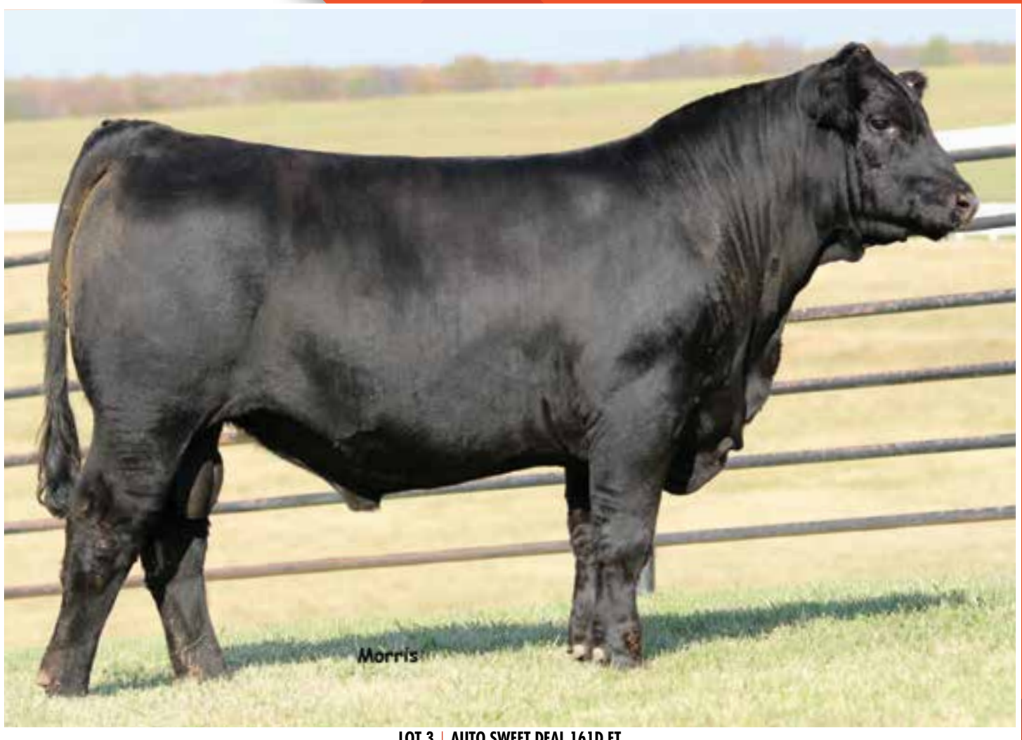
LOT 3 | AUTO SWEET DEAL 161D ET