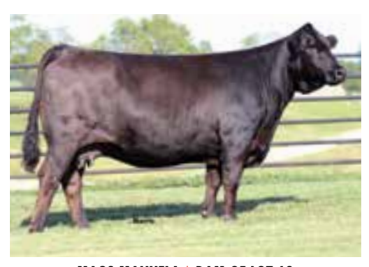
MAGS MANUELA | DAM OF LOT 63