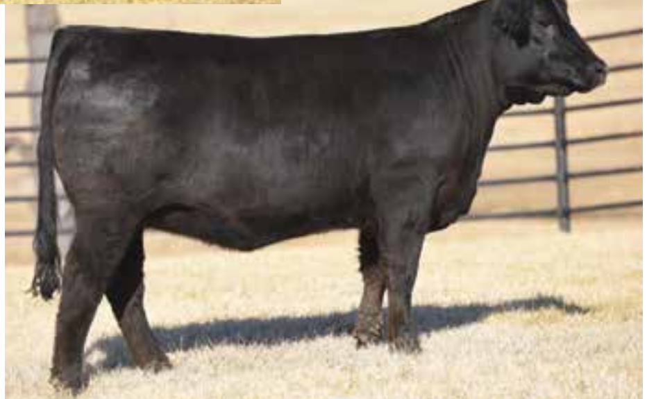
LOT 63 | AUTO PARKER 401D ET