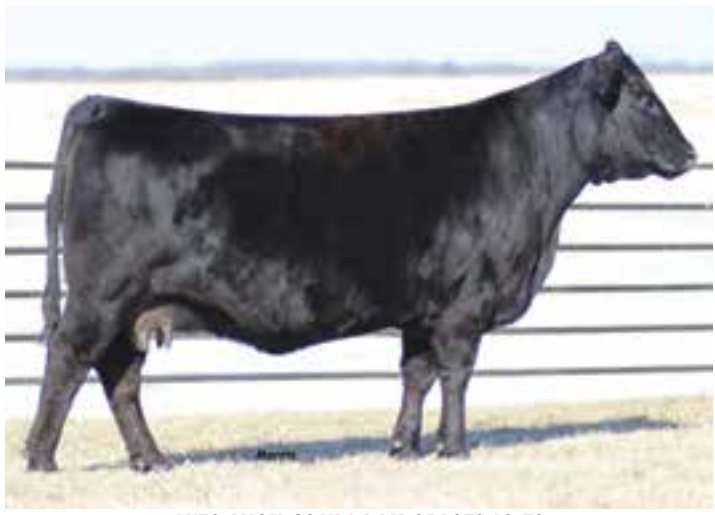
AUTO ANGEL 236U | DAM OF LOTS 69-73

AUTO Black Jewell 450D is a daughter of the Stowers Limousin herd sire, AUTO Power Plus 133B, a son of the popular EXAR Denver 2002B. Her dam is the popular AUTO Angel 236U. This 75% Lim-Flex female is homozygous polled and homozygous black. Her milk and yearling weight EPDs rank in the top 10%. Big bellied and stout at the ground is how we like to describe this female.