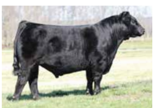
AUTO REAL DEAL 150B | SIRE OF LOT 85