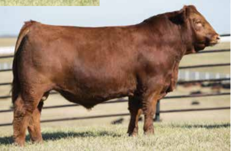
LOT 12 | AUTO BROKER 181D ET