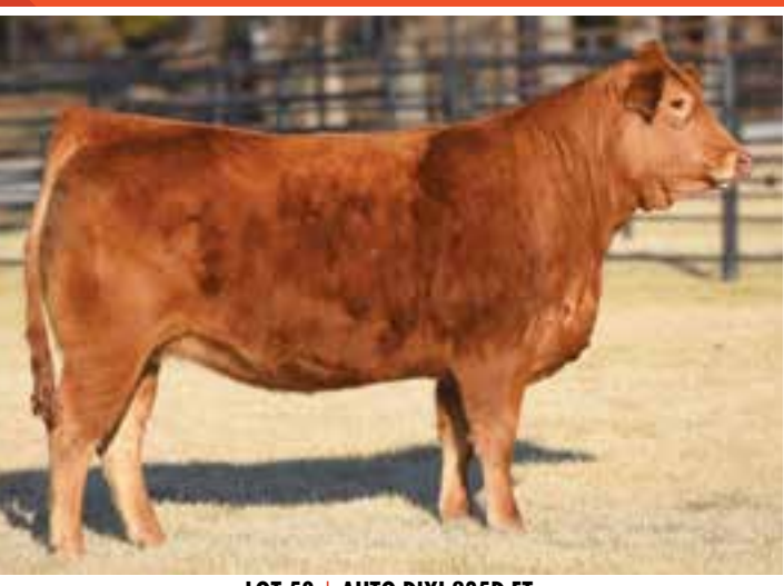
LOT 58 | AUTO DIXI 235D ET

AUTO Donlita 237D is a purebred daughter of Posthaven Polled Yellowstone. Her milk EPD ranks in the top 10%. She is super broody in her makeup, heavy muscled and structurally sound. This female will produce cattle that have tremendous muscle expression, thickness and performance.