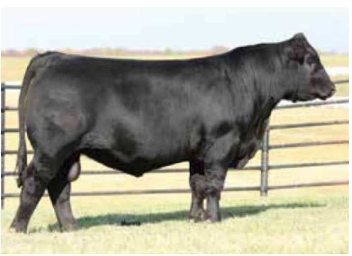
LOT 15 | AUTO CIRCUIT BREAKER 157D ET

AUTO Circuit Breaker is a maternal brother to one of the hottest heifers on the 2018 show circuit, LFL Daisy 6061D ET. Folks, this pedigree is absolutely timeless! You can search far and wide and not find a pedigree as proven as this one is. 157D's dam is out of one of the most significant flushes in the history of the Limousin breed, her flushmates consist of DHVO Deuce, DHVO Trey and Ava Jo, to name just a few. This homozygous black son of LH Rodemaster is 75% Lim-Flex who had an adjusted YW or 1,211 and 37 cm. SC.