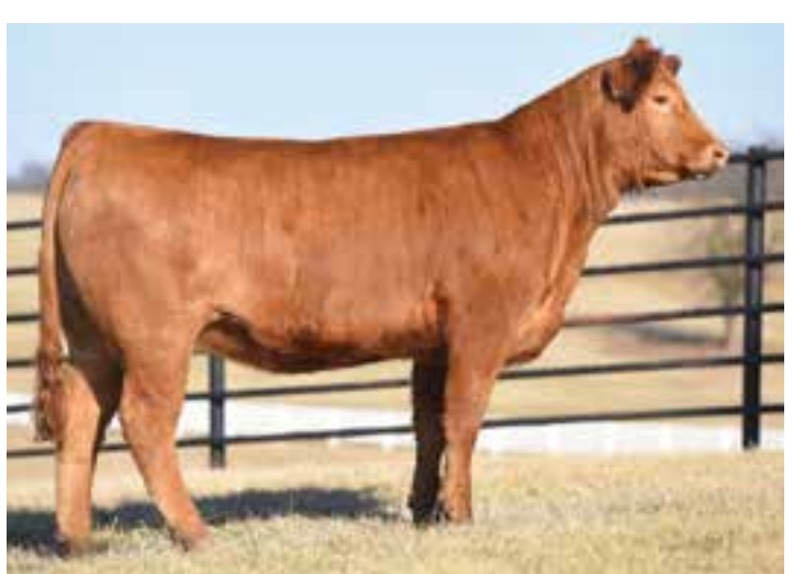
LOT 79 | AUTO APPLE 292D ET