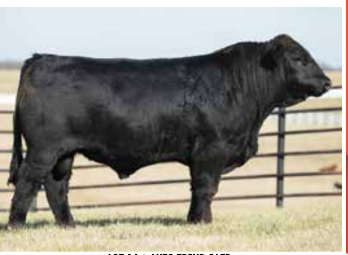
LOT 14 | AUTO TREND 567D

When we purchased HBRL Baby 479B from Buck Ridge Cattle Co. it was noted that her future was limitless, and they weren't exaggerating, AUTO Trend 567D is her first calf and she did an exceptional job. 567D is a special double homozygous son of MAGS Zodiac. Trend is double digits for CED and 119 for YW, all the while ranking in the top 25% for MB. Study this pedigree and there is an intriguing alignment of impactful, breed-changing sires such as Connealy Consensus 7229, DHVO Deuce 132R and MAGS Winston.