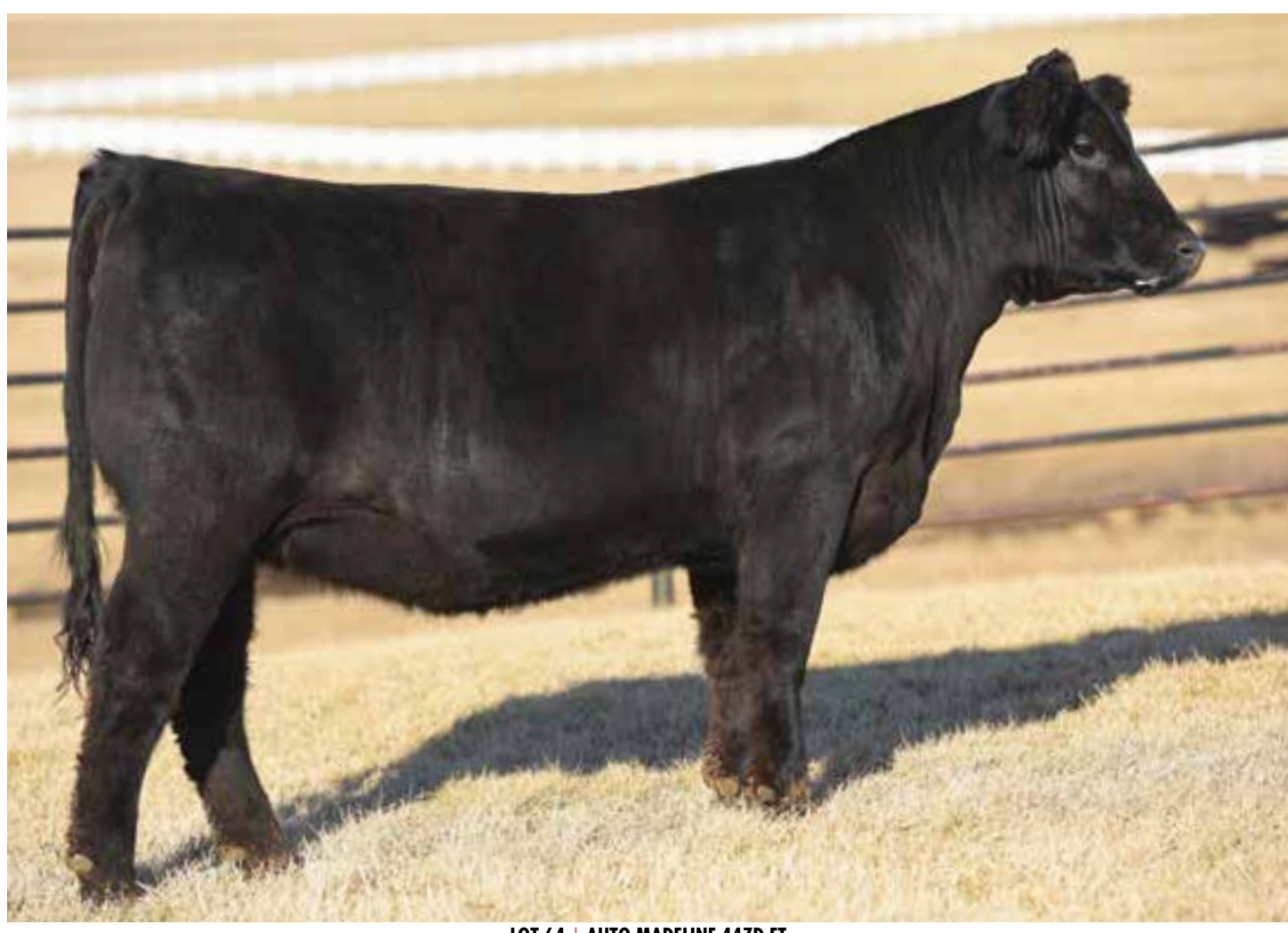
LOT 64 | AUTO MADELINE 447D ET