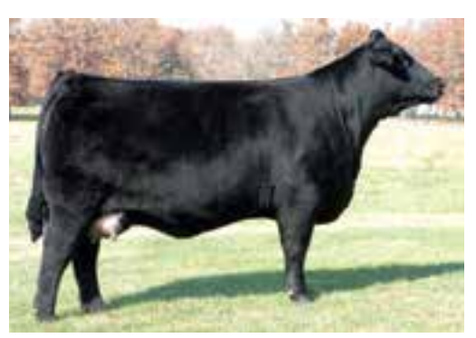
AUTO REBECA 292S | DAM OF LOT 43