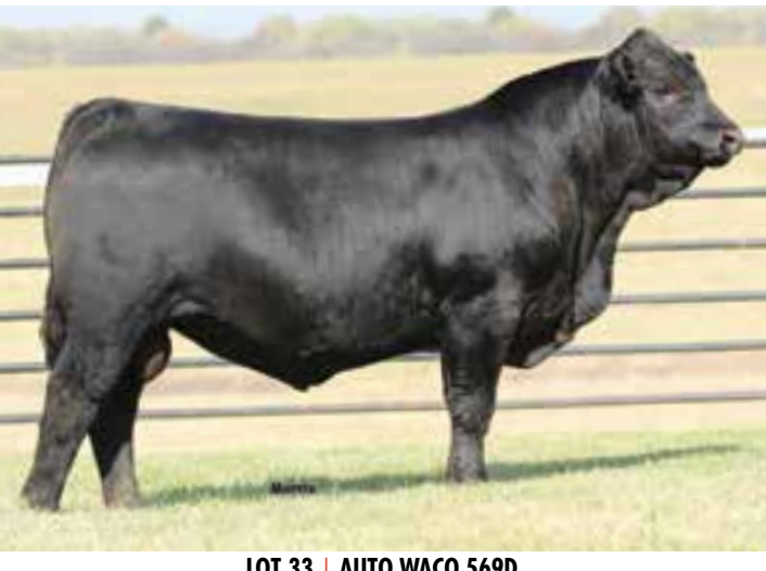
LOT 33 | AUTO WACO 569D