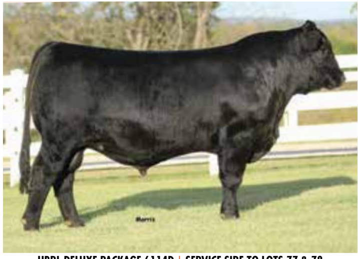
HBRL DELUXE PACKAGE 6114D | SERVICE SIRE TO LOTS 77 & 78