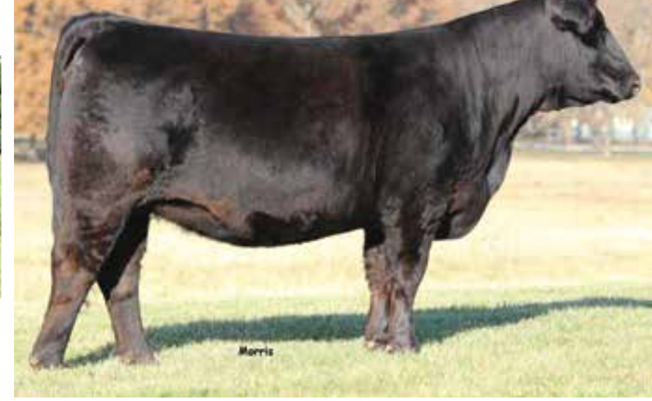
LOT 49 | AUTO CINDEE 160C ET

DONOR FOR COUNSIL FAMILY LIMOUSIN & DEMAR FARMS