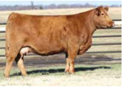
MAGS HANNAH 9726W | DAM OF LOTS 11 & 12