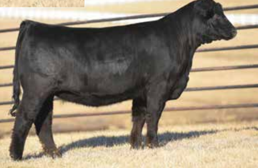
LOT 65 | AUTO POWER GIRL 424D ET