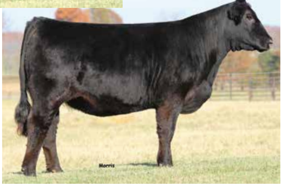
LOT 47 | AUTO DANITA 222D ET