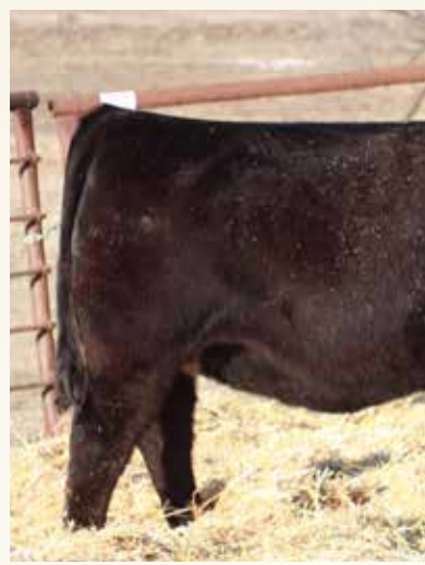
DAM OF L