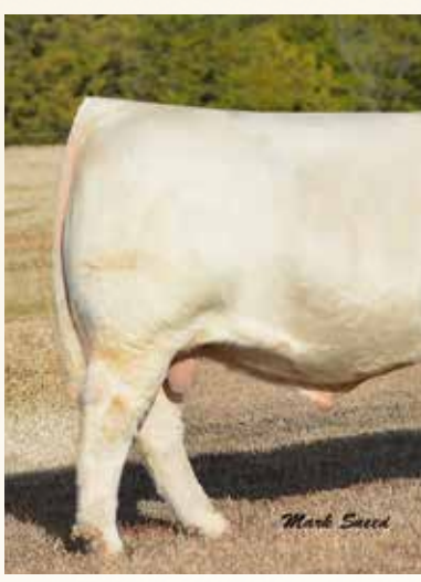
SIRE OF LO