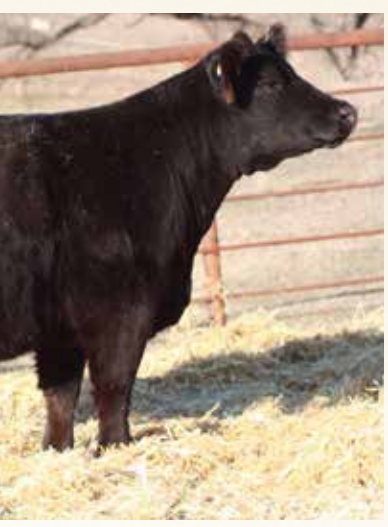
OTS 14 - 16

IPU BENTLEY 81F CLAYHILL FANCY LUCA 39A YARDLEY HIGH REGARD W242 HARRELL ANGEL 5870C W/C MISS ANGEL 2870Z