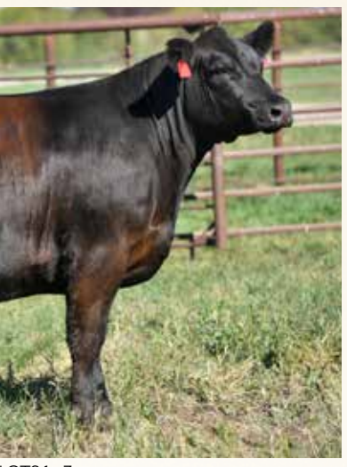
LOTS 1 - 3

W/C BANKROLL 811D W/C FORT KNOX 609F K-LER DOLLY`S QUEEN 609D W/C NIGHT WATCH 84E RUST MS NIGHT ROSE 903G RUST MISS ROSE 7302E