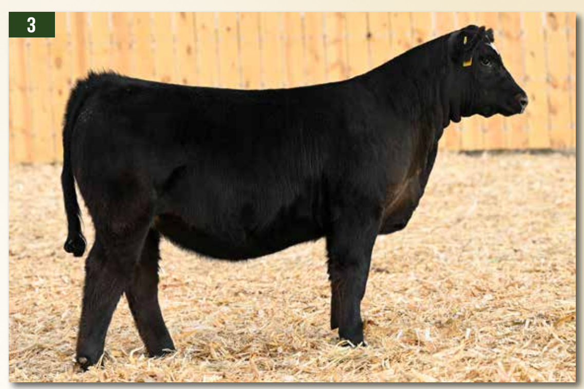
Full sib to Lot 2 & 3

W/C BANKROLL 811D W/C FORT KNOX 609F K-LER DOLLY`S QUEEN 609D W/C NIGHT WATCH 84E RUST MS NIGHT ROSE 903G RUST MISS ROSE 7302E