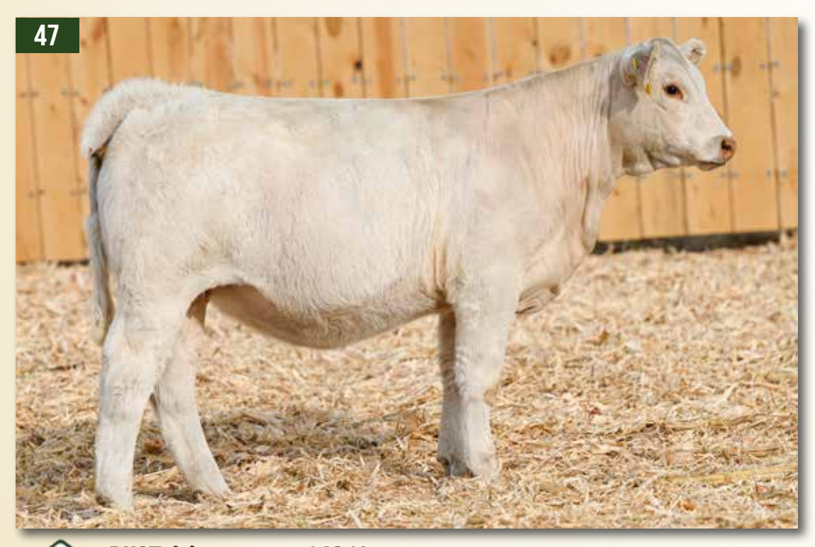
sire LT LEDGER 0332 P DCR MR SUBSTANCE A240 JCH MS DOUBT W25 TR MR FIRE WATER 5792RET HARVIE MS IMPRESSIVE 267Z THOMAS MS IMPRESSIVE0641