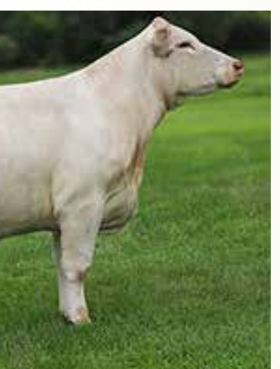
NOR DAME IN LOTS 38 - 47