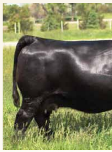
DAM OF L