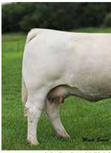
SYDNEY - FULL SIB TO DO