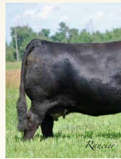
202Z :: GRANDAM OF LOTS 5 & 6 AND

WLE COPACETIC E02 CMFM JOY 02ZB SVS CAPTAIN MORGAN 11Z NOT JUST A FLIRT 404B RF CERTAINLY FLIRTIN 202Z