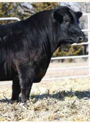
DTS 24 - 26

HOOK`S BOZEMAN 8B MR SR 71 RIGHT NOW E1538 MISS SR C1538