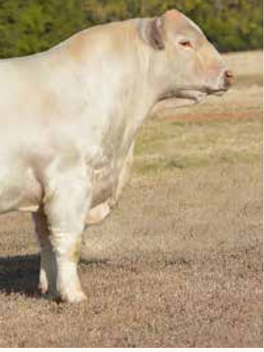
TS 42 - 48