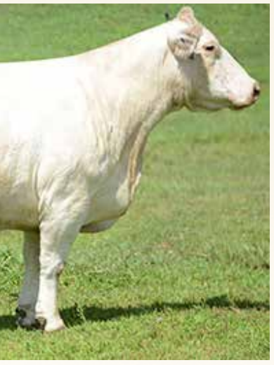
1 OF LOTS 38 - 47

LT LEDGER 0332 P DCR MR SUBSTANCE A240 JCH MS DOUBT W25