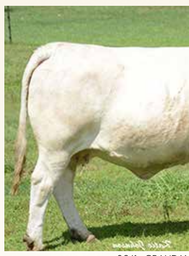
0641 - GRANDAN