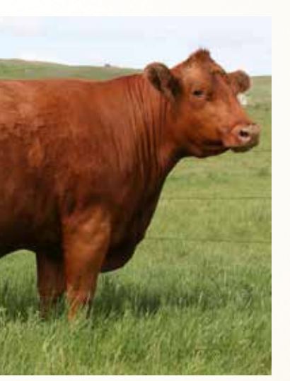
NDAM OF LOTS 27 - 29

Sadie M68 is one of the original Simmental purchases for RMVR and that great breeding female was the dam of TNT Top Gun who never missed. It is rewarding to continually see some of our very best still branching back to that impressive past donor. The Sadie cow line has always been good footed, solid udder and highly productive.