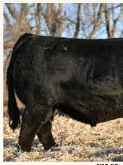
MAF DRUNKEN SAILOR 266C MAF PATRIOT 32F MAF SABRINA 89B SVS CAPTAIN MORGAN 11Z RUST MISS ROSE 7302E SOO LINE ROSE 1019

RUST Ms Rose 034H 3/4 Simmental BW 78 Adj. WW 593 WWMilk MWW API ΤI 8.2 103.9 68.7 79.6 23.7 63.4 29.8 0.02