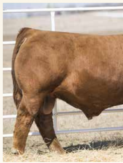
SIRE OF L