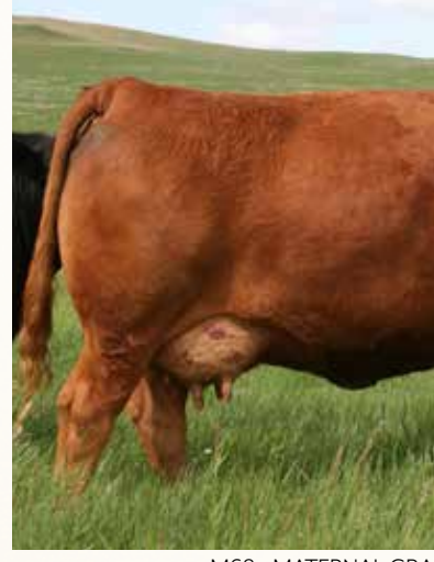
M68 - MATERNAL GRA