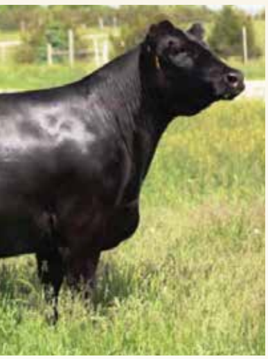
OTS 9 - 12

SING S A V PRESIDENT 6847 S A V AMERICA 8018 S A V MADAME PRIDE 0075 WAGR DREAM CATCHER 03R MISS WERNING KP 8543U MISS WERNING 534R