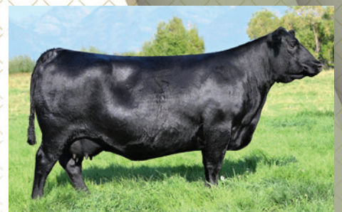
LAWSONS CHLOE C815 Donor Dam