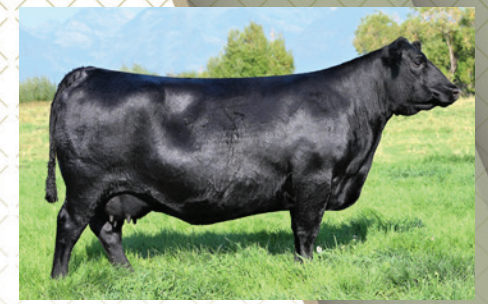
LAWSONS CHLOE C815 Donor Dam

EXPORTABLE TO CANADA GUARANTEE 1 PREGNANCY REVERSE SORT FEMALE