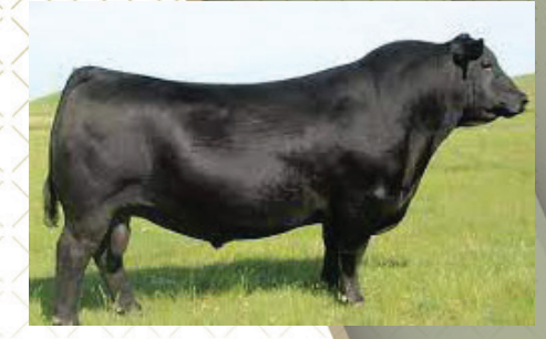
SAVRENOWN 3439 Sire of Lawsons Chloe C815