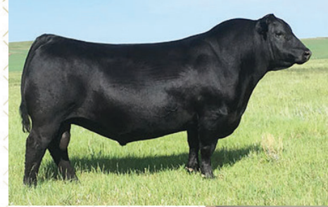
SAV PRESIDENT 6847 Sire of S A V One Nation 9558