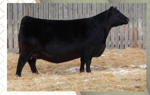
BROOKING BEAUTY 8187 Dam of Rust Forged of Fire 0412