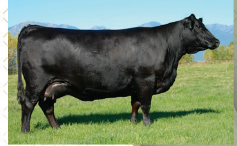
COLEMAN DONNA 714 Dam of Coleman Bravo 6313

EXPORTABLE TO CANADA GUARANTEE 1 PREGNANCY REVERSE SORT FEMALE