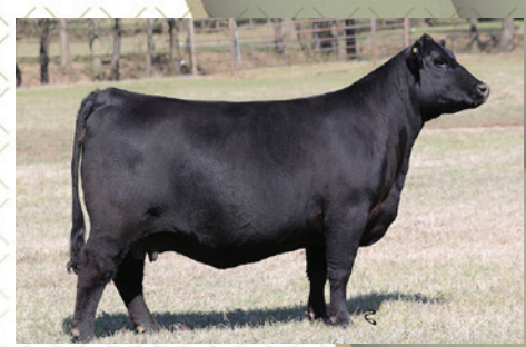
CONLEY SANDY 8355 Dam of Conley Verified 0853